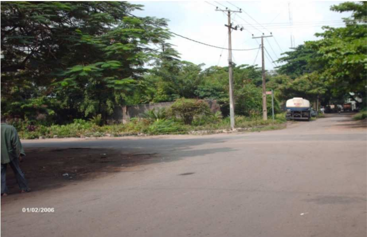
Plate 1. One of the Commercial Horticulture Gardens, together with Trees planted for Public use along the Street in Eti-Osa Local Government Area, Lagos State, Nigeria.

Land area used for urban commercial horticulture for this study was obtained from data collected through physical measurement of each plot of land used for the practice and information obtained from secondary source on total area covered by land and water bodies in the study area. Below is a simple mathematical calculation of the land area used for horticultural gardening in the study area: