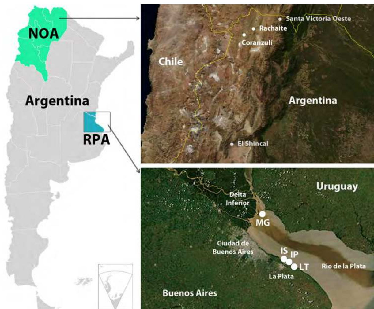
Fig. 1. Study areas: NOA, Northwest of Argentina area; RPA, Río de la Plata area. Sampling locations in both areas on satellite image of NASA. MG: Isla Martín García; IS: isla Santiago; IP: Isla Paulino; LT: Los Talas