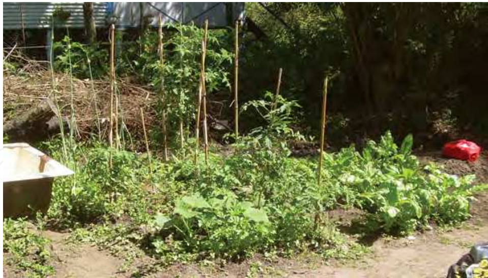
Fig. 3. A typical RPA homegarden (Isla Paulino)