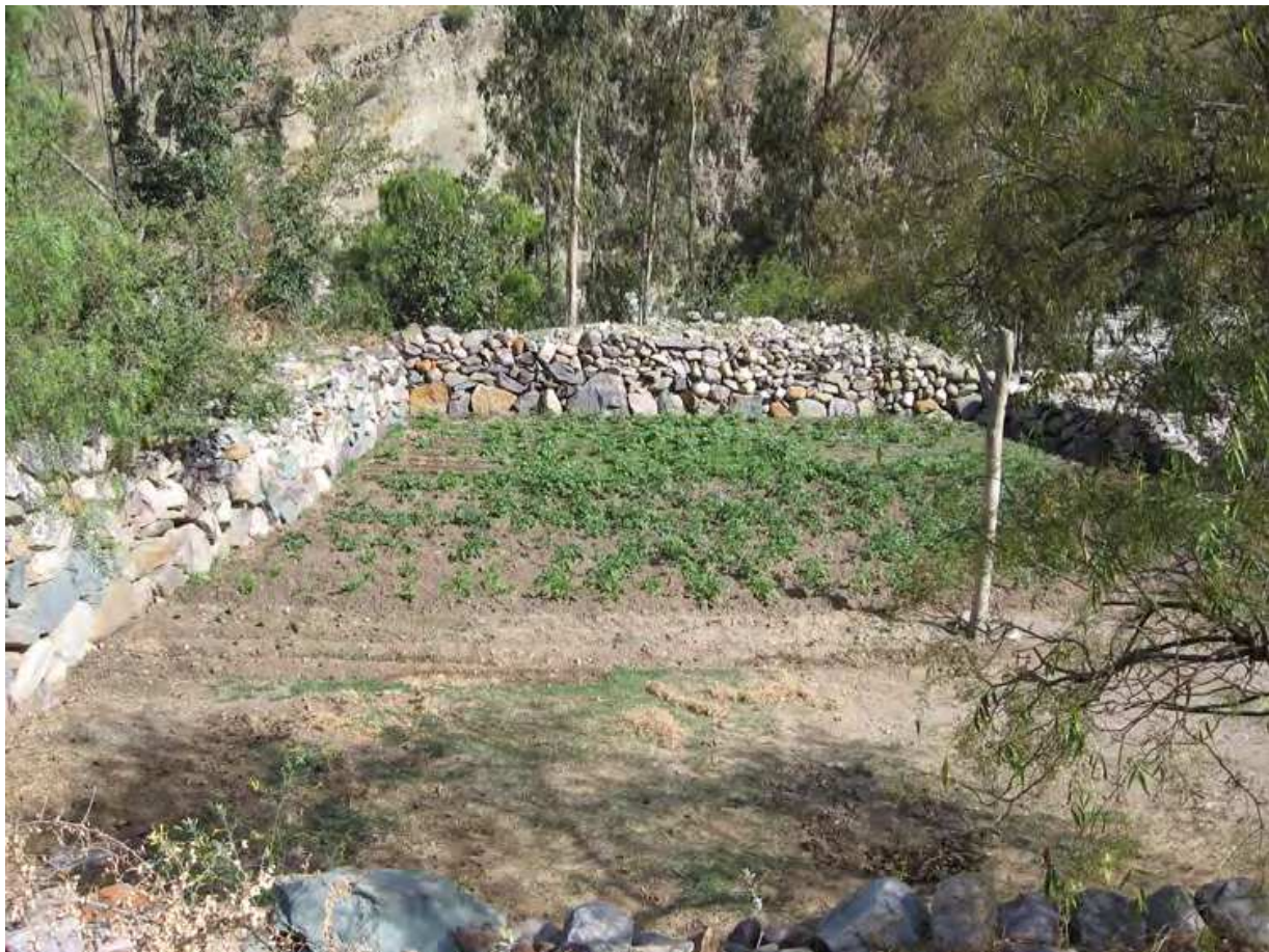
Fig. 2. A typical NOA homegarden (Santa Victoria Oeste)