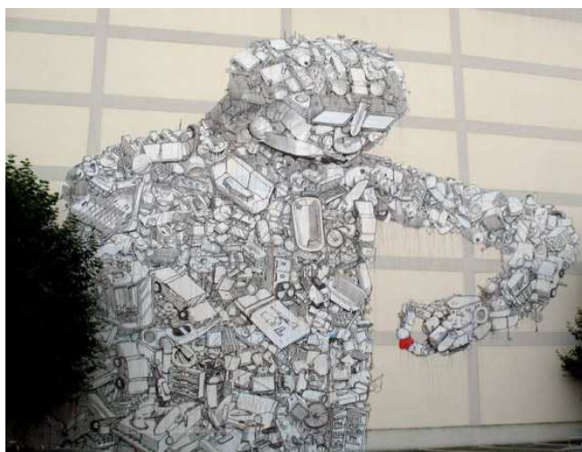
Fig. 1. Bluewallberlin (Blu: 2011)

Ethnography as method has been changing in recent years for many reasons and in different cultural contexts. Bororo, Xavante or Kayapò – if I focus exclusively Brazilian cultures with whom I've been doing research in a "native" fieldwork – are increasingly involved on presenting their rituals by themselves through digital technologies; the same is occurring inside urban youth cultures and their self-production on music, street art, style or expanded design and so on, whose languages are understandable only through their autonomous visions and reflections; transurbanism is their ethnographic fluid context (Mudler: 2002). This accelerated trans-cultural process is spreading out new kinds of subjectivities as well as diasporic citizenship through digital communication.