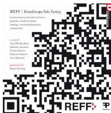
Fig. 2. REFF

FakePress is an experimental group that is exploring and introducing Augmented Reality themes, describing the approaches used in the creation of digital layers of information, expression and communication which are seamlessly integrated with the physical world and which allow for independent, free, autonomous representation and enactment of our points of view on reality. They are exploring the multiple definitions which can be given to the concept of Augmented Reality , starting from the more philosophical and ethnographic ones and arriving to the ones which are more oriented to art, business, activism, marketing and communication. The idea of being able to create additional layers of accessible information stratified on top of our ordinary reality, expressing multiple points of view and approaches to the world, became clear and suggested scenarios and ideas.