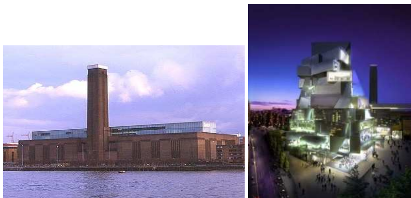
Fig. 3. Flyer - Tate Modern 1 – Tate Modern 2

Digital cultures performs an auratic reproducibility.