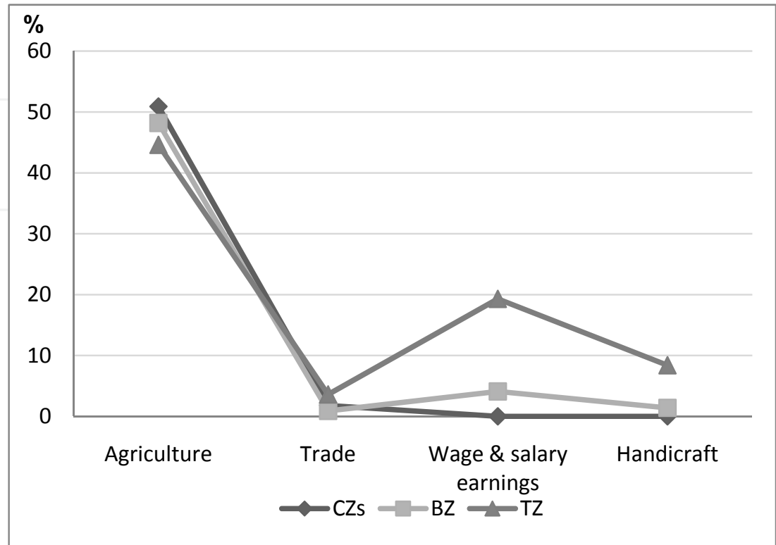
Fig. 2. Ratio of main occupation in different zones (Data appendix used for the compilation of the graph are available from the authors)

decreased significantly from the TZ to the CZs. Likewise, the threat on the forest resources in the TZ may be less than that in two other zones.