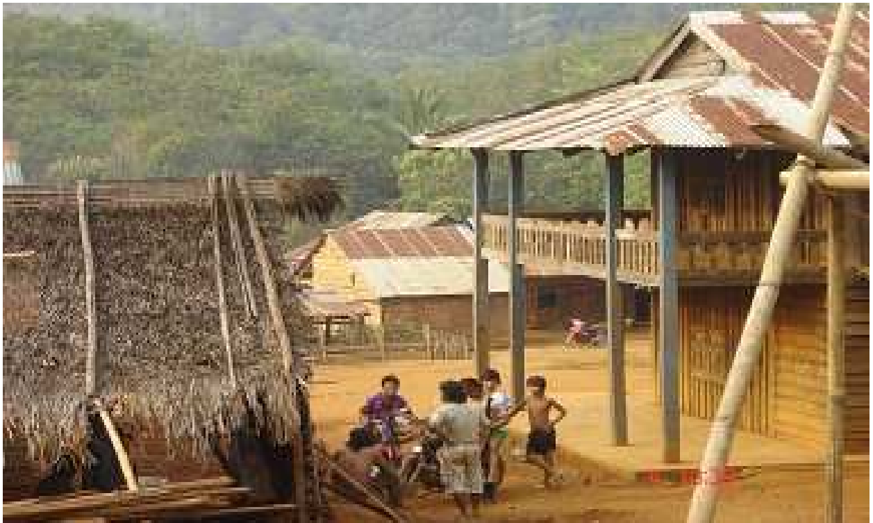
Fig. A6. A surveyed hamlet with cashew plantations in the CZ in Cat Loc Sector