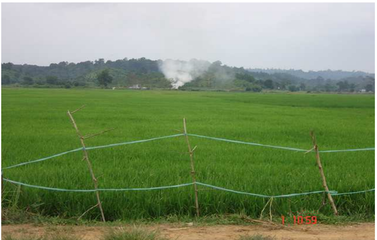
Fig. A7. Rice field in Ta Lai Commune in the BZ, a former area of the CZ Source: Photo by Dinh Thanh Sang; Sang, 2006