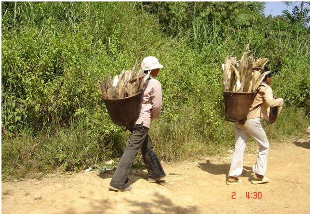
Fig. A3. Young women carrying fuel wood from the forest Source: Photo by Dinh Thanh Sang; Sang, 2006