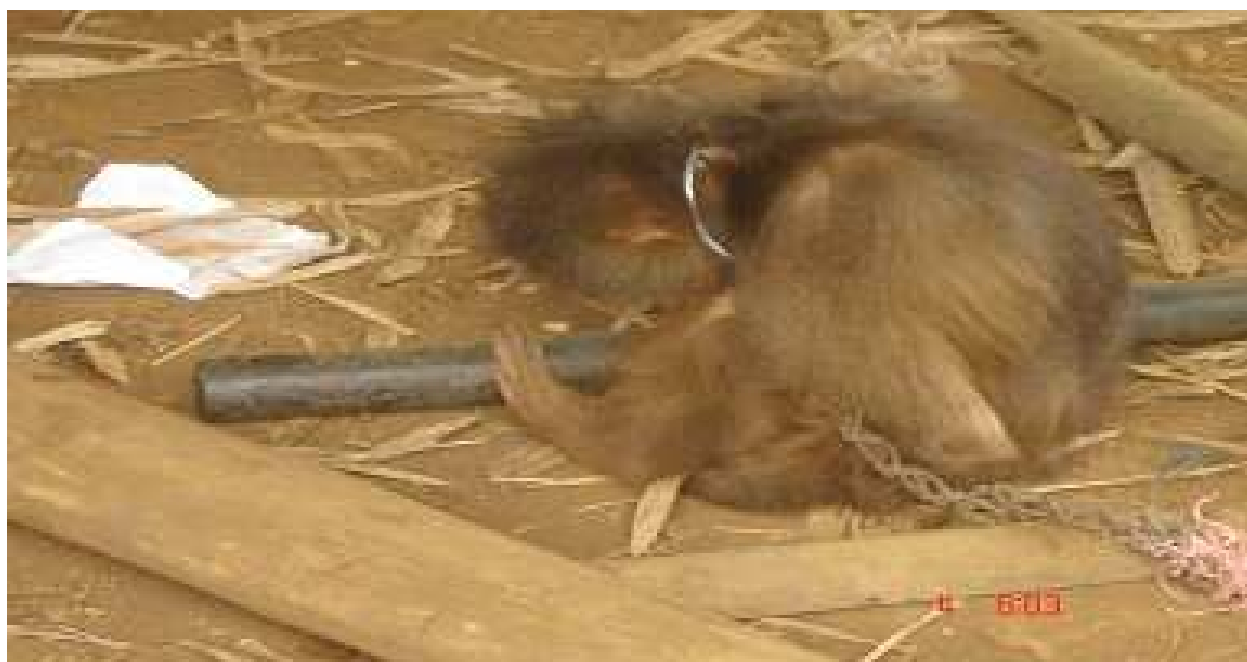
Fig. A1. A captured monkey in the surveyed hamlet in the CZ in Cat Loc Sector