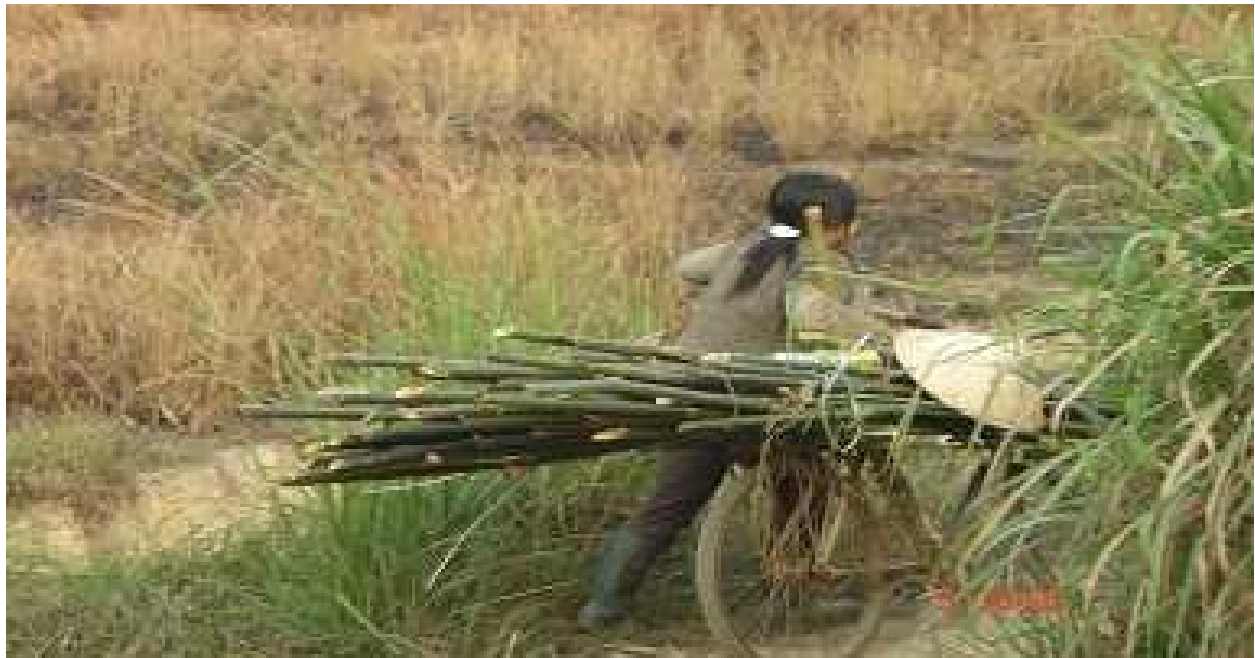
Fig. A2. A young woman carrying bamboo poles by bicycle