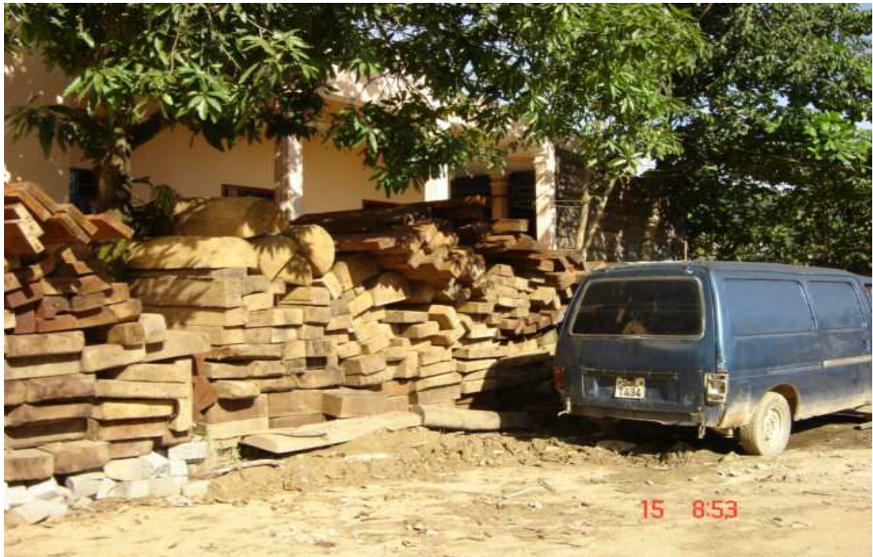
Fig. A4. Timber and a car of illegal loggers confiscated by forest guards in TZ, Lam Dong Province

Source: Photo by Dinh Thanh Sang; Sang, 2006