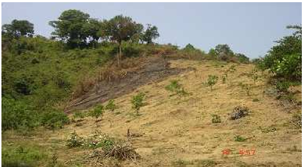
Fig. A5. A deforested upland with some young cashew trees in the CZ in West Cat Tien