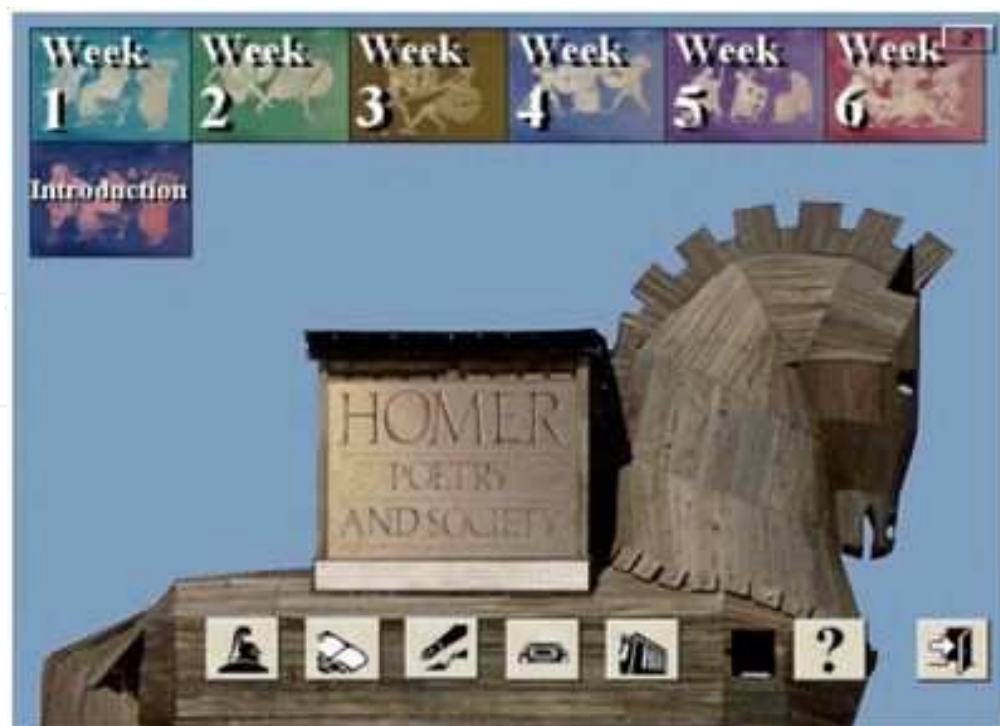
Fig. 3. Screen shot from A295 Homer: Poetry and Society

From the illustration of the Homer multimedia package it can be seen that the structure of the work packages relates to each week of the course and these have been organized as an introduction and then six weekly sessions.