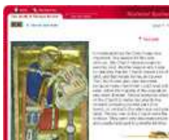
Fig. 1. Screen shot from Medieval Realms, British Library

The excellent British Library's package has been developed over a long period to include: historical information, real documents, music, arts and poetry but had a complex interface. Aimed at school pupils, the package assumed knowledge in many of these specific fields in order to be able to select information. During testing of the package with the planned age group this knowledge was not apparent and they spent a lot of time trying to work out how to find the material. Giving the developers an idea of how complex they found the package, and the types of searches or information the users needed, allowed a total redesign of the interface. Keeping the high quality underlying information base meant that the redesign was specifically targeted at the interface. The redesign made the resource easier to use and with far greater hit rates for the relevant searches.