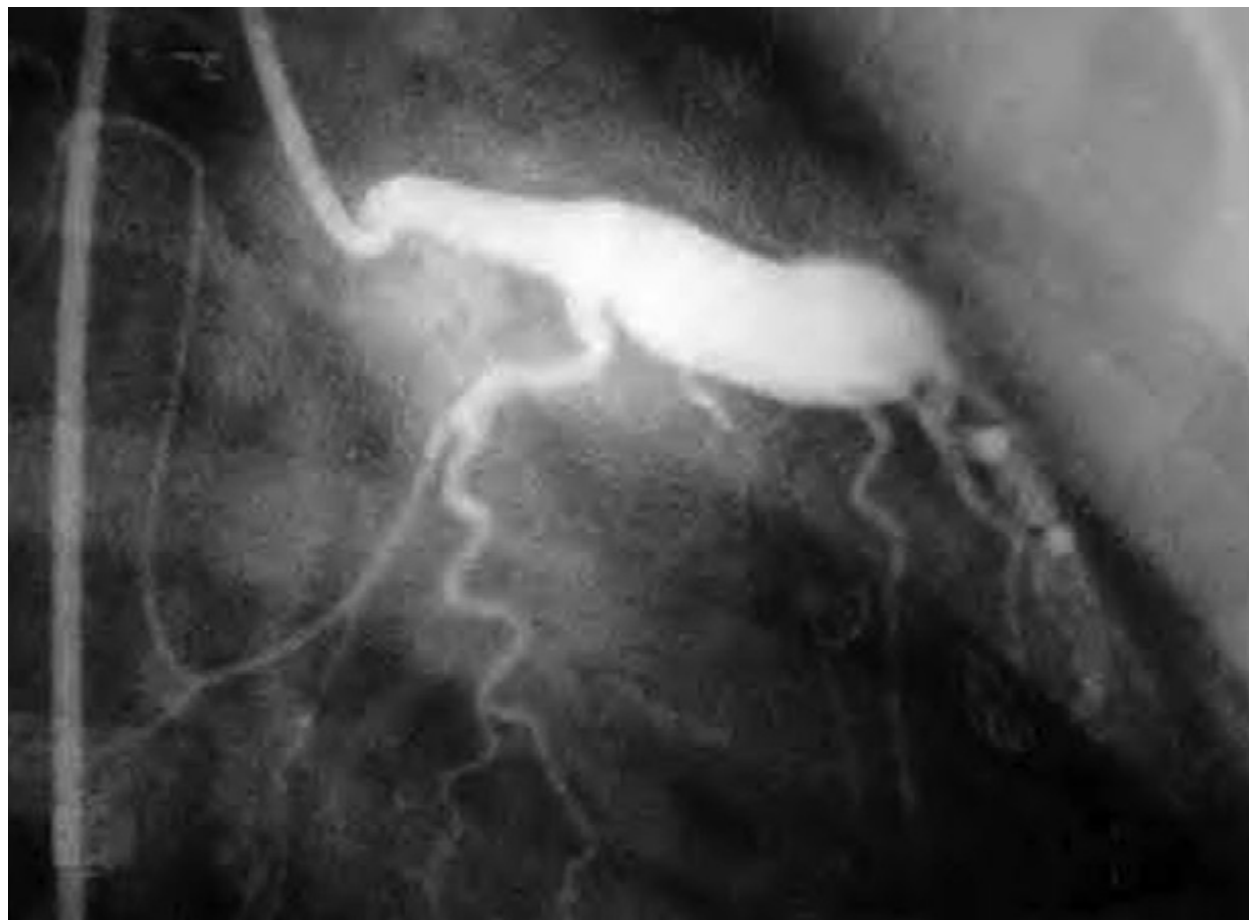
Fig. 2. Coronary-artery aneurysm in a patient with Kawasaki disease (Hewins & Jayne, 2010).

Despite treatment of acute phase with intravenous immunoglobulin and aspirin, up to 5% of Kawasaki disease patients, still continued to develop serious cardiac life-threatening complications, mainly giant coronary aneurysms and thrombotic stenoses, resulted in myocardial infarction and/or death. (Caballero-Mora et al., 2011; De Castro et al., 2009; Hata & Onouchi, 2009; LaPellegrin et al., 2011; Lin et al., 2011; Tsuda et al., 2011; Wood & Tulloh, 2009).