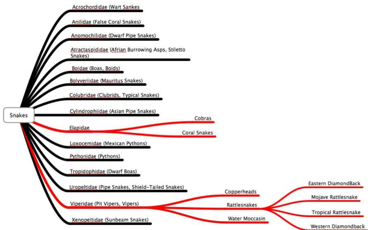
Fig. 1. Diagram that shows the fifteen families of snakes in the world. The families marked in red contain the most important and dangerous snakes in America.

In this chapter, we are going to be focusing on the snakes most commonly found in the Americas, more specifically in North America (the United States and Northern México), These snakes are from the Elapidae and the Viperidae families such as the pit viper, the rattlesnake, the water moccasin, and the copperhead, since they are responsible for about 99% of the cases reported. The coral snake, which can also be found in North America, is responsible for only 1% of the cases, along with the exotic imported species.