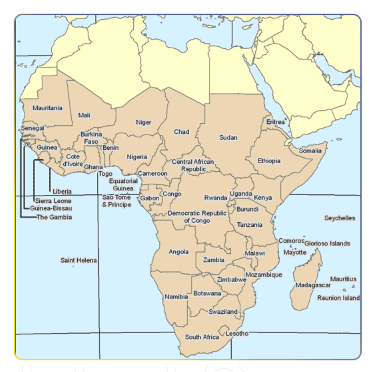
Fig. 1. Map showing the countries of Sub Sahara Africa (NB Southern Sudan became independent July 2011)

hospital and regional based cancer registry figures, reports from specific centres, conference proceedings and a review of work done on cervical cancer in the authors institution The University College Hospital Ibadan Nigeria.