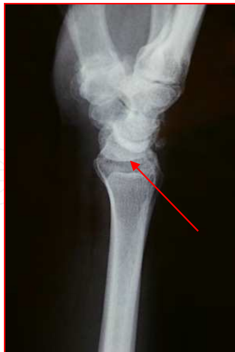
Fig. 3. Lateral Radiograph of SLAC Wrist