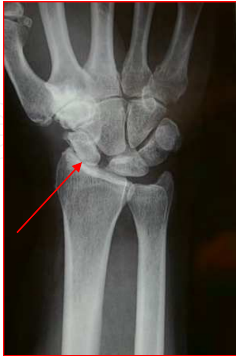
Fig. 2. PA Radiograph SLAC Wrist