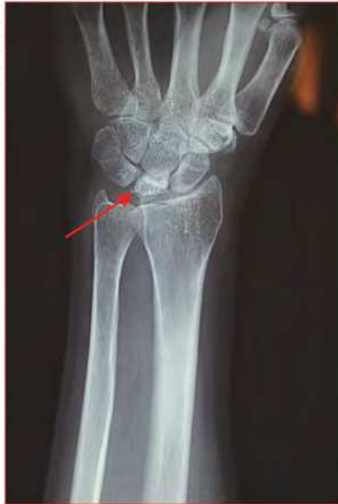
Fig. 9. PA Radiograph of Kienbock Disease

Stage I disease demonstrates mild pain, normal radiographs, and early degenerative changes on MRI. Stage II disease presents with increased pain, edema, and radiographs show increased lunate density. Stage III is divided into IIIA and IIIB. In stage IIIA radiographs show lunate collapse without scapholunate instability while stage IIIB disease shows lunate collapse with scapholunate instability. Stage IV is characteristic of pancarpal arthrosis. (Saunders and Lichtman 2011)