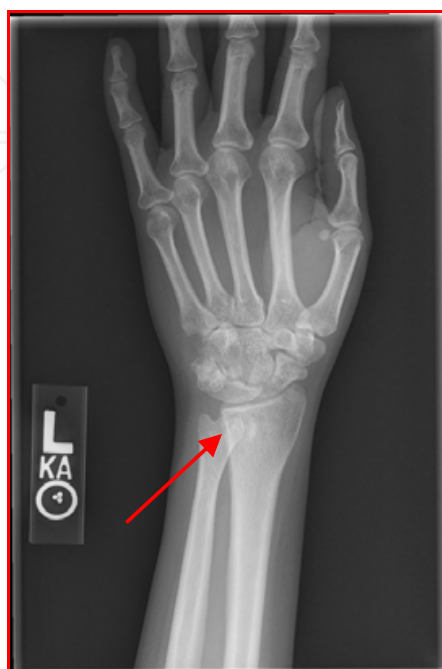
Fig. 4. PA Radiograph of Osteoarthritis of the DRUJ

ligaments (af Ekenstam, Palmer et al. 1984). The blood supply is provided by the anterior interosseous artery, the ulnar artery, and the medullary interosseous arteries. Understandably, those structures with ample blood supply, like the TFCC, are able to heal readily while the avascular structures, like the articular disc, are less able to do so. The annular ligament supports the proximal radioulnar joint and the interosseous membrane serves as a connection between the diaphysis of the radius and ulna.