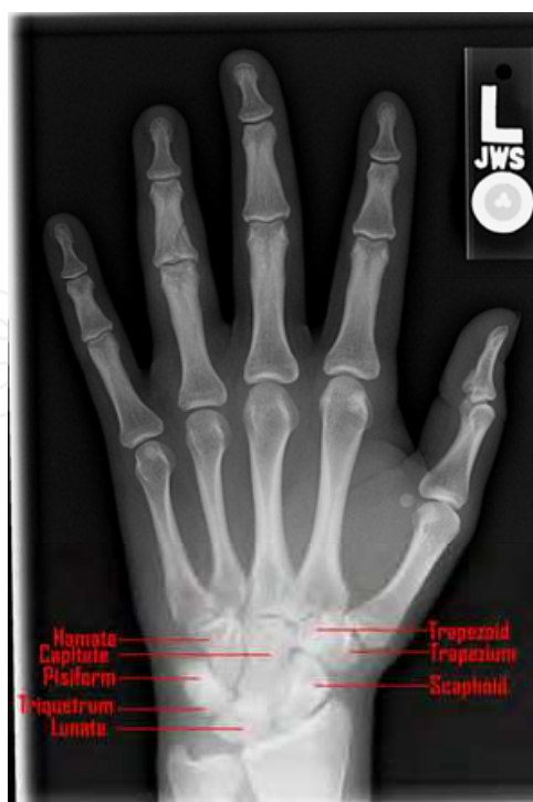
Fig. 1. PA Radiograph of Normal Wrist

Imaging studies are another valuable tool at the physician's disposal that allows him or her to better determine which joints are affected by the degenerative processes. The standard x-ray series should include a posteroanterior (PA), oblique, and lateral view.. A wrist with normal anatomic relationships will show that the radial shaft, capitate, and third metacarpal will line up along the same vertical axis in the PA wrist x-ray. The physician's initial evaluation should focus on the radioscaphoid, radiolunate and capitolunate joints. A secondary evaluation should include assessment of the Carpometacarpal, scapho-trapezium-trapezoid (STT), ulnocarpal and distal radioulnar joint (Weiss and Rodner 2007). The articular surface of the radiocarpal joints can sometimes be better seen with a tangeiental view. Radioscaphoid and STT joints can be seen best with radial and ulnar deviation views. Carpal tunnel and oblique supination views are excellent for the evaluation of the pisotriquetral joint (Peterson and Szabo 2006). As always, to control for normal anatomic variation, all findings should be compared with the contralateral wrist.