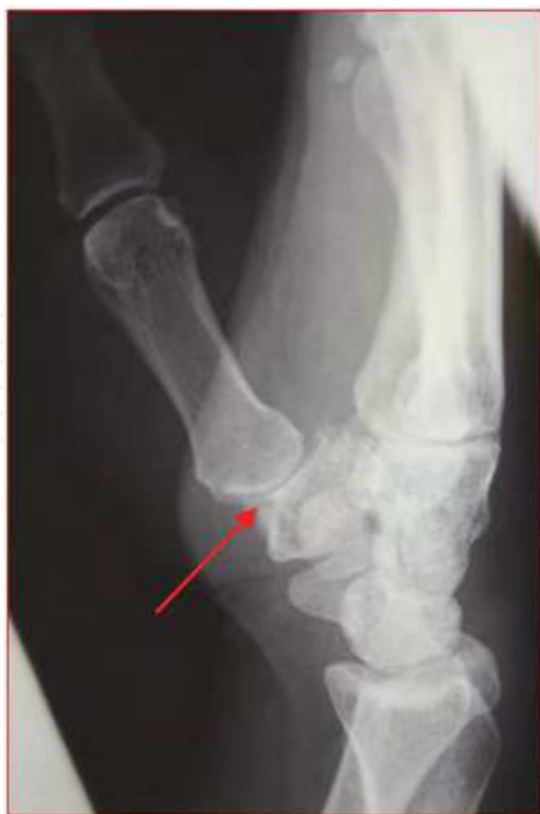
Fig. 7. Lateral Radiograph of Thumb CMC Arthritis

Surgical treatment should be considered when conservative measures have failed to relieve pain and improve day to day thumb function. Various options exist and it is therefore essential to engage the patient in an informed two-way discussion regarding the relative merits and drawbacks of each alternative. Patients with stage 1 or 2 disease have shown good outcomes with arthroscopy, metacarpal extension osteotomy, and volar ligament reconstruction. Arthroscopy is minimally invasive and allows for direct visualization of the articular surface and has been shown to be effective for the treatment of early osteoarthritis of the thumb CMC (Badia and Khanchandani 2007). Likewise, metacarpal extension osteotomy can correct the alignment of the thumb and transfer the load from the diseased palmar compartment to the normal dorsal compartment of the trapezium. (Pellegrini, Parentis et al. 1996) Eaton and Littler have well described a volar ligament reconstruction using part of the FCR tendon and have shown excellent results in 100% of patients with stage 1 and 82%-91% of patients with stage 2 disease. (Eaton, Lane et al. 1984; Freedman, Eaton et al. 2000).