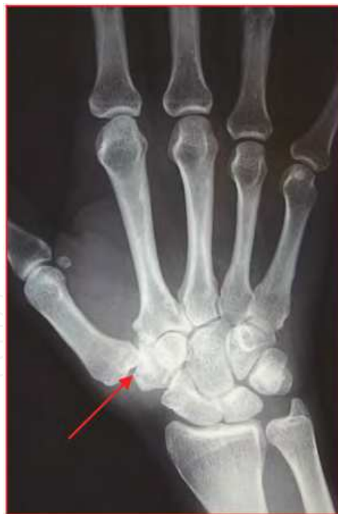
Fig. 6. PA Radiograph of Thumb CMC Arthritis

Initial treatment should focus on behavior modification, NSAIDS, and rest. Also, all patients should undergo a trial of conservative management including occupational therapy, splinting, and steroid injections. Occupational therapy should focus on strengthening the surrounding muscles to support the joint while stretching to maximize range of motion. Splinting can reduce the focal and load stress on the joint. The effectiveness of corticosteroid injections is widely debated with several studies demonstrating conflicting conclusions.(Day, Gelberman et al. 2004; Meenagh, Patton et al. 2004; Khan, Waseem et al. 2009; Swindells, Logan et al. 2010) A combination of these two treatments has shown to be effective in stage I and stage II disease.(Swigart, Eaton et al. 1999) As the disease progresses and the joint undergoes further degenerative changes the results of this treatment modality becomes less predictable. A recent study in 2009 also demonstrated hyalan injections as an alternative to corticosteroid with equal efficacy.(Heyworth, Lee et al. 2008)