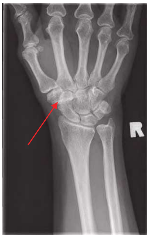
Fig. 8. PA Radiograph of STT Arthritis

As previously mentioned, the differential diagnosis must include thumb CMC arthritis. In a cadaveric study, 46 % of patients with STT arthritis had concomitant thumb CMC arthritis. (North and Rutledge 1983) Many hand surgeons term concomitant STT and thumb CMC arthritis as pantrapezial arthritis. As result of its shared prevalence and clinical presentation, it is important to combine clinical exam with radiographic findings for the definitive diagnosis. De Quervain tenosynovitis can present similarly, but the tenderness would be at the tip of the radial styloid and along the 1 st extensor compartment with a positive Finkelstein's test. Direct trauma to the STT joint as the primary pain generator should be investigated with a thorough and detailed history. Arthroscopy of the STT joint can be performed as a diagnostic procedure and palmar portal has been described as safe and efficacious. (Bare, Graham et al. 2003)