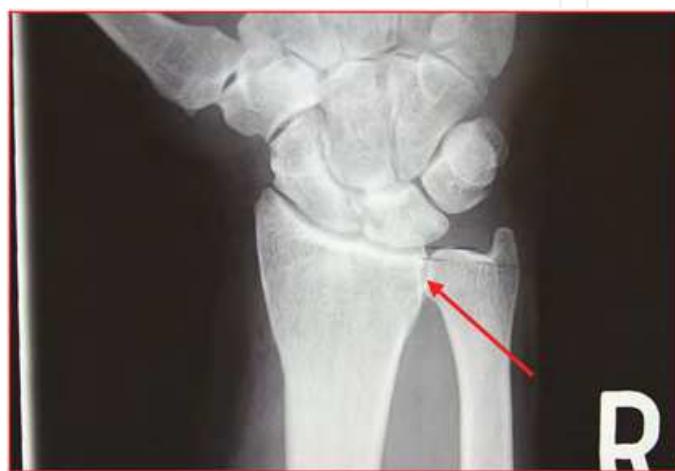
Fig. 5. PA Radiograph of Ulnar Impaction with an Ulnar -sided Lunate Cyst in Setting of DRUJ Arthritis

The differential diagnosis includes piso-triquetral and triquetro-hamate arthritis. The presence of a piano-key sign should be assessed in patients complaining of DRUJ pain (Scheker, 2009). The patient places their palms down on the examination table and pushes. The sign is present if the head of the ulna can be seen moving up and down. Such a finding is indicative of damage to the triangular fibrocartilage and is more common in rheumatoid arthritis as opposed to osteoarthritis. A second maneuver begins with the patient placing their elbows on the examination table with their forearms positioned perpendicular to the table's surface. Shear force is applied to the DRUJ. Any pain or displacement between the radius and ulna will indicate DRUJ instability. A third maneuver to be performed would be to apply shear force by pushing down on the patient's forearms while the patient pronates and supinates. Pain may be indicative of DRUJ incongruity and/or arthritis.