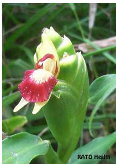
Fig. 5. Ginger flower

Ginger has specific features that relate to its selection in the therapeutic treatment of osteoarthritis. The ginger plant is robust, upright and balanced, with strong life giving forces of warmth and energy focused in the swollen stem base or rhizome. Ginger is a unique plant that stores all its reproductive, nourishing and medicinal forces in a rhizome, with the flowers and seeds being inconspicuous and often absent. Both Eastern and Western alternative medical approaches utilise the heat and vitality of the ginger rhizome in managing osteoarthritis symptoms.