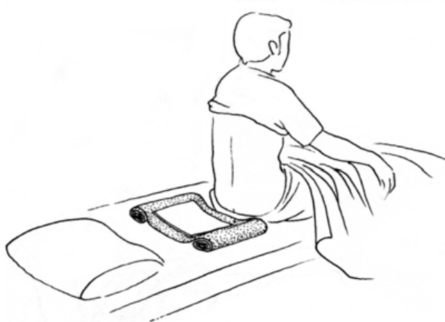
Fig. 6. Ginger kidney compress (Fingado, 2001)

European Anthroposophic hospitals report external ginger applications are effective for chest, metabolic, arthritic and psychiatric conditions, especially when applied to the kidney region (Schurholz, Vogele et al., 1992/2002). Ginger applications to the kidney region in the form of ginger compresses are found to warm and reactivate the metabolic forces of the body, which has a corresponding positive effect on the will to be active and mobile. The external application of ginger to the kidney region combines both heat and relaxation therapy and is found especially effective for people with osteoarthritis (Therkleson, 2010; 2004).