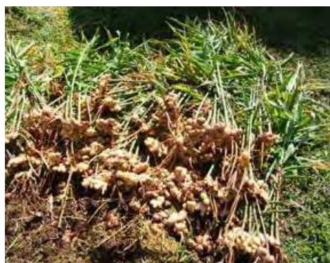
Fig. 2. Ginger harvest

The ginger rhizome has a pungent aroma, smelling fresh and sweet, and tastes hot, with a sharp and awakening effect. The rhizomes are harvested, when the leaves start to dry and contract in the winter period as shown in Fig 2. It is the rhizome that concentrates ginger's nourishing, healing and reproductive qualities. Ginger is propagated in spring from stored rhizome stock of the previous year.