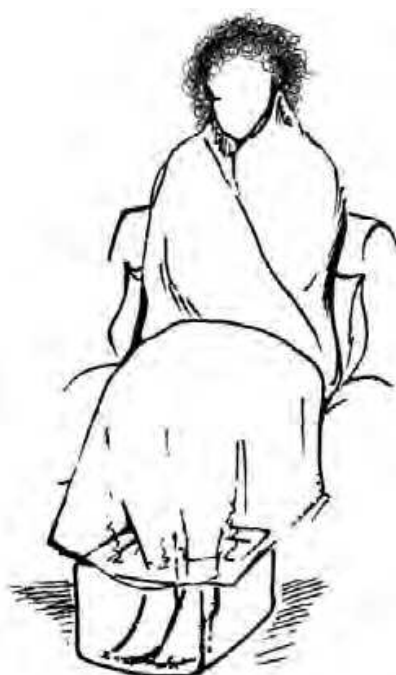
Fig. 7. Ginger footbath

The method involves filling a deep basin with warm water and adding 10g of ground dry ginger. The ginger is mixed into the water for about 30 seconds. The recipient sits in a relaxed position for the footbath, encompassed in a warm soft blanket/sheet that is large enough to wrap around the shoulders and reach to the floor. The feet are placed in the footbath 10 minutes, as long as the footbath is experienced as warm and comfortable then dried well and warm socks put on. The recipient can rest a further 15 minutes if required.