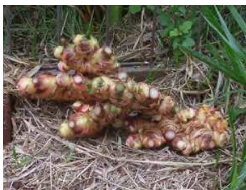
Fig. 1. Fresh rhizome

The ginger rhizome is a spreading bulbous, stem that develops horizontally close to the soil surface. It forms regularly spaced buds that grow to either shoots or new rhizomes. The rounded fresh buds are about the size of a knuckle, and coloured soft lemon-green, with a fleck of pink. A freshly prepared rhizome reflects these colours in Fig 1.