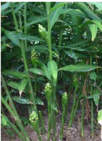
Fig. 4. Ginger flower cones

Ginger has specific features that relate to its selection in the therapeutic treatment of osteoarthritis. The ginger plant is robust, upright and balanced, with strong life giving forces of warmth and energy focused in the swollen stem base or rhizome. Ginger is a unique plant that stores all its reproductive, nourishing and medicinal forces in a rhizome, with the flowers and seeds being inconspicuous and often absent. Both Eastern and Western alternative medical approaches utilise the heat and vitality of the ginger rhizome in managing osteoarthritis symptoms.