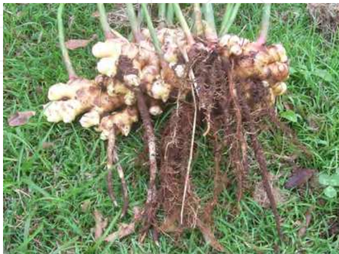
Fig. 3. Ginger roots

Long tap roots grow from the seams of the lower buds and anchor the plant deep in the earth. These tap roots reach to about 80cm and are milky-white, strong and juicy; tasting rather like ginger radishes. The tap roots have few hairs and no lateral shoots. Thin, short fibrous roots also grow from the seams of the fresh buds and these are coated in loose soil and minute micro-organisms.