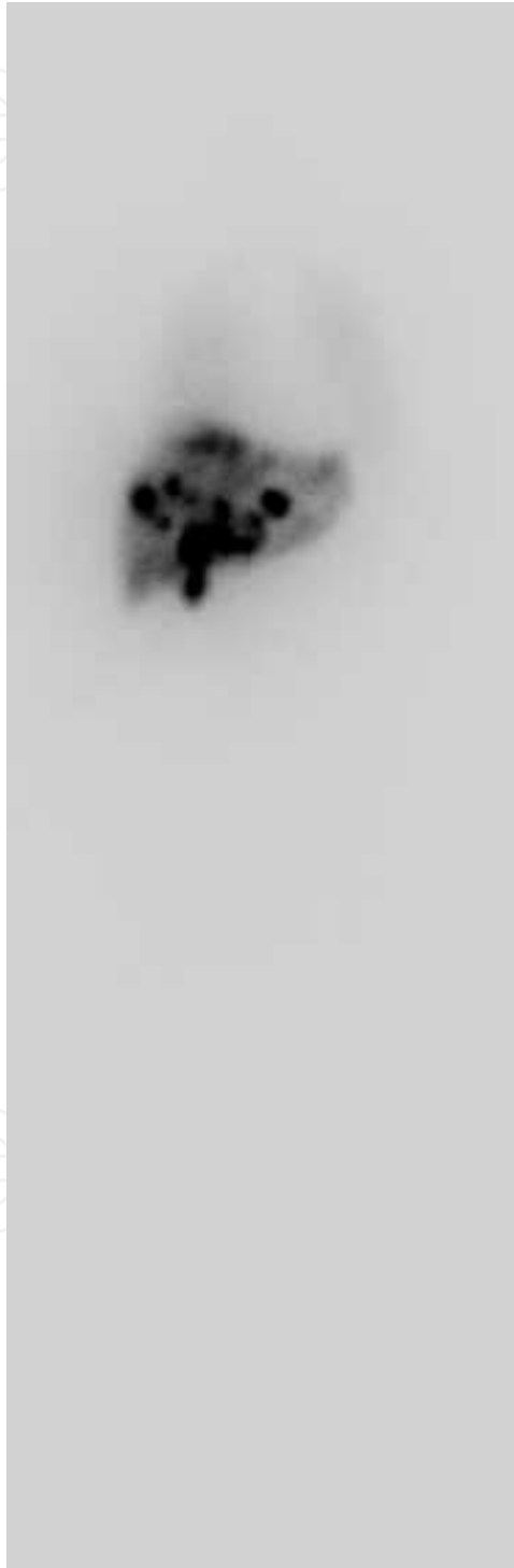
Fig. 1. Quantitative whole body scintigraphy obtained 7 days post therapeutic in a 52-year-old man showing significant activity in the HCCs and only a faint lung uptake.

small amounts of “cold” Lipiodol (Guerbet®). In patients with “normal” hepatic arterial anatomy the catheter can be positioned in the main hepatic artery for nonselective injection of ^{131}\text{I} -Lipiodol. In cases with multiple nodules or variable arterial blood supply, the liver lobe containing the largest tumour mass is treated in the first session and the remaining masses in the following ones.