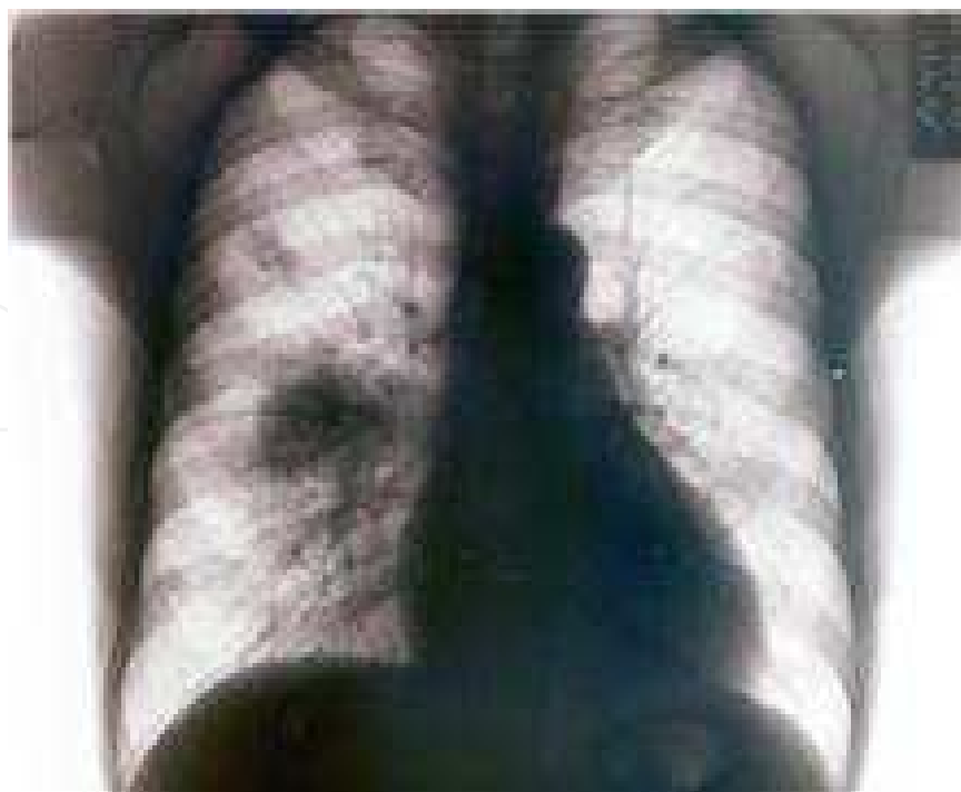
Fig. 1. Radiographic changes associated with Nocardia infection.

Time of onset of infection after transplantation is variable, but tends to be late. It rarely occurs in the first month and may range from 1 to 28 years (Santos et al., 2011). The greatest risk is within the first year (Peleg et al., 2007a, Clark, 2009), but later cases have also been described (Peraira et al., 2003, Oszoyoglu et al., 2007). Pulmonary presentation is the most common, with subacute and insidious pneumonia. Less frequent is the cutaneous form, following a minor injury or by direct inoculation (Ambrosioni et al., 2010). Symptoms are usually non-specific and include fever, fatigue, dyspnoea, cough and pleuritic pain (Patel & Payá, 1997; Minero et al., 2009). Common radiographic abnormalities include irregular nodular lesions which may cavitate, diffuse interstitial infiltrates and lung consolidation with parapneumonic pleural effusion (Balikian et al., 1978; Morales et al., 2011) (Figure 1). Both lungs are usually affected, without significant anatomical or zonal distribution (Oszoyoglu et al., 2007). In the case of single-lung transplantation, Nocardia can infect both the native and the transplanted organ (Husain et al., 2002).