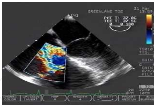
Fig. 1. Severe tricuspid regurgitation and enlargement of the right ventricle caused by severe pulmonary hypertension

pressure gradient across the valve and thereby an estimation of the pulmonary artery pressure.