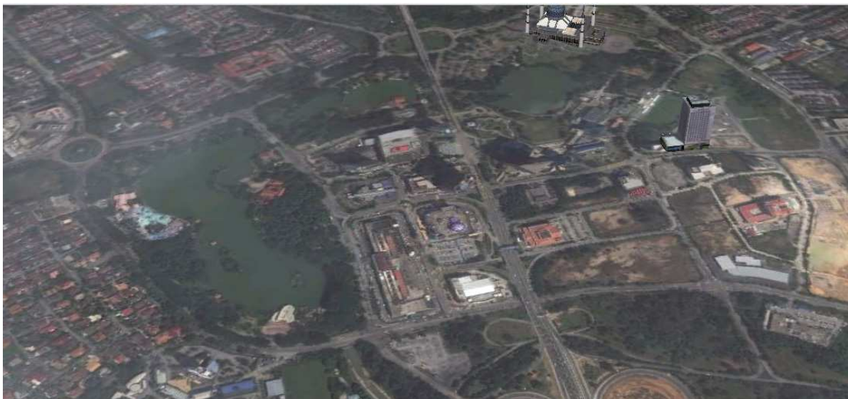
Fig. 1. The map of Shah Alam Lake Garden

The field survey was conducted on weekdays, weekend and public holidays. The respondents involved those who were present at the lakes at the time when questionnaires were given. Besides that, the respondent age of above 16 years old was also been point out in order to ensure that the respondents could give the grading to the aspects fairly. The questionnaires were designed based on the information obtain through discussions with experts. The questions provided in the questionnaires were straight forward and highly focusing on the aim that was to assess the respondent perception on the aesthetic level of the parks.