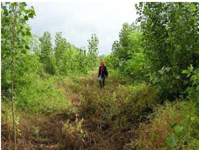
Photo 8. Inter-row application of herbicide glyphosate in the plantation

Glufosinate - ammonium – is used as non-selective, contact herbicide for control of weeds in forest plantations. It is applied in quantity of 4 -7,5 l/ha with water consumption of 400-600 l/ha.