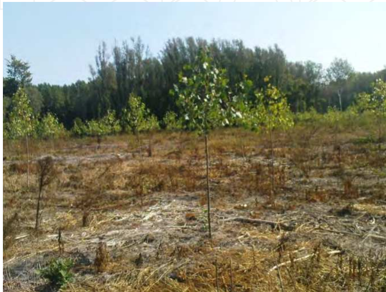
Photo 7. Efficiency of herbicide glyphosate in poplar plantation

Glyphosate – is used for complete weed control during the stage of intensive growth and concentration of 2-3%. Its efficacy on weeds is high due to good translocation into root and rhizomes. Side shoots, if present, should be removed prior to treatment with glyphosate because the preparations based on glyphosate should not reach the leaves of nursery plants (Photo 7 and 8). Glyphosate is used for treating stumps in order to prevent emergence of shoots from stumps. Concentration of 10-15% is applied immediately after cutting, but the treatment may be applied until shoots appear from May through October (Photo 9 and 10).