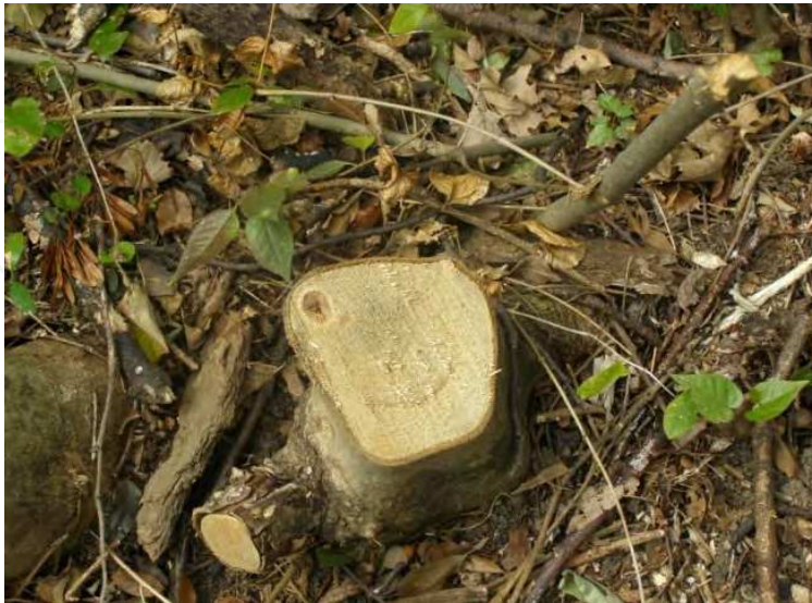
Photo 9. Treated stumps by glyphosate

Triclopyr – is used for oak stump shoots control in the ration of 1:5 or 1:10 for other broadleaved species. The best way is to treat stumps immediately after cutting, but it can be done until the shoots emerge. It can be performed during entire year, except during freezing.