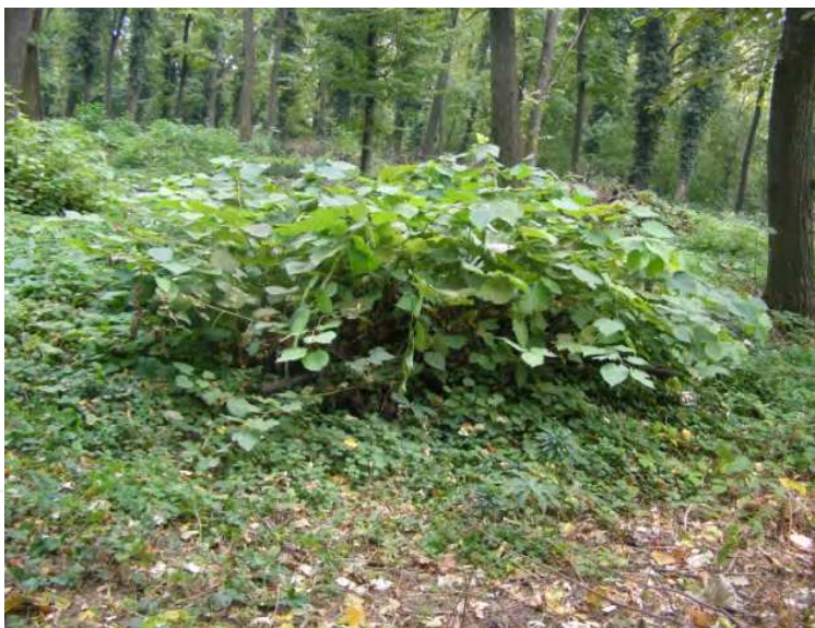
Photo 10. Non treated stumps