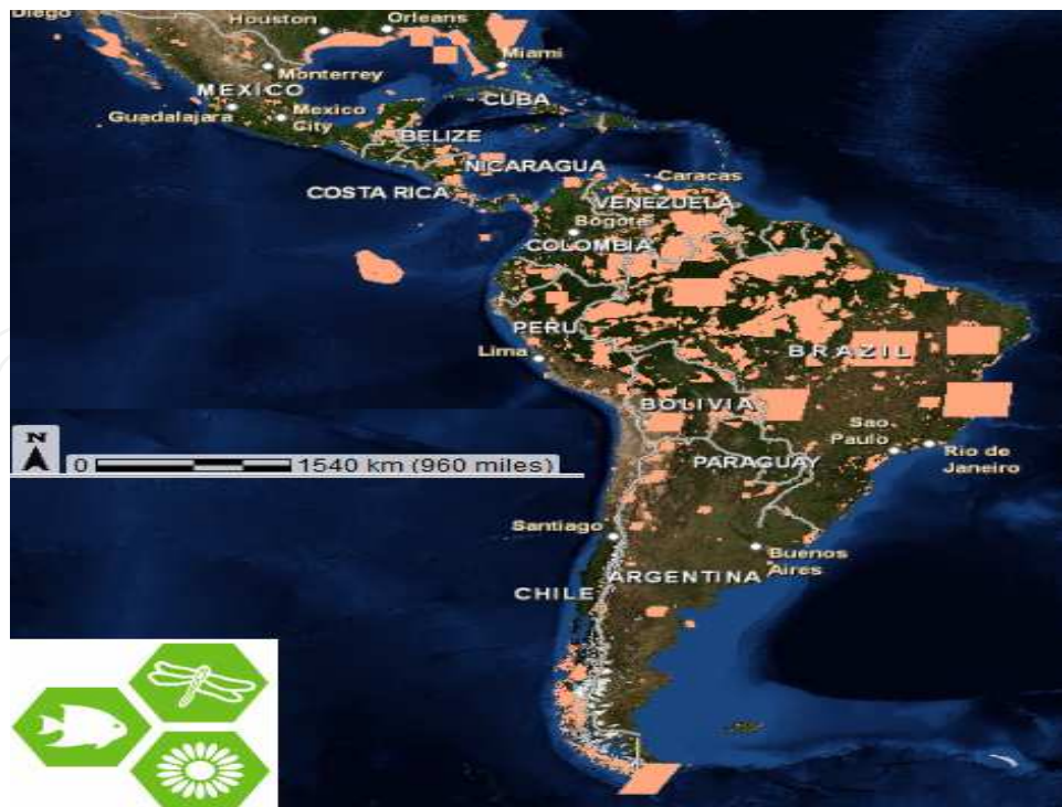
Fig. 2. Map of protected areas (pink) in the Neotropics.

Applications of landscape ecology are often assembled in spatial units and time series through overlapped tiles. This analytical approach lays out geology, topography, soil structure, biogeography, vegetation, carbon content, ecosystems, water balance, socioeconomic valuations, road networks, and demographics by using GIS technology. This approach represents a better fit for an applied socio-ecological structure and function, especially in a region characterized as mega-biodiverse, but at the same time socioeconomically mega-poor. This means that communities do not fully comprehend the resource potential around their locality.