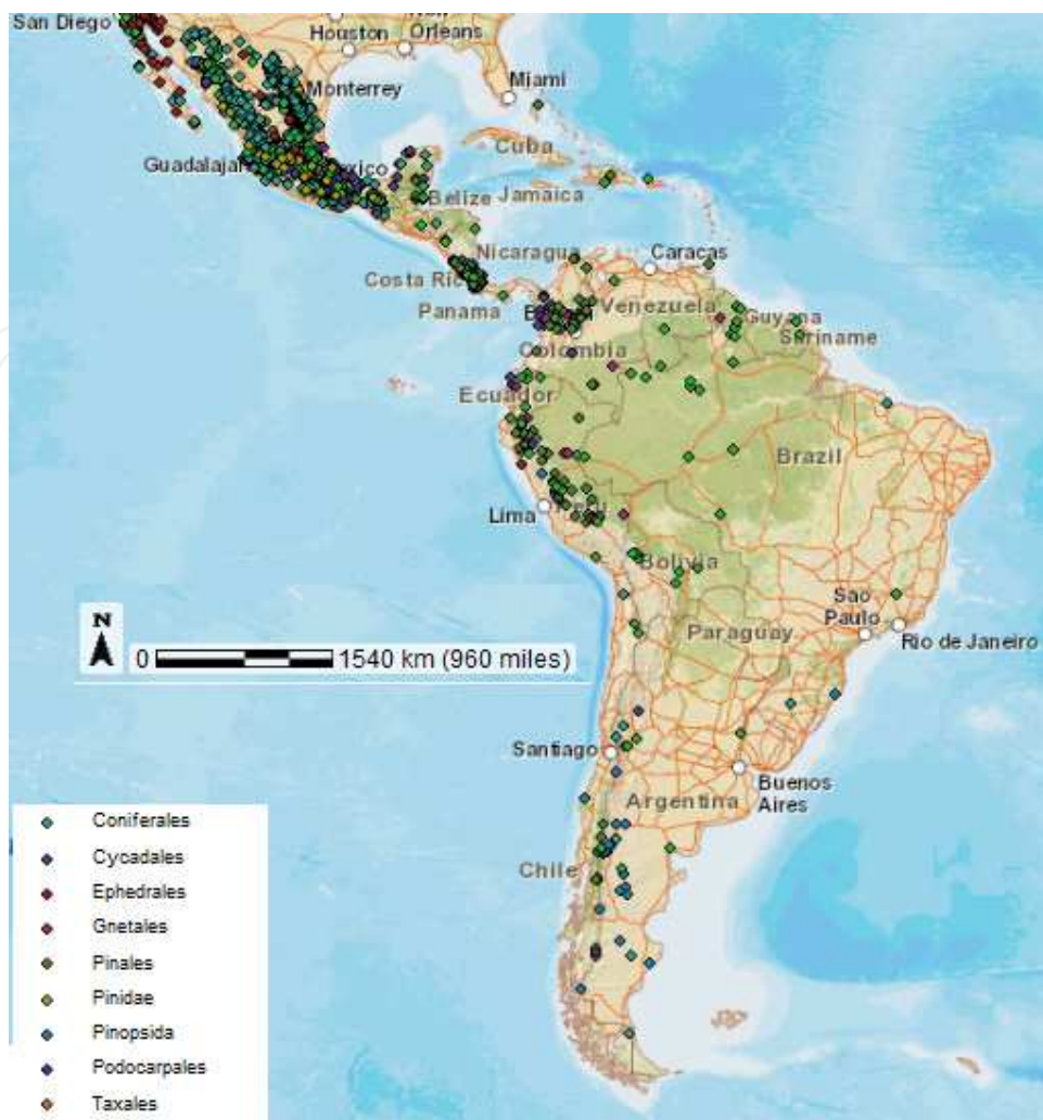
Fig. 1. Map distribution with some Neotropical plants at the level of order with keystone potentials for sequestering carbon. Source: Inter American Biodiversity Information Network (IABIN) http://www.iabin.net of Data Integration and Analysis Gateway (DIAG) , InBio Costa Rica, Global Biodiversity Information Facility (GBIF).

Landscape ecology in the Neotropics is better applied to biodiversity planning in order to categorize ecosystem services aimed at estimating both functional ecological aspects and effective demand for these services. Since nature conservation is not the exclusive domain of either human condition or the Neotropical societal mindset, biodiversity strategic action planning needs to be better understood philosophically. Instead, the wise use and management of biodiversity is widely assimilated in the Neotropics as nature “elongation” by referring to a co-evolutionary process to extend the breadth and length of wildlife species over interacting cultural landscapes. For example, in past years Nearctic guidelines of non-profit organizations and governments have been aimed at streaming revenue to buy land for protected areas in the Neotropics. They believe that the trespassing legal concept prevails in practice as it occurs over their lands. However, if impoverished communities around buffer areas need to secure their livelihoods, they will most likely use legally protected areas for survival in the Neotropics. All in all, the dominant matrix for a Neotropical landscape is transformed into agrofarming mosaics of socio-ecosystems and remnant patches of protected areas (Fig 2).