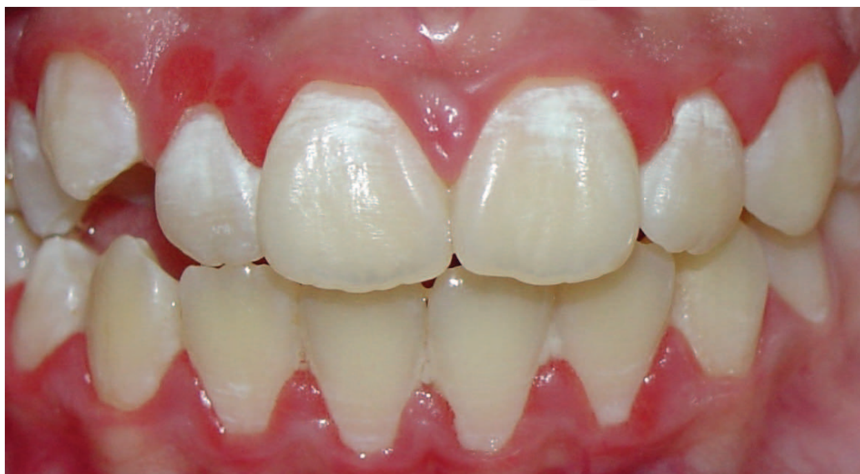
Fig. 4. The clinical appearance of carious lesions known as white spots. Note the opaque aspect of the lesions, the curved shapes close to the gingival margin. These are some of the points to consider that these white lesions are not related to dental fluorosis. In addition, the lesions are limited to gingival margin. The patient has also gingivitis in a clear indication that these are active carious lesions. The final diagnosis is confirmed by the fact that the patient did not live in areas with water fluoridation systems and avoided the use of fluoride toothpaste since childhood

During the examination for dental fluorosis, the enamel surface must be clean and dry. When the enamel surface is dried, the water in the enamel pores will be replaced by air. Hence, even slight enamel opacities can be observed. This procedure, which is used for scoring fluorosis with a fluorosis index (Dean index or Thylstrup and Fejerskov index), can classify dental fluorosis on different degrees, and differentiate fluorosis from other enamel opacities (Murray et al., 1991).