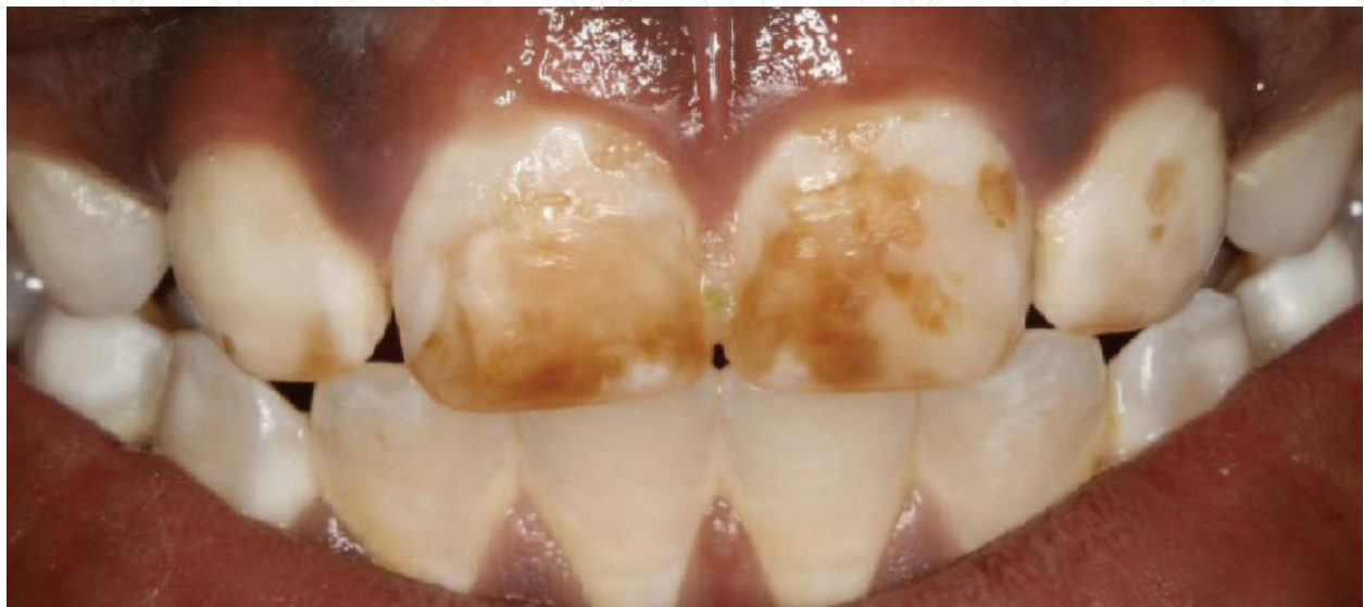
Fig. 2. This is a case of severe dental fluorosis in a 13-year-old child who consumed naturally water fluoride with 4.8 ppm. Note that the dark brown stains are limited to upper incisors. The lower incisors were the less affected teeth

Dental fluorosis is an enamel opacity due to a long-term ingestion of fluoride during tooth formation period. The tooth appearance can vary from narrow white lines to “cloudy” white spots or brown areas with pits. Loss of enamel is also frequent in more severe cases (Figure 2).