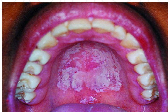
Fig. 1. Pseudomembranous candidiasis on the palate

Pseudomembranous candidiasis is by far the most common form of oral candidiasis. Pseudomembranous candidiasis appears as a white "curd-like" material (Fig. 1) that when wiped off reveals an underlying erythematous mucosa (Shiboski et al., 2009). Removable plaques on the oral mucosa are caused by overgrowth of fungal hyphae mixed with desquamated epithelium and inflammatory cells. This type of candidiasis may involve any part of the mouth or pharynx. Generally, the clinical diagnosis is made on the basis of appearance.