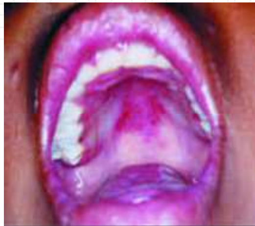
Fig. 2. Erythematous candidiasis on the palate

Erythematous candidiasis appears as flat, red patches of varying size (Fig. 2). It commonly occurs on the palate and the dorsal surface of the tongue (Shiboski et al., 2009). Erythematous candidiasis is frequently subtle in appearance and clinicians may easily overlook the lesions, which may persist for several weeks if untreated. Identification of fungal hyphae in the lesion is necessary to make a definitive diagnosis. Both Erythematous candidiasis and Pseudomembranous candidiasis can cause changes in taste perception and/or pain and a burning sensation.