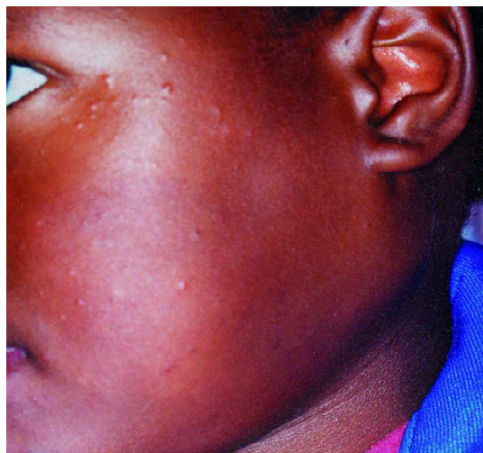
Fig. 4. Unilateral Parotid gland enlargement

Bilateral parotid gland enlargement occurs in HIV infected individuals. Salivary gland disease associated with HIV infection (HIV-SGD) can present as xerostomia with or without salivary gland enlargement. Salivary gland enlargement in children and adults with HIV infection usually involves the parotid gland (Fig 4). The enlarged salivary glands are soft but not fluctuant. The enlarged parotid glands can be a source of annoyance and discomfort. HIV-infected patients may also experience dry mouth in association with taking certain medications (such as ddI, antidepressants, antihistamines, and antianxiety drugs) that can hinder salivary secretion.