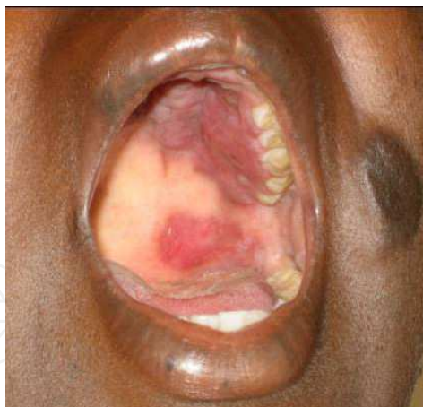
Fig. 3. Kaposi's sarcoma on the palate and skin