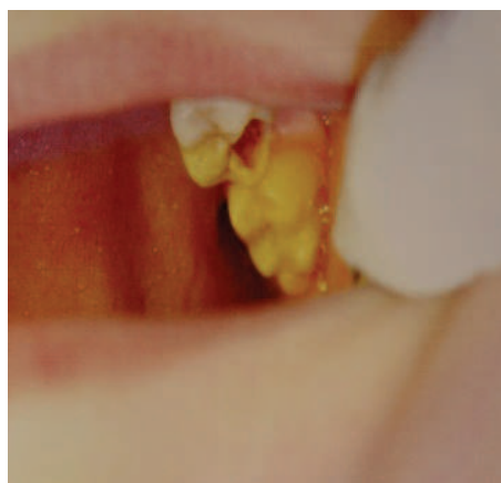
Fig. 5. Gross caries with collapse of overlying tooth cusp