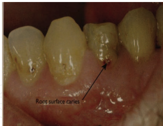
Fig. 4. Root Caries