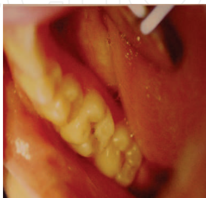
Fig. 3. Pit and fissure caries in lower molar