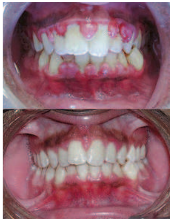
Fig. 6. Severe gingivitis before ( top ) and after ( bottom ) a thorough mechanical debridement of the teeth and adjacent gum tissues.

Orthodontic appliances may be advised for the treatment of malpositioned teeth or replacement of dental and other related illnesses.