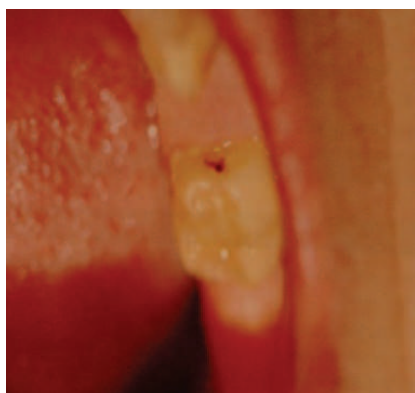
Fig. 2. Smooth surface caries on lower molar