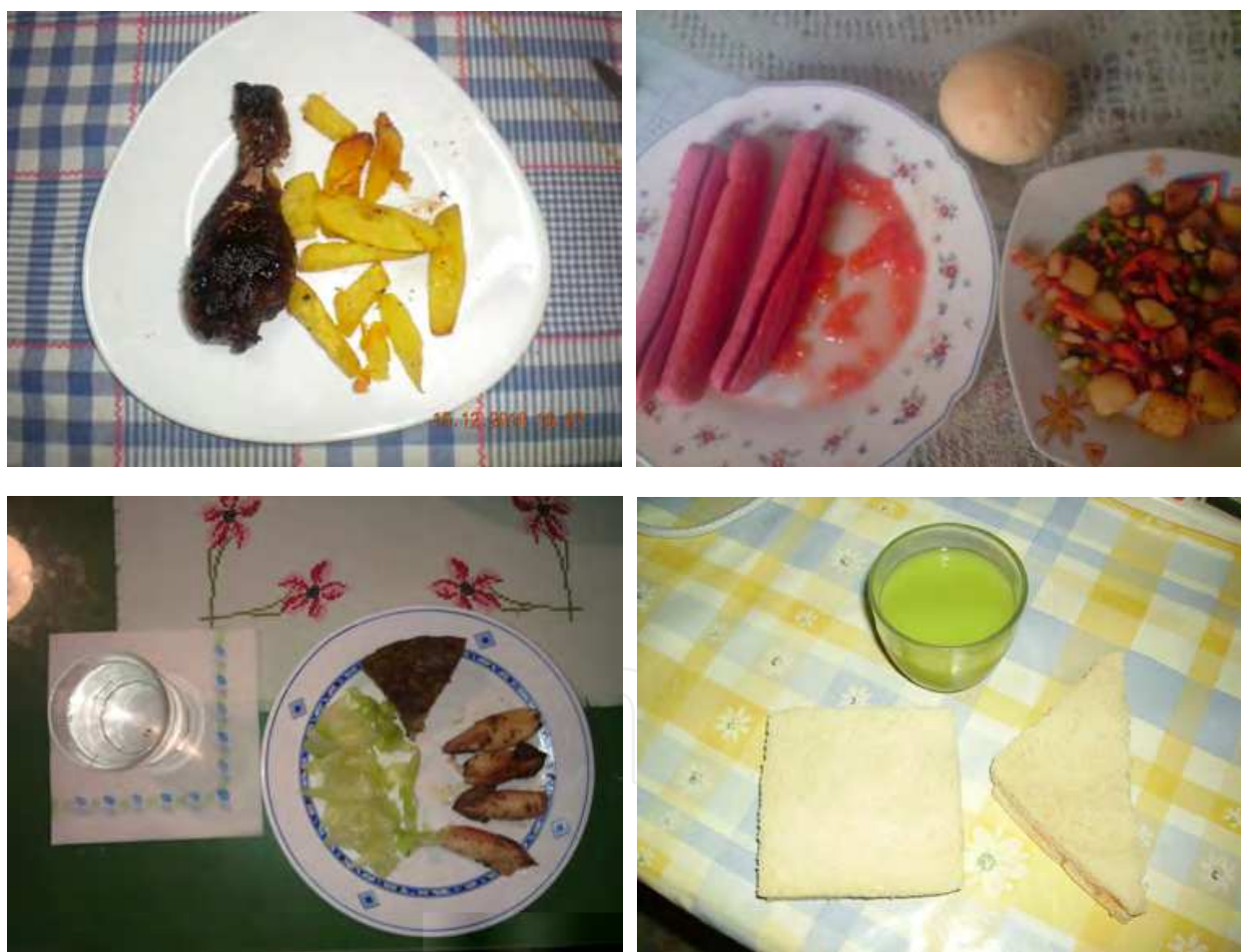
Fig. 3. These photos show that meals' presentation must be included in the nutritional education.

In addition to the demonstrated usefulness to show the real amount of food, the nutritionist can make use of photos to observe the meals' presentation and improve it, if necessary. Eating is an easier task for patients with an appropriate meals' presentation. Taking a meal's photo improves the presentation right from the start because the responsible persons show a great interest in the meals' appearance, given that this photo will be seen by a person beyond the family. This is one of the consequences of the lack of importance that nutrition has at present. Generally, people do not pay attention to the meal presentation but this issue has a great influence on the nutritional evolution of patients. Usually, responsible persons for the meal presentation do not take any pains to satisfy the eyesight, which is particularly important for the nutrition of children, the elderly and eating disorders patients. Sometimes, eating disorder patients, as well as a normal person would make, express great efforts to eat given the lack of interest showed by family member responsible for cooking, for example: a meat croquette whose size was equivalent to five normal croquettes since the mother did not like cooking, a burnt omelet or a fried fillet without any previous preparation with eggs, flour or breadcrumbs, that is to say, from the butcher's shop to the deep fryer directly.