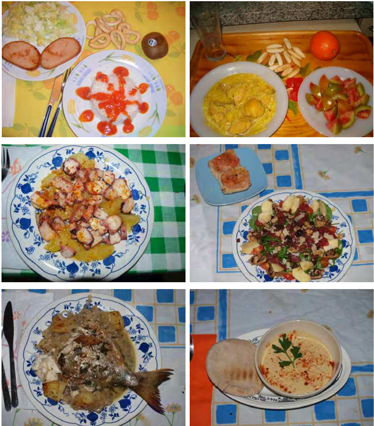
Fig. 4. These photos are the result of the nutritional education. A good presentation eases the nutritional treatment.

Likewise, patients' families forget to mention anomalous eating attitudes of patients which the nutritionist observes in digital photos like crumbling foods, leaving always leftovers, peeling fruits in a particular way, mixing foods (for example the salad with lentils), using out of the ordinary plates and cutlery (anorexia nervosa patients who use small plates and cutlery, for example), among others. Finally, when out-home meals are allowed taking into account the patients' evolution, photos are again recommended to show them. Patients are