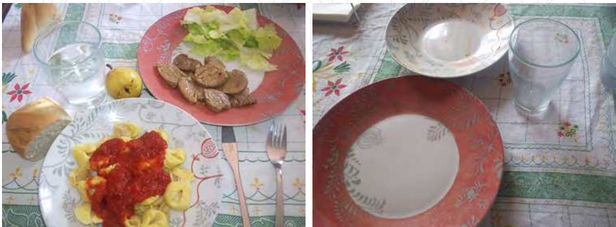
Fig. 2. Patient with anorexia nervosa after six months of treatment.