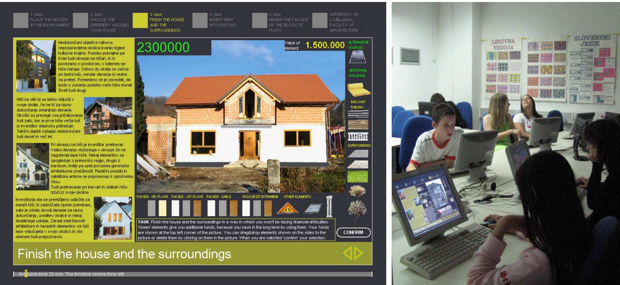
Fig. 2. Eco-spatial Education Interface (task#3 and the classroom setting).

interactivity of tasks (visual feedback, reversibility of actions, experimenting). Conditions ranged from maximum to minimum interactivity, from traditional face to face (f2f) education method to the test group (which did not receive any information and educational contents, just the task and basic instructions). Several parameters were automatically recorded (i.e. time, user choices, etc) and results of each task graded. The technical requirements for running the application and its IT scope were intentionally scaled down to match the IT equipment in schools (no installation required, application runs even on slow computers).