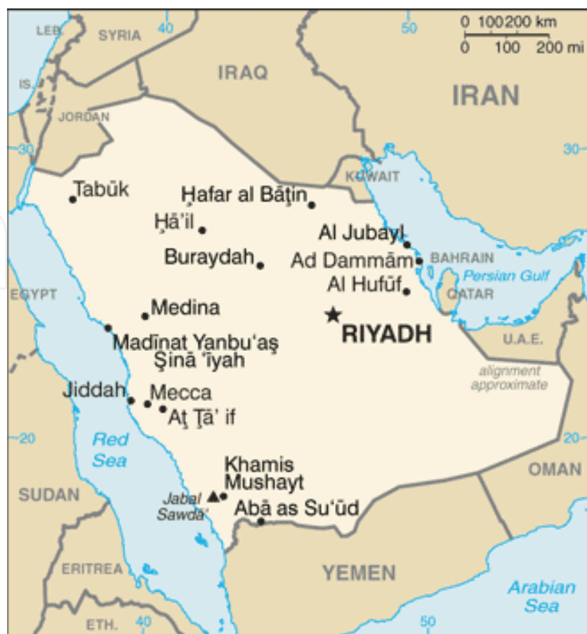
Fig. 1. Map of Saudi Arabia showing the total area, major cities and the borders with other countries.