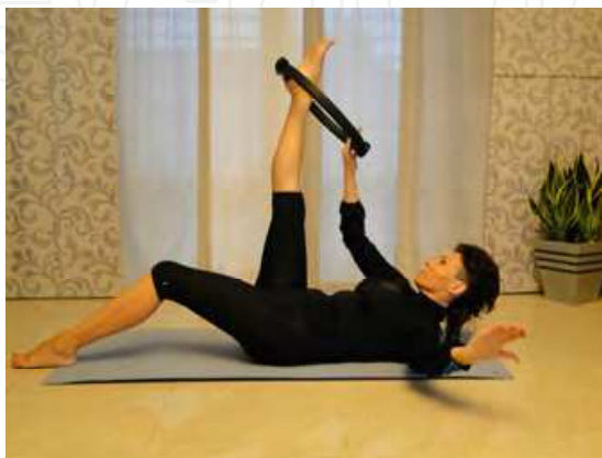
Fig. 1. Multidimensional exercise with Pilates circle

Exercises on professional Pilates' devices are mainly resistance exercise performed with the aid of springs and pulleys, but also stress relief of certain parts of the body can be achieved. The machines can be customized to the needs of the practitioner. The resistance during the exercise allows movement to be isolated and performed in the proper plane. Additional resistance prevents automatic movements being responsible for injuries. The exercises using professional Pilates' devices can be performed in post-acute state of sports injuries.