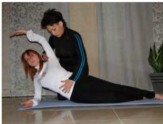
Fig. 5. "Hands on" for body alignment execution

Focusing on the therapeutic movement, particularly in the case of sport injuries helps to avoid errors in repeating the exercises without therapeutic supervision. Proper learning of movement can be also achieved with the help of hands-on guiding, assisting correct movement (touch can improve muscle engagement and relaxation). Verbal cues also play a very important role in increasing awareness of the therapeutic movement being performed and learnt. This applies particularly in the case of a limited amount of information such as typically used with elderly or stroke patients (Lange et al., 2000; Latey, 2000). Verbal cues of the Pilates based exercise instructor as well as his tactile stimulation (hands-on) aim to motivate the exercisers to increase the focus on how to perform movement and maintain the desired body position, so that sensorimotor integration is stimulated. Moreover, connecting the mind and body requires the exercising person to tune into their bodily sensory systems.