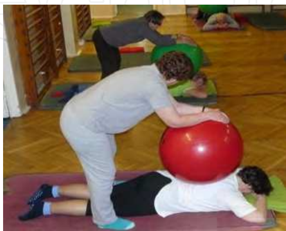
Fig. 2. Sensoric massage with Swiss ball

In physiotherapy praxis Pilates based exercises are also performed with a gymnastic stick, a gym ladder and a stool. Pilates based exercises using a Swiss ball are also very popular, as is sensoric massage with this tool.