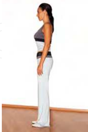
Fig. 3. Postural alignment in standing

in modern Pilates based exercise it is not recommended to start each session with an exercise called "The Hundred", as it used to be in traditional Pilates method. According to Lately (Lateley, 2002) this exercise is particularly arduous as an initial exercise, might be extremely dangerous for someone new to the method, and even under supervision can result in severe injury. The authors concur with Lately on this issue.