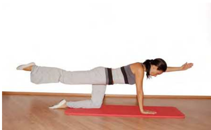
Fig. 4. Stability and endurance training: core muscle activation with limbs exercises