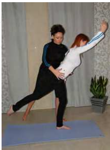
Fig. 6. Manual stimulus for increasing body awareness and desired muscle recruitment

helps to focus concentration. Awareness of the body also assists in reducing overwork, strain and tension. Sportsmen particularly need awareness of their body, particularly the muscular sensations, so as to direct mental and physical efforts efficiently. Attending to the feedback from the proprioceptor system makes the individual aware of what is being done. Precision assists coordination; this is the practical application of focused awareness.