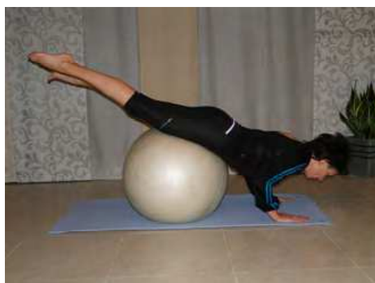
Fig. 10. Push-up exercise on Swiss ball , movement with activation of strong core

It was found that the upper trapezius and serratus anterior are under differing cortical control mechanisms, with trapezius but not serratus demonstrating both contralateral and ipsilateral responses to cortical magnetic stimulation. Increased upper trapezius tone and constant readiness to activate disturbs the humero-scapular rhythm and is also an indication of fatigue or compensation of serratus anterior. As muscle fatigue can be a central phenomenon as well as a peripheral phenomenon, the upper trapezius may have been recruited differently during or after the task. (Alexander et al., 2007, Hunter et al., 2006 as cited in Szucs et al., 2009) It is ball, important that performing Pilates Push-up, which is an exercise in close kinematic chain, serratus anterior muscle should be activated rather than a dominant role of upper trapezius muscle which can be achieved by the alignment of spine, unlocked elbow joints, lower – costal breathing and touching stimulus of an instructor during execution of an exercise.