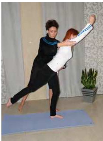
Fig. 7. Execution of strong core with body alignment before and during movement

One of the major emphases of Pilates is to address the posture of the pelvis by addressing the musculature of the pelvis. Pilates further corrects this imbalance by placing a strong emphasis on stretching the low back musculature. In this manner, Pilates aims to create a neutral pelvis, and thereby create a healthy lumbar lordosis. (Muscolino & Cipriani, 2004 as cited in Selby, 2002; Siler, 2000; Winsor, 1999).