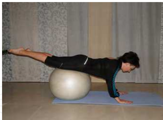
Fig. 9. Push-up exercise on Swiss ball, starting position without “locked elbows”