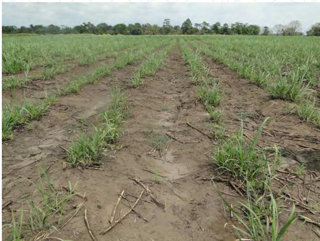
Fig. 6. Detrimental effect on sprouting ratoons after harvest from glyphosate treated areas.

harvest from treated areas, with a reduction of tillers per meter (Fig. 6), which would lead to lower productivity in the next harvest (Leite & Crusciol, 2008). For this reason, glyphosate has been widely used in areas that will be used for the implementation of a new cane field. However, there are also reports that glyphosate did not cause any detrimental effects on sugarcane quality and productivity (Viana et al., 2008). Due to the strong influences that factors such as dose, variety and climatic conditions have on the effectiveness of the product, this issue merits further study.