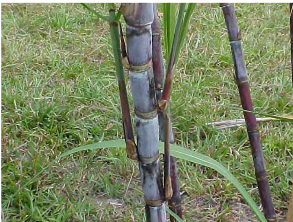
Fig. 5. Sugarcane stem with side shoots after application of glyphosate.

There are minor differences between the different formulations of glyphosate applied to sugarcane cultures; however, all formulations promoted increases in sucrose content and sugar production compared to controls (Villegas et al., 1993; Bennett & Montes, 2003; Viator et al., 2003).