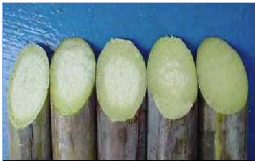
Fig. 2. Different grades of pith process in sugarcane. From the left to the right, intense pith to no pith.

Quantification of the degree of the pith process and the possible changes in the quality of the raw material may provide critical data to the design of the area to be planted for each variety and the best time periods for industrial use. The intensity of the flowering process and its consequences for the quality of raw materials vary with the variety and climate. Therefore, reducing the amount of juice is the main factor that is affected by flowering.