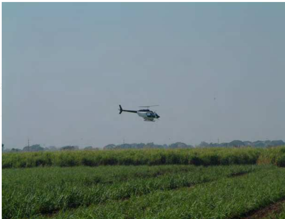
Fig. 4. Aerial application of ripener using a helicopter.