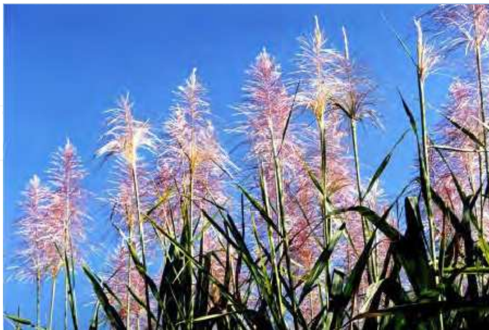
Fig. 1. Flowering of sugarcane.

Another aspect refers to the phenomenon of the pith process (Fig. 2) related to the flowering and ripening of sugarcane, which occurs in some varieties and is characterized by the drying of the interior of the stalk from the top. The pith process leads to a loss of moisture in the tissue, with a consequent reduction of the juice stock and an increase in the fiber content of the stalk. Thus, although the concentration of sucrose in the stalk is increased, it is difficult to extract and involves the loss of stalk weight and, consequently, a reduction in the final yield.