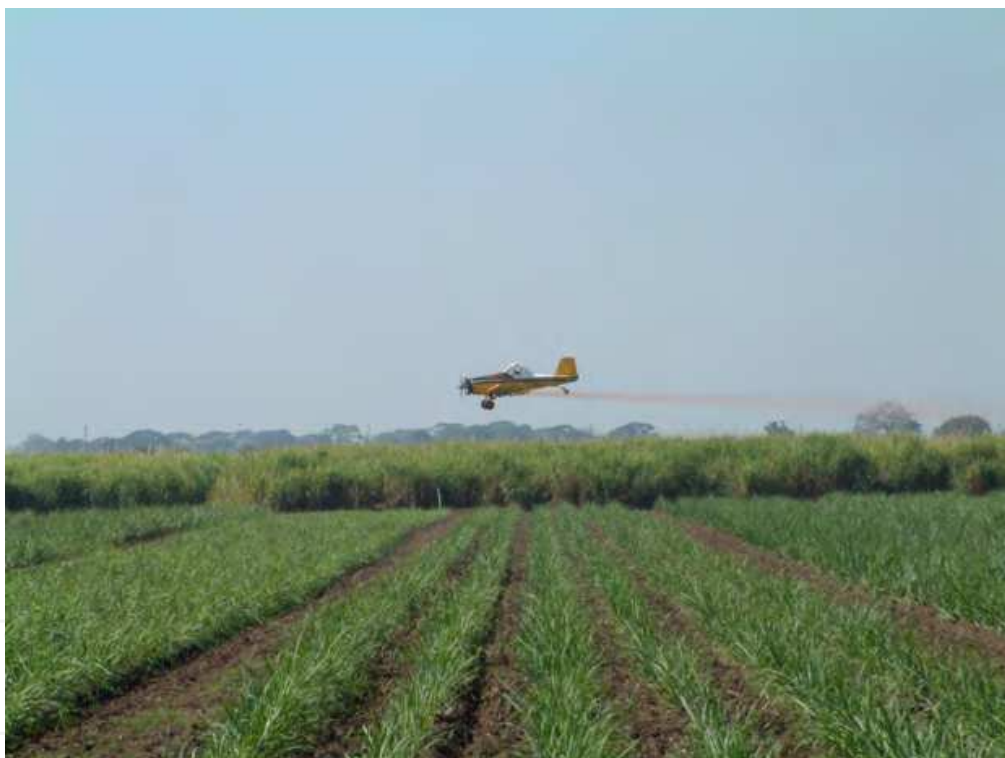
Fig. 3. Aerial application of ripener using an agricultural aircraft.

The physiology of sugarcane ripening has been studied for more than 30 years. Natural ripening in early harvest may be poor, even in early varieties. In this context, the use of chemical ripeners stands out as an important tool (Dalley & Richard Junior, 2010). Due to the areas cultivated with sugar cane are extensive, the application of these products is normally done with agricultural aircraft (Fig. 3), but helicopters can also be used for this purpose (Fig. 4).