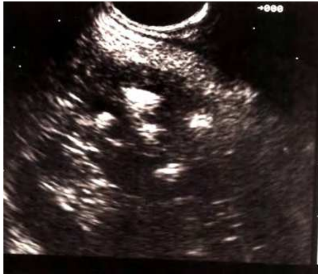
Fig. 2. Echoendoscopic image showing multiple hyperechoic areas with posterior acoustic shadow in a patient with calcifying CP.

calcifications (Figure 2) (2,9-11). Intravenous injection of secretin may be useful in early forms of CP, enhancing discrete changes in MPD caliber (12). Sensitivity and specificity of ultrasound to diagnose CP ranges from 50 to 70% and 80 to 90%, respectively (6, 10, 13).