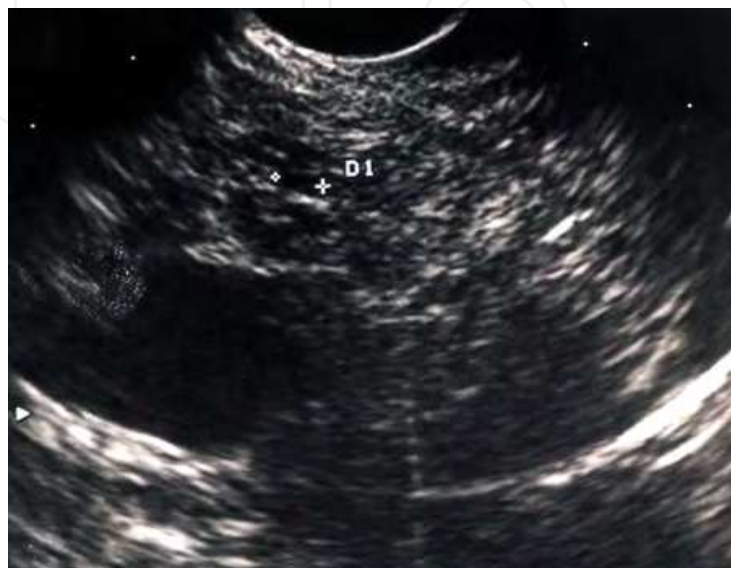
Fig. 7. Echoendoscopic image of pancreas showing parenchymal changes such as: longitudinal hyperechoic streaks, hypoechoic areas, secondary duct dilation and hypoechogenicity of the entire gland.

Diagnosis of early stage is a huge challenge. The inability to obtain biopsies makes this presumptive diagnosis difficult. The available diagnostic imaging methods do not offer greater benefits. EE is a promising diagnostic modality and unlike ERCP does not have the same complication rate. Minimal changes in echotexture are difficult to interpret because there is no gold standard (Figure 7).