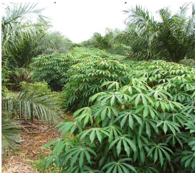
Fig. 3. Cassava intercrop with oil palm (Ismail et al., 2009)