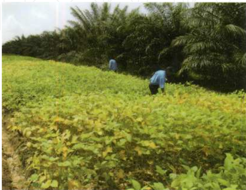
Fig. 2. Soyabean in four-year-old oil palm (Ismail et al., 2009)

species in a well-defined row arrangement in an irregular arrangement; iii) strip inter-cropping, simultaneous growing of two or more crop species in strips wide enough to allow independent cultivation but, at the same time, sufficiently narrow to induce crop interactions and iv) Relay inter-cropping, planting one or more crops within an established crop in a way that the final stage of the first crop coincides with the initial development of the other crops. This will improve the land productivity and better land usage without the need to explore new land which might lead to deforestation. Figures 2 and 3 show the row-