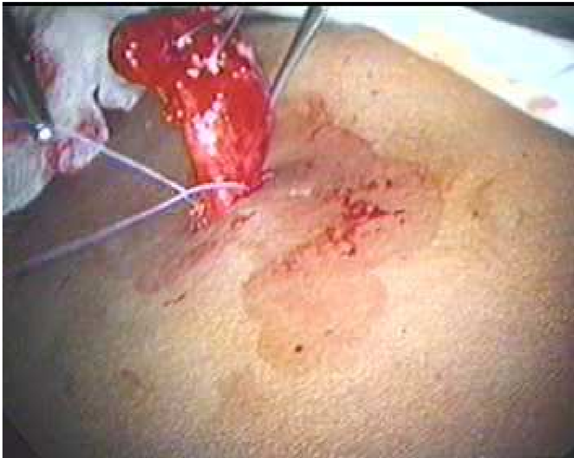
Fig. 2. Appendix drawn out on surface and meson-appendix legated.