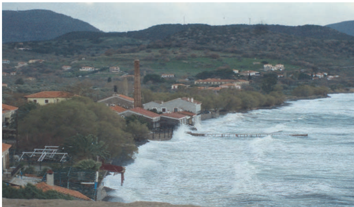
Fig. 1. Storm surge in Molyvos coast, Lesvos island, Greece, December 2009.

Greece, construction of summer residence occurs too close to the coast (Figure 1), increasing social vulnerability in the case of SLR. Construction near the coast happens due to the fact that tides in the Mediterranean do not exceed 40 cm. So, vulnerability rises due to the increased exposure of coastal constructions and the growing number of people colonizing the Mediterranean coasts.