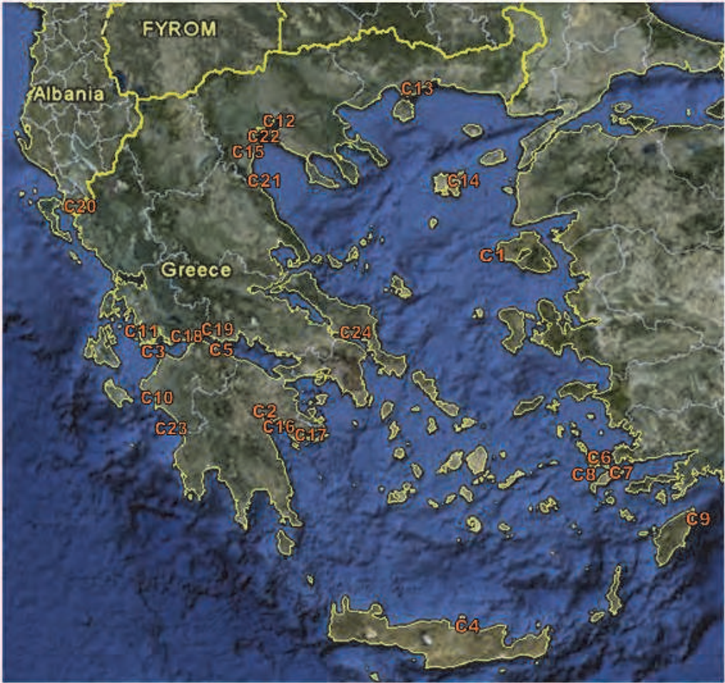
Fig. 3. Map of Greece displaying the 27 case studies.

In the present paper, we approach the assessment of economic impacts of SLR with respect to two different aspects: long-term (2100) and short-term (annual) damages. The long-term losses follow the gradual SLR as specified by the IPCC scenarios for 0.5-m and 1-m elevation. The short-term financial appraisal of losses is based on the increased frequency and intensity of storm surges, a consequence of climate change taking place in parallel to long-term SLR. The inclusion of such short-term losses in the estimation of SLR impacts follows IPCC and other experts' opinion (IIPCC CZMS, 1992; Hoozemans et al., 1993; McInnes et al., 2000; Emanuel, 2005; Velegrakis, 2010).