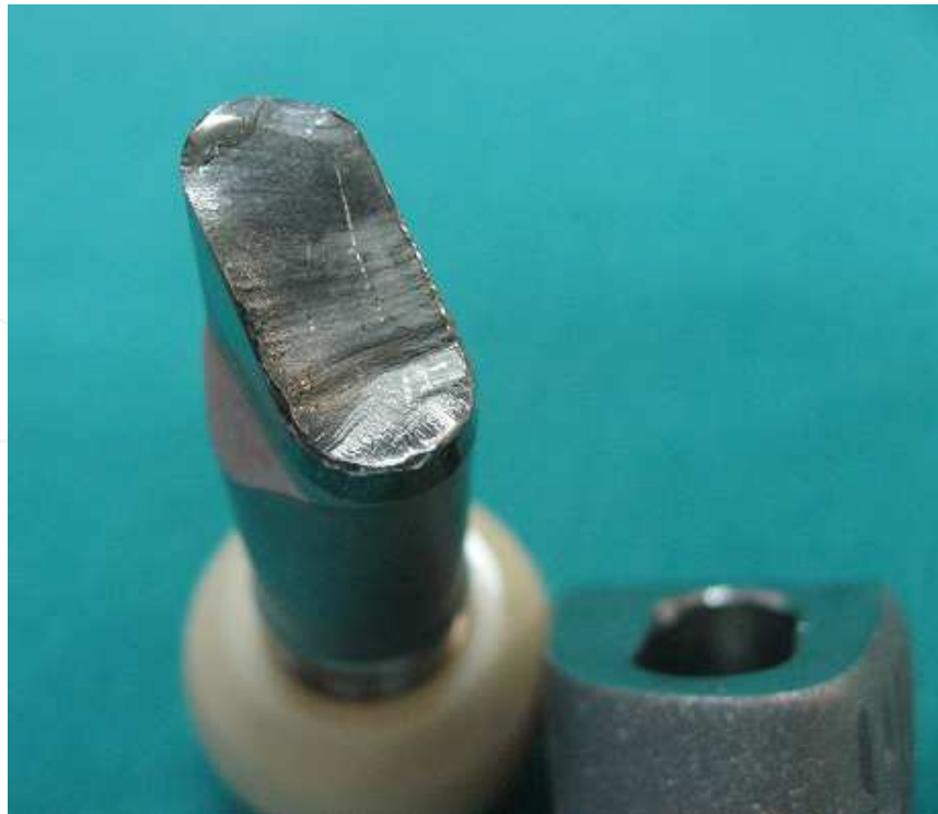
Fig. 3. A close-up photograph showing the fractured modular femoral neck.