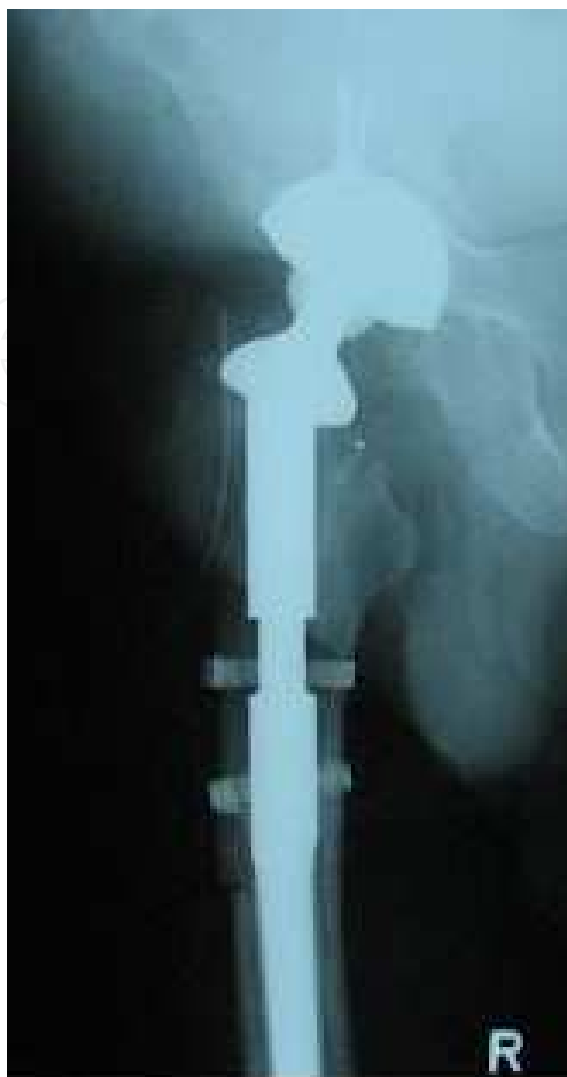
Fig. 5. Radiograph of the revised right hip with the cementless revision modular prosthesis in place.