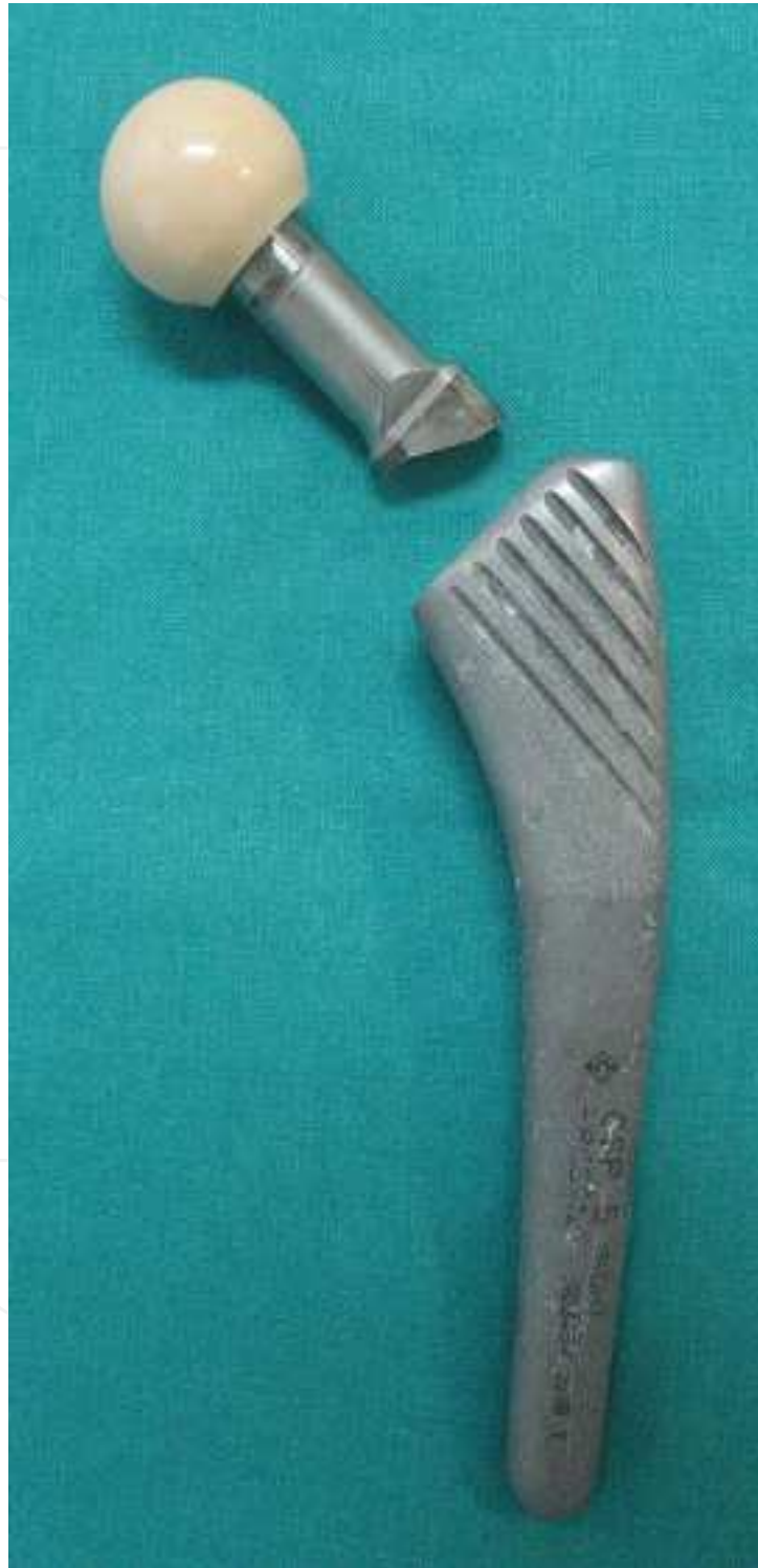
Fig. 2. Photograph of the retrieved fully-modular prosthesis showing the modular neck fracture.