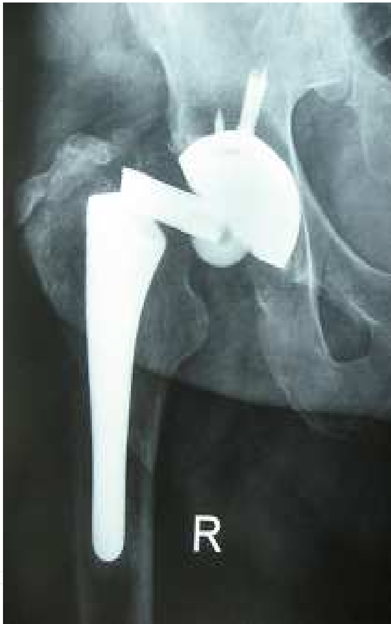
Fig. 1. Standard antero-posterior radiograph of the patient's right hip at admission.

In order to properly reconstruct the biomechanics of the hip, cementless revision modular stem with ceramic head (Waldemar Link GmbH & Co, Hamburg, Germany) was used. The acetabular lining was exchanged as well and a custom made ANCA-Fit (Wright Medical Technology, Inc., Arlington, TN, USA) component implanted (Fig. 5). Standard tissue specimens were collected during the revision procedure for microbiologic cultures which showed no bacterial growth.