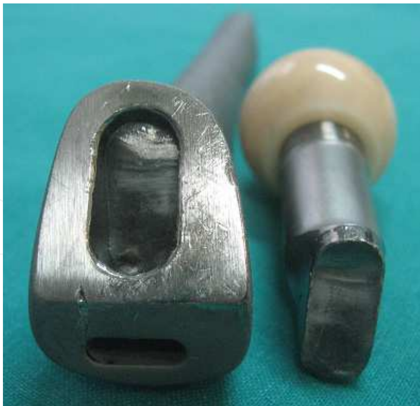
Fig. 4. Photograph showing the removed prosthesis with fractured neck and the remaining of the modular neck in the femoral stem taper.