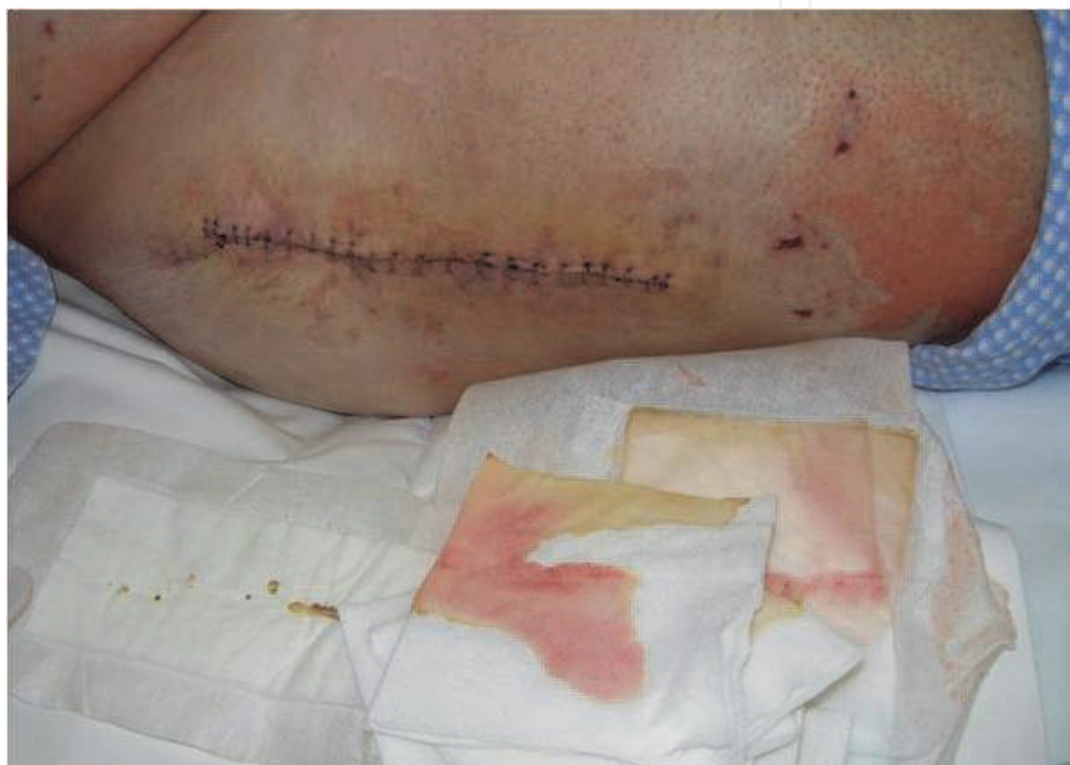
Fig. 2. Wound with prolonged serous secretion through an un-healed drain canal.

Division of prolonged drainage on the drainage from the wound site and the drainage from the drain site is arbitrary. The cause of drainage is the same regardless on the location. The drainage is linked to a hematoma that develops around the prosthesis. At first, the drainage is bloody, but later turns to serous fluid as the red cells in hematoma sediment. Since the hematoma in the wound is always present whether the drain is present or not, prolonged drainage is always possible. In the un-drained wounds, the drainage can occur through the incision plane, especially if the fascia was not meticulously sutured. In case of a drained wound, the hematoma drains through the drain tube. After the drains are removed, the hematoma may drain through the un-healed drain canal (Figure 2). The drainage stops with the healing of the canal.