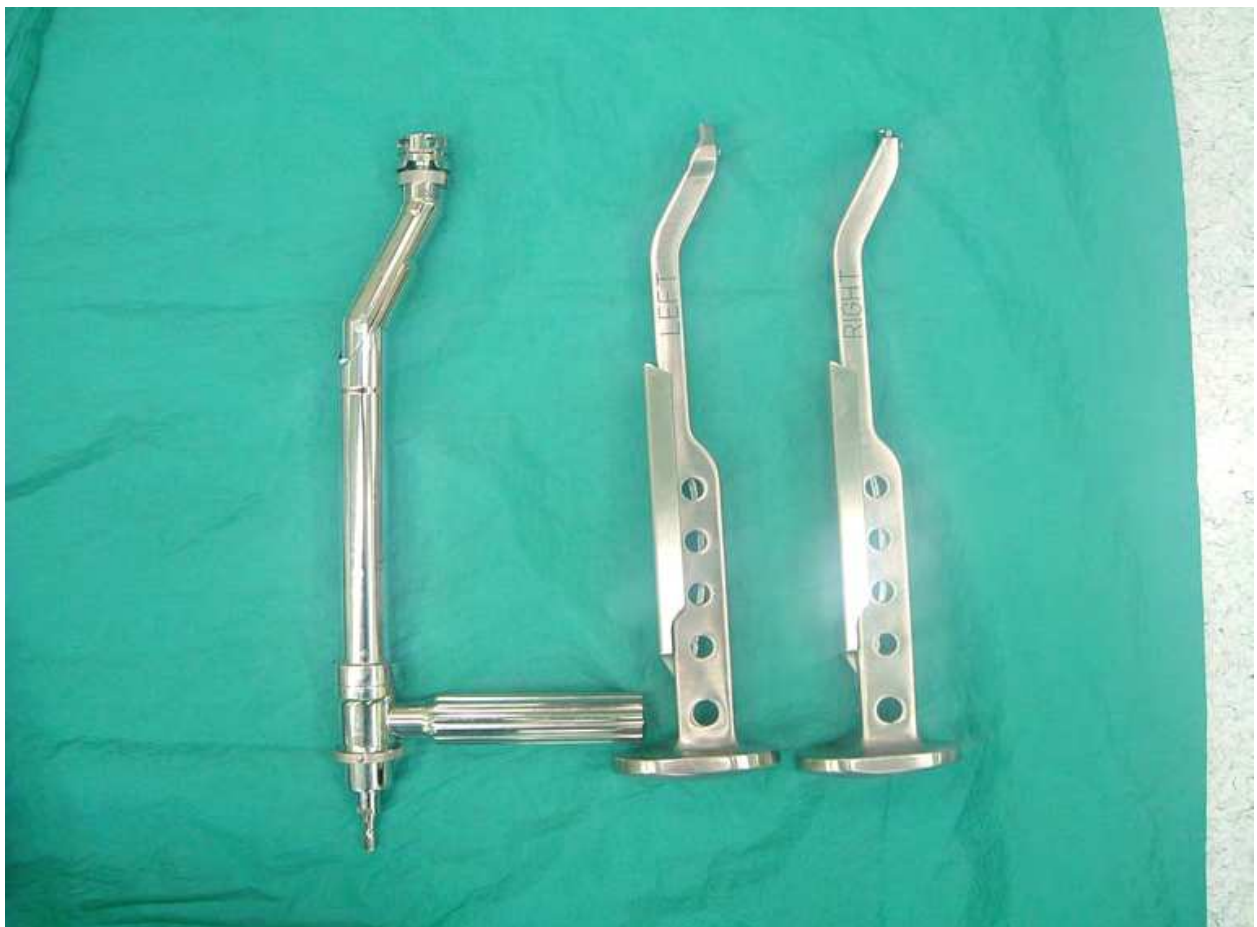
Fig. 5. Dog-legged instruments can be used to avoid skin and soft tissue impingement during MIS surgery.

and acceptable to the orthopaedic surgeons than the muscle-sparing techniques. The abridged incision techniques basically are the modification of the conventional approaches by reducing the skin incision and creating a mobile window for surgical field visualization. Special instruments are designed for the ease of surgery ( Figure 5 ) For the transgluteal approach to the hip joint, about one third to one half of the musculotendinous portion of gluteus medius and minimus are detached from the greater trochanter to facilitate anterior dislocation of the hip joint. Care should be taken not to damage the superior gluteal nerve by overstretching the muscle fibers. For the posterolateral MIS approach to the hip joint, the piriformis tendon or part of the quadratus femoris tendon can be preserved. The hip is dislocated posteriorly by internal rotation, adduction, and flexion. Emphasis has also been on the secure repair of the posterior capsule and the short external rotators after prosthesis implantation. By this modification, this approach proves to be a reliable and safe procedure and the dislocation rates are significantly decreased. [3,4]