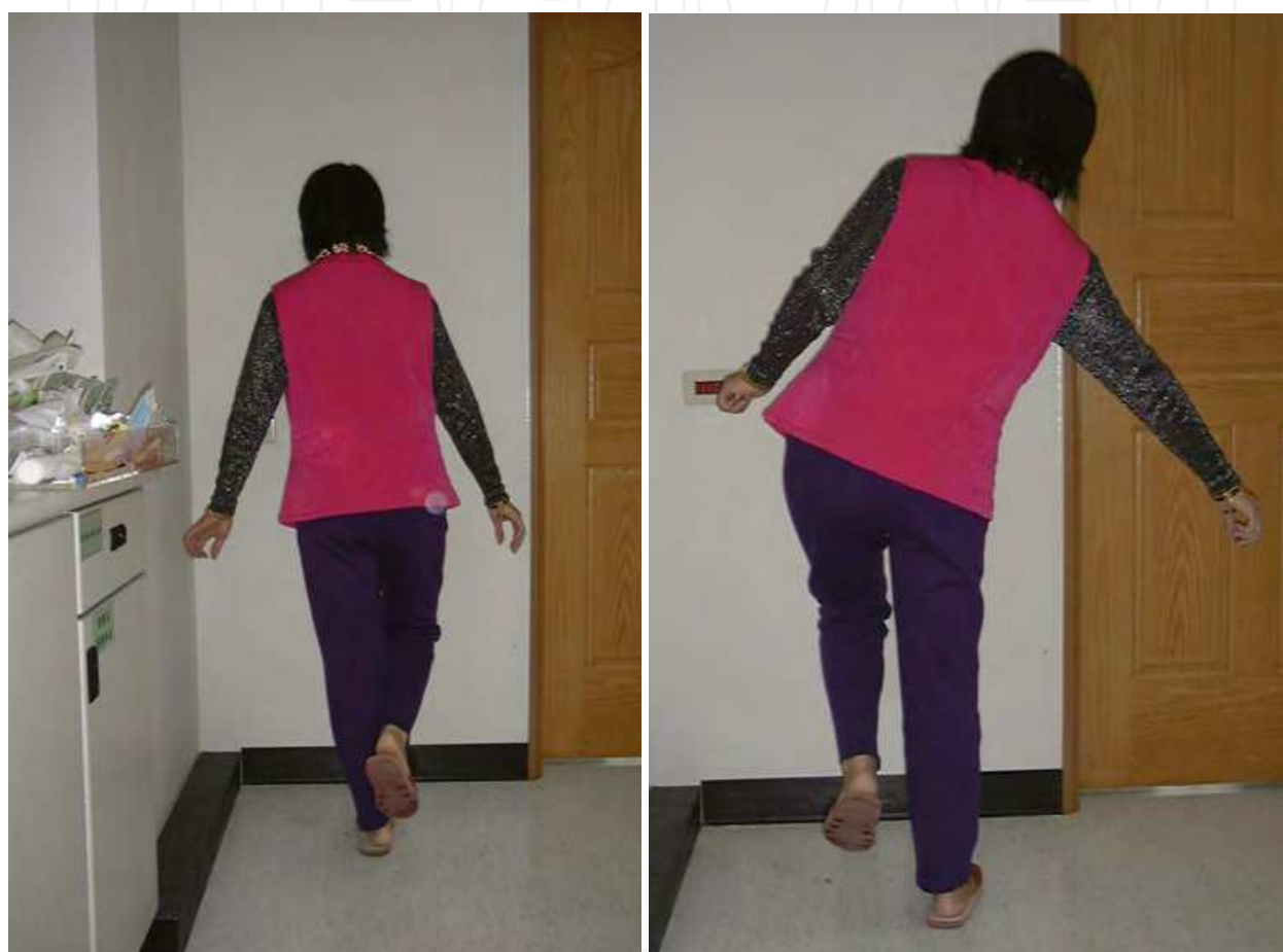
Fig. 2. The patient with abductors weakness. (A) When standing on the sound leg, the pelvis can be kept level and will not drop. (B) When standing on the affected leg, patient will compensatory list to the affected side to avoid pelvis dropping. (Duchenne sign)

and the joint capsule are then incised in a T-manner to facilitate anterior dislocation of the hip. In standard lateral approach of Hardinge [17], part of the vastus muscle can be incised to help the exposure. In modified method, the origins of the vastus muscle can be spared to decrease the tissue trauma. Possible risks of the approach involve an injury to the muscular braches of the superior gluteal nerve or direct injury to the muscle fibers by compression or retraction during surgery. This will result in damage to the gluteal muscles or muscular insufficiency and is associated with higher chance of Trendelenburg sign ( Figure 2 ) postoperatively. [18]