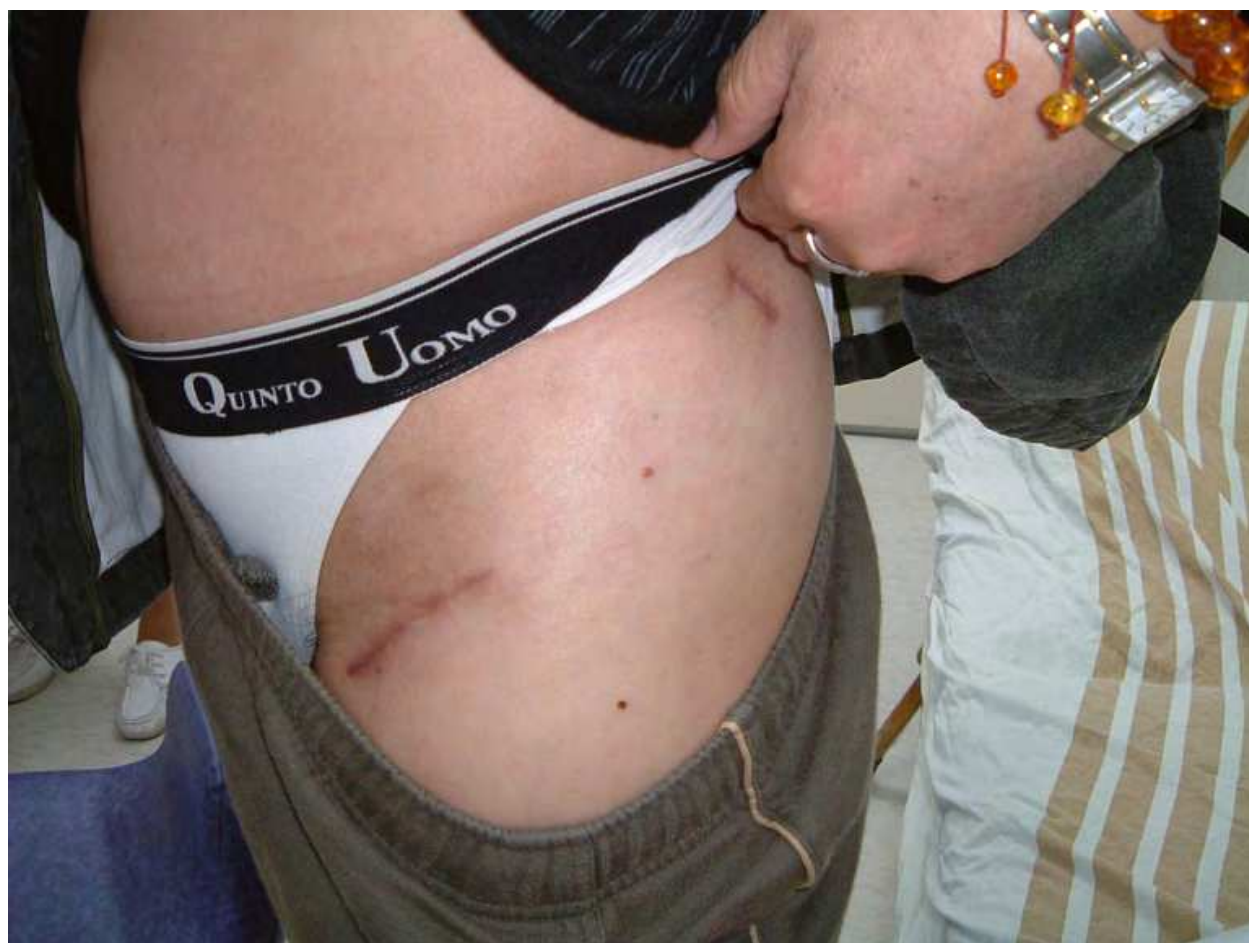
Fig. 3. Skin incision of the modified two-incision method.

We and others have modified the two-incision technique by putting the patient in the lateral decubitus position [9-11]. The anterior skin incision is made perpendicular to the long axis of the femoral neck about 3 to 4 finger-breadth distal to the ilioinguinal line. (Figure 3) The hip joint is approached through the Smith-Peterson interval. Double neck cutting to the hip joint is also needed. While the anterior skin incision is made along the intertrochanteric line, the greater trochanter and the proximal femur can be visualized more easily by gentle retraction of the gluteus medius and tensor fascia lata. By this modification, the process of femoral canal preparation can be safely done under direct vision without the help of the fluoroscopic monitoring. [9-11,19]