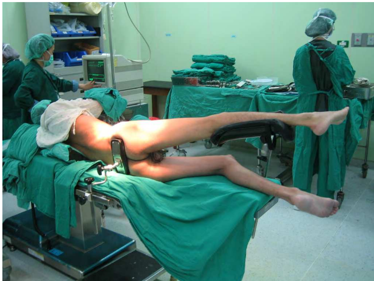
Fig. 4. The special operation table for modified Watson-Jones approach.

Matta et al. has described a unique method of THA using direct anterior approach to the hip. [22] The patient is put on a fracture table that the leg can be pulled by traction in extension and external rotation position. Fluoroscopy can be used during the procedure to control the leg length. However the technique needs a well organized surgical team to adjust the traction and fluoroscopy. Some rare complications such as the ankle fracture or calcaneal fracture have been reported.