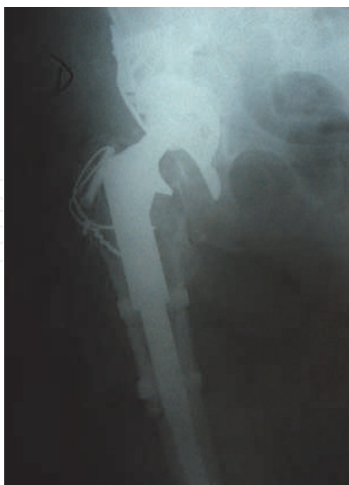
Fig. 2B. The same patient after revision total hip arthroplasty with insertion of a Bursch-Schneider acetabular supportive ring.