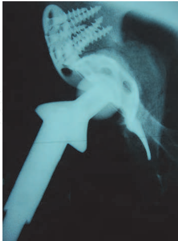
Fig. 3D. The same patient after revision THA on lateral radiograph. Note massive autologous bone grafts under the Bursch-Schneider ring.