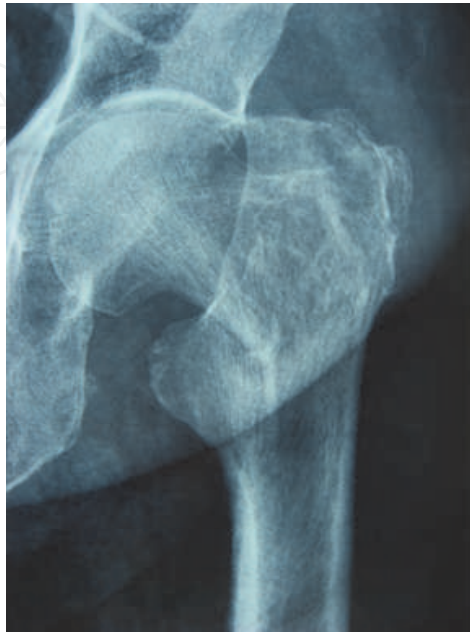
Fig. 1A. Proximal femoral fracture in a 74-year old female osteoporotic patient.

certainly be lowered by fast diagnostic procedures and a shorter time in bed waiting for the surgery. Internal fixation with femoral head preservation should be performed in the first 6 hours after the injury or only exceptionally in the first 24 hours. In older injuries hip arthroplasty should be performed (Sendtner et al., 2010). The bone healing potential is especially low in older patients (Figure 1).