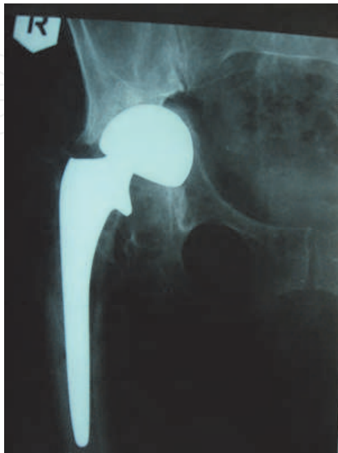
Fig. 2A. Acetabular fracture in a 64-year old patient 5 years after bipolar hemiarthroplasty for right femoral neck fracture.

While hemiarthroplasty avoids the known risks of internal fixation, it brings other risks of its own: infection, stem loosening, dislocation, and groin pain as an effect of acetabular protrusion (Figure 2) or cartilage erosion (the so-called endoprosthetic arthritis).