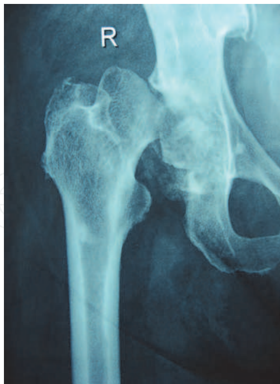
Fig. 3A. Subcapital fracture in a 71-year old female patient with osteoporosis.

Total hip arthroplasty is a durable treatment option for femoral neck fractures in the elderly and gives a good functional outcome, but comes with the price of a higher complication rate, such as dislocation or postoperative delirium (Gallo et al., 2010). Surgical technique adapted to osteoporotic bone and careful implant selection regarding fixation influence the success of treatment for femoral neck fractures (Figure 3). The risk of dislocation depends on the surgical approach, the reconstruction of hip biomechanics, the head size and offset, the quality of capsular closure, and the experience of the surgeon (Ames et al., 2010; Leighton et al., 2007; Rutz et al., 2010).