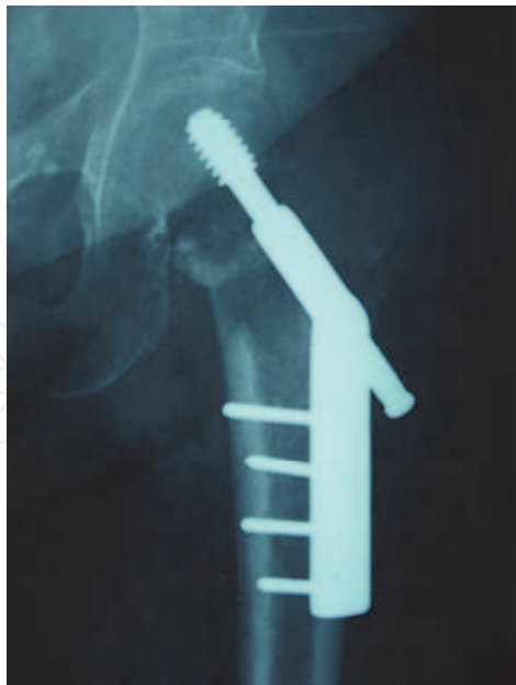
Fig. 1B. No signs of bony healing 6 months after open reduction and internal fixation with a dynamic hip screw (DHS) device. The patient is unable to walk.

In case we do not decide for preservation of the femoral head the remaining treatment options are unipolar hemiarthroplasty, bipolar hemiarthroplasty and THA.