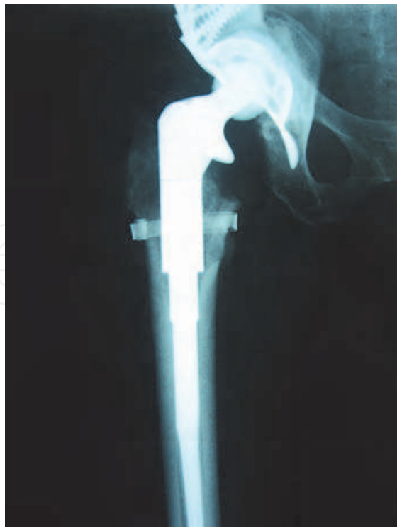
Fig. 3C. The same patient after revision THA with modular femoral stem and a Bursch-Schneider acetabular supportive ring.