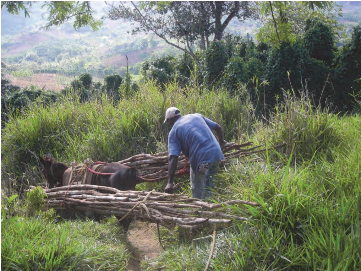
Fig. 1. A farmer transport farm inputs to a farm plot on a mule.