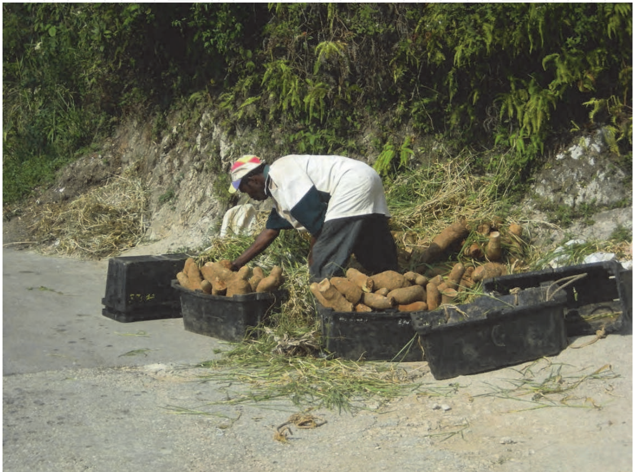
Fig. 3. A farmer prepares produce for sale at a roadside

farmers sell their produce to people mainly women who sell in produce markets across the country. Traditionally these women who are called higglers would go around to various farms and purchase different kinds of farm produce which would then be transported in a truck to the market place. Some farmers now take their produce to these markets themselves where they are sold in bulk to higglers or retailed to shoppers. The marketing and distribution of domestic foods have been identified as a major obstacle to production in Jamaica. There is no regulated system in place and small-scale farmers are basically left to their own devices in marketing farm produce locally.