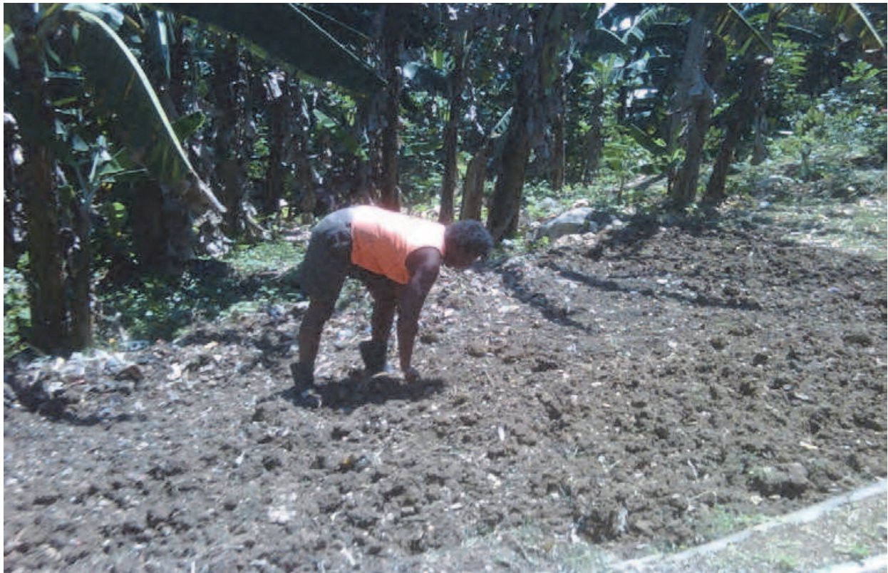
Fig. 2. A female farmer prepares land for cultivation

catering at weddings and other events and operating an eco-lodge which show-cased their Healthy Kitchen cuisine. This is the kind of approach which may be necessary to bring Caribbean populations back to local and traditional foods. It is different from conventional eat local campaigns conducted through the media which have been largely unsuccessful due to the top down approach and lack of grassroots community and household engagement.