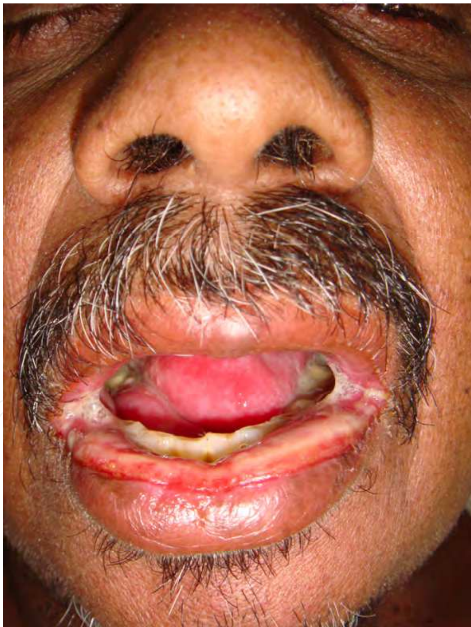
Fig. 2. Oral mucositis in a patient.

statistically significant differences in mucositis; however, the sucralfate group reported less oral pain, and other topical and systemic analgesics were started later in the course of radiation [20]. A prospective double-blind study compared the effectiveness of sucralfate suspension versus diphenhydramine syrup plus kaolin-pectin on radiotherapy-induced mucositis. Data were collected daily, including perceived pain, helpfulness of mouth rinses, weekly mucositis grade, weight change, and interruption of therapy. Analysis of the two groups revealed no statistically significant differences between the two groups. In a retrospective review, 15 patients who had not used daily oral rinses were compared with the two groups, and the results suggested that the use of a daily oral rinse with a mouth-coating agent may result in less pain, reduce weight loss, and help prevent interruption of radiation because of severe mucositis[21].