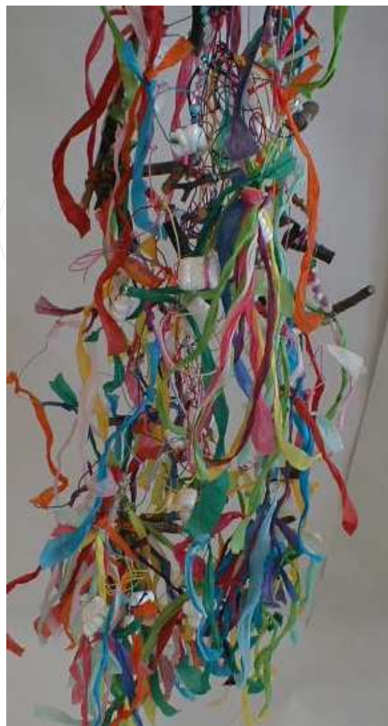
Fig. 5. A Portrait of Beauty. Detail.