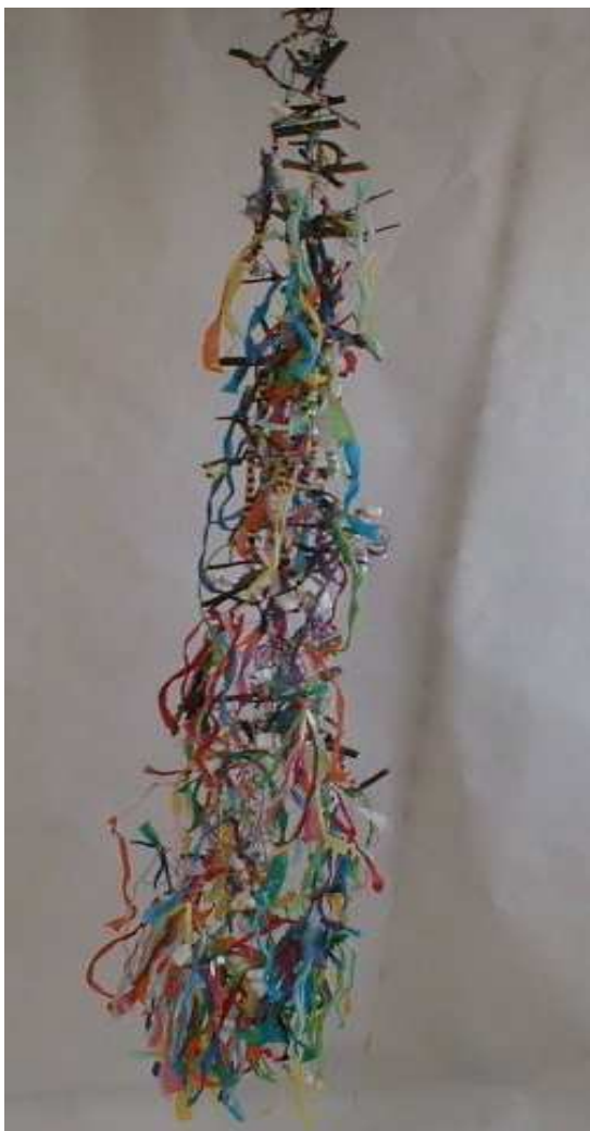
Tissue, wood, beads and wire. Height 8'