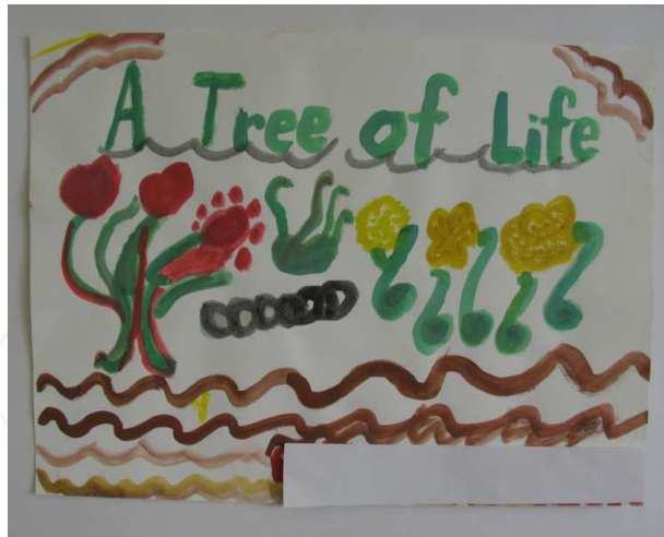
Fig. 1. A Tree of Life. Watercolor on paper. 12X18.