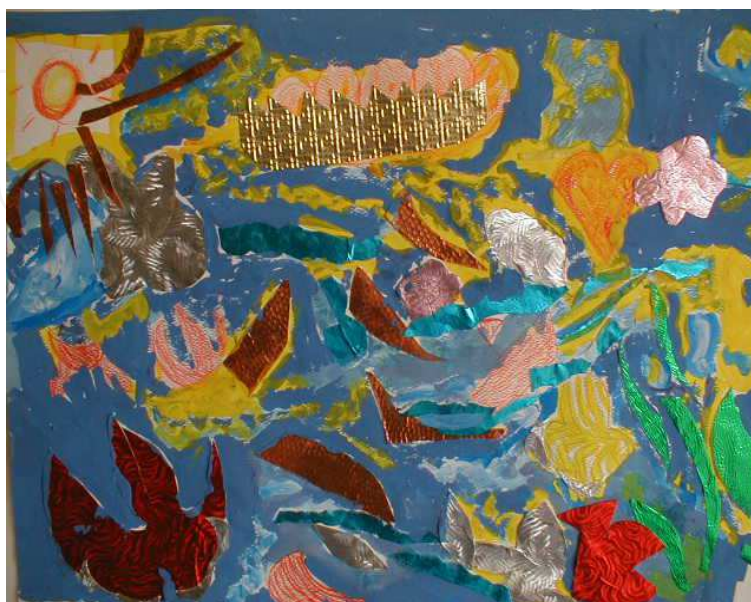
Fig. 3. Collage. Tempera & Paper on Paper.

the psychic level of fragmentation intrusively impinges upon the process. The smoothness of paint and the insubstantiality of pencils were quickly sabotaged and aborted as a result of the fragmented nature of Evelyn's cognitive and affective chaos, leading to further disconnection and fragmentation.