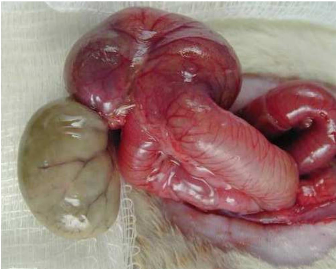
Fig. 4. Twenty-four hours after cecal ligation and puncture model. Note the impressive intestinal edema around the necrotic tissue.

et al. (2000) reported no changes in leukocyte adhesion in the mesentery in an acute model (4 hours) of CLP. However, a topical application of highly diluted fecal matter increased leukocyte adhesion in the mesenteric microcirculation, which was mediated by platelet activation factor. More recently, Nakagawa et al. (2006) observed leukocyte-endothelium interactions in the mesenteric microcirculation after hemorrhagic shock/reperfusion followed by an intra-abdominal sepsis (CLP). Twenty-four hours after the double-injury, rats exhibited an increased number of rolling, adherent and migrated leukocytes accompanied by an increased expression of P-selectin and intercellular adhesion molecule (ICAM)-1 at the mesentery and by leukocyte infiltration and ICAM-1 up-regulation at the lungs.