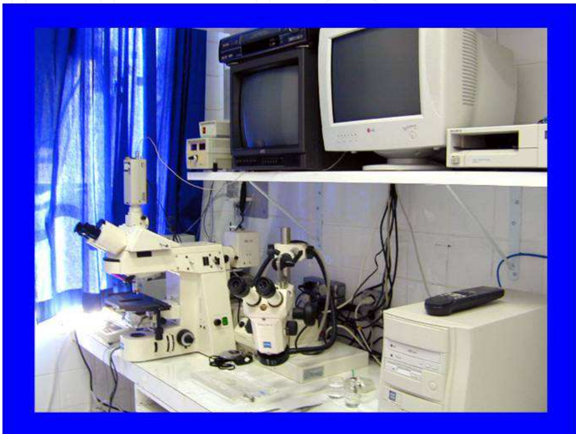
Fig. 1. Equipment for Intravital Microscopy.

fluid composition, pH, and gas tensions. The introduction of close circuit television has facilitated quantification of many of the variables, such as leukocyte-endothelial interactions, through the possibility to store images on videotape for detailed off-line analysis. More recently, analyses have been performed online by using image-computer software (Nakagawa et al, 2006).