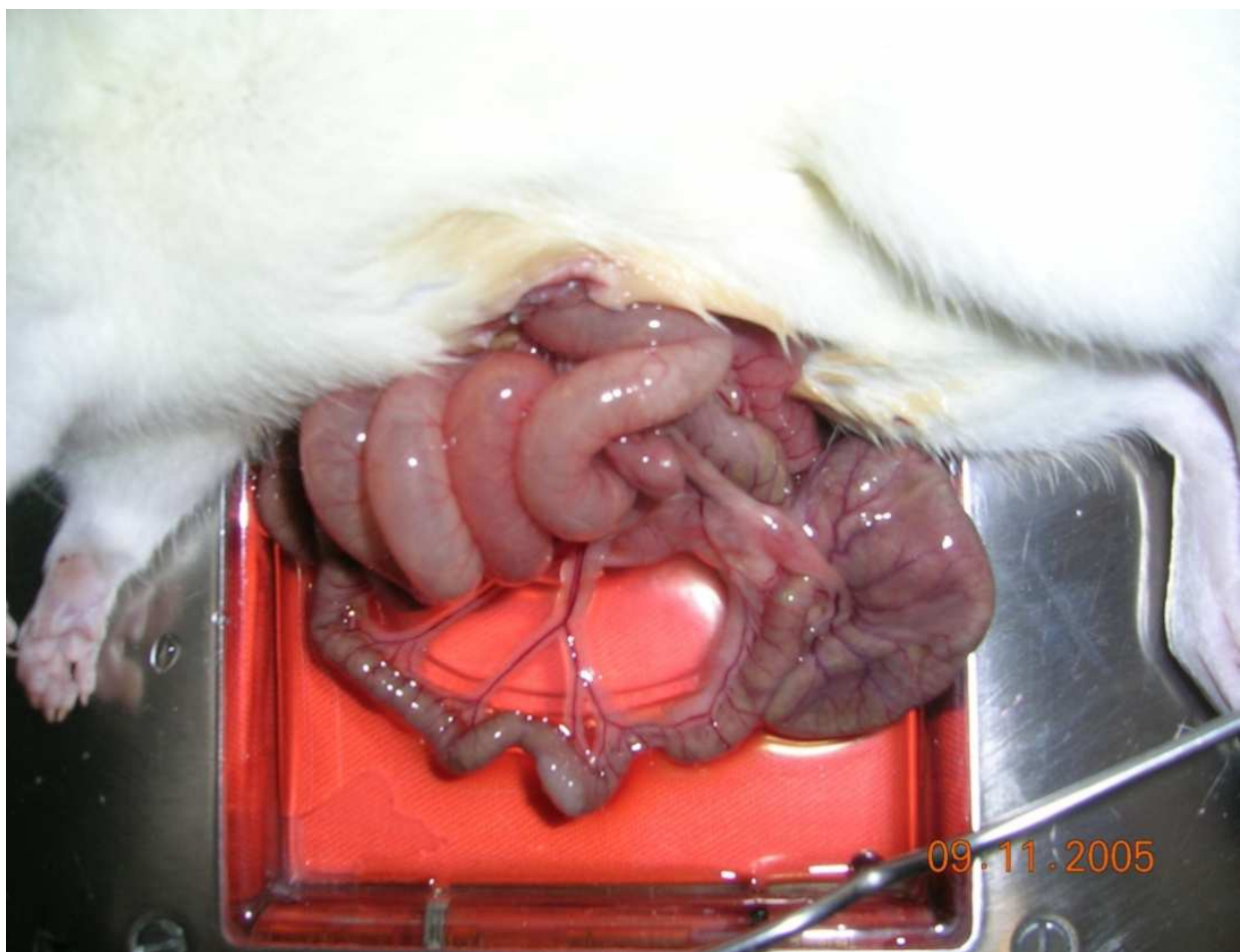
Fig. 2. Positioning of the mesentery in the platform for intravital microscopy.