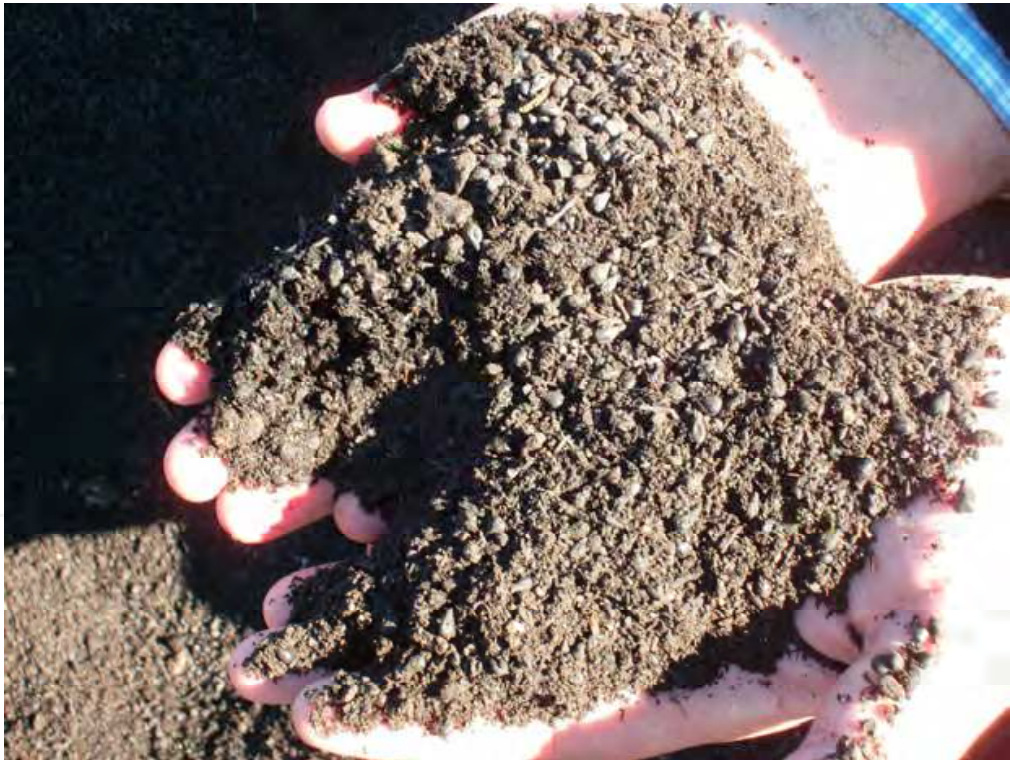
Fig. 9. Vegetable waste compost produced with grapes residues from CAPEL, Punitaqui, Chile

As part of a correct management procedure, previous acid rinsing and saturation with the standard nutrient solution are recommended in order to reduce the compost salinity and inadequate pH of the rhizosphere environment (Table 3). Once the physical-chemical properties were adjusted for soilless culture, yield trials proved the suitability of the compost as an acceptable soilless growing media and as a viable and ecologically-friendly alternative to rockwool and coconut coir waste (Table 8). In northern of Chile, Mazuela eta al., (2010) have similar results that shows in Table 9.