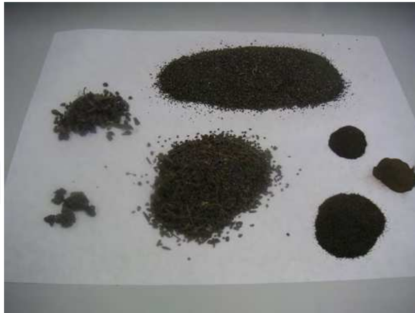
Fig. 3. Texture and coarseness index in new compost