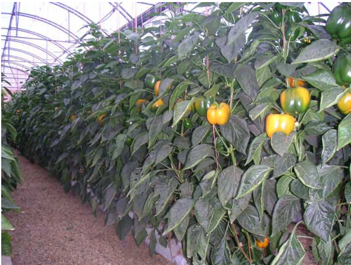
Fig. 11. Pepper production in growing media in southeastern Spain

In the Mediterranean region, the control of soilless vegetable cultivation is commonly through measurement of some fertigation parameter ranges in the drainage; pH, electrical conductivity and volume percentage (e.g., Villegas, 2004; García, 2004; Urrestarazu et al., 2005b). Table 11 shows reference values of nutrient dissolution for horticultural crops for each substrate. They are measured almost daily and are easier and cheaper than other analyses or/and fertigation methods based on nutrient solution content in the substrate (Sonneveld and Straver, 1994), which in practice are only used one or two times during the crop cycle. Smith (1987) and Urrestarazu et al. (2005a, 2008) suggested that under adjusted management of the fertigation according to the different proprieties of the substrate, and within certain limits, it is possible to maintain the main parameters used as control for the fertigation method. Since in southeastern Spain rockwool (García, 2004) and perlite (García et al., 1997) are commonly used for similar lengths of time, it is suggested that alternative substrates are economically viable, since their cost is the same.