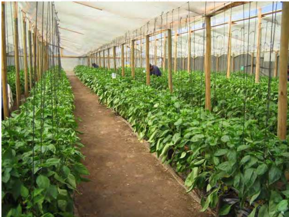
Fig. 10. Pepper seeds production in Quillota, Chile

Bulk density is a relevant substrate physical propriety, because this allows easier transportation of crop units in the greenhouse industry (Abad et al., 2004). The new substrates, before reutilization, were within the limit of optimal range (Urrestarazu et al., 2005b); in fact, this is the major disadvantage for transport in comparison to other more popular substrates such as rockwool and perlite (Mazuela et al., 2005; Urrestarazu et al., 2005b).