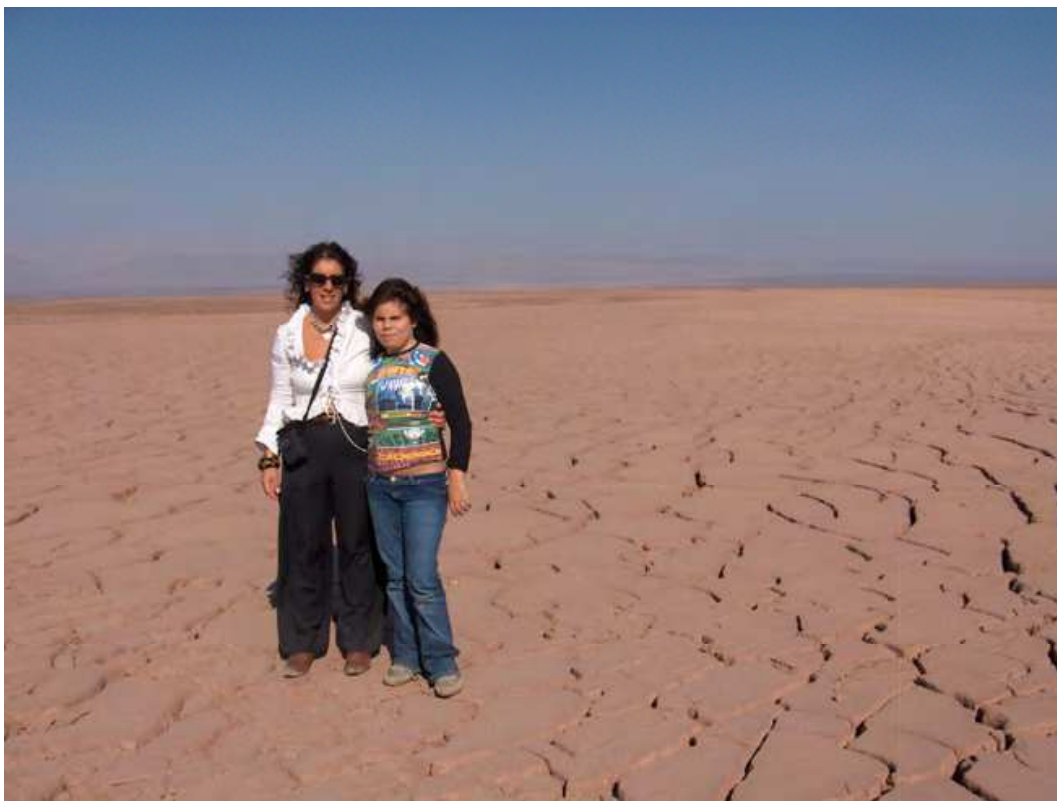
Fig. 14. Desert lands can be cultivated by soilless culture