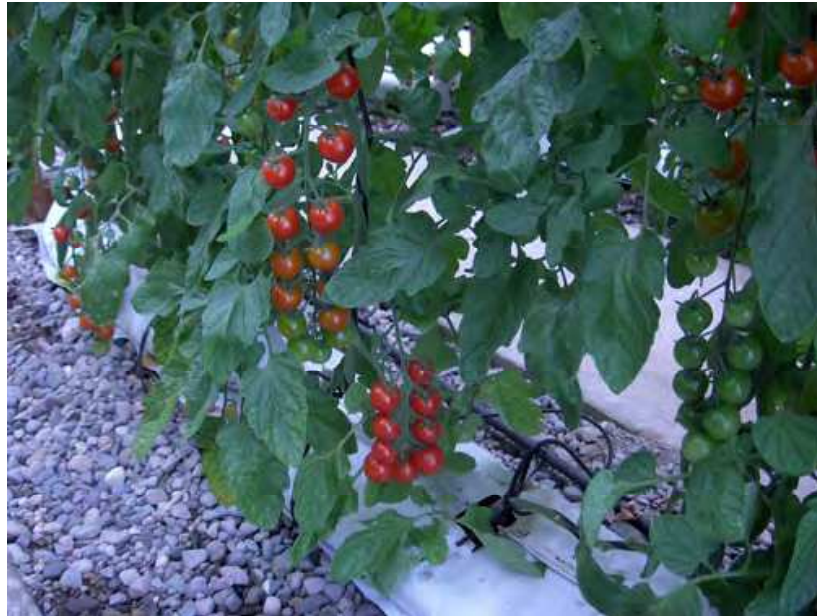
Fig. 5. Cherry production using compost as substrate in northern Chile