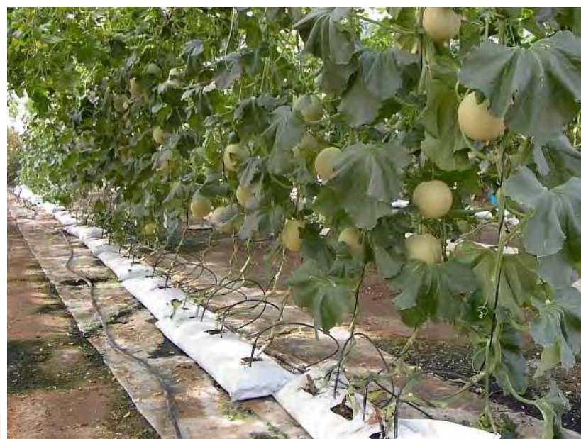
Fig. 4. Melon production using compost as substrate in southeastern Spain