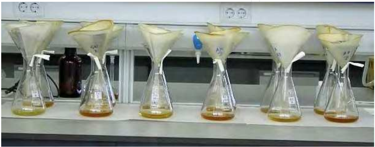
Fig. 1. Leaching compost assays

has been suggested that certain types of compost alone are unsuitable as growing media due to unacceptably high salt and pH content (Spiers and Fietje, 2000), in particular when immature, unstable compost is used (Ozores-Hampton et al., 1999). Another disadvantage of the use of compost as substrate is that it is a very heterogeneous material and therefore needs to be amended so that it can be used as substrate (Urrestarazu et al., 2000; Urrestarazu et al., 2001; Urrestarazu et al., 2003; Sanchez-Monedero et al., 2004; Carrión et al., 2005; Mazuela et al., 2005; Mazuela et al., 2010)). Once physical-chemical properties were adjusted for soilless culture, yield trials proved the suitability of compost as an acceptable soilless growing media and as a viable and ecologically friendly alternative substrate.