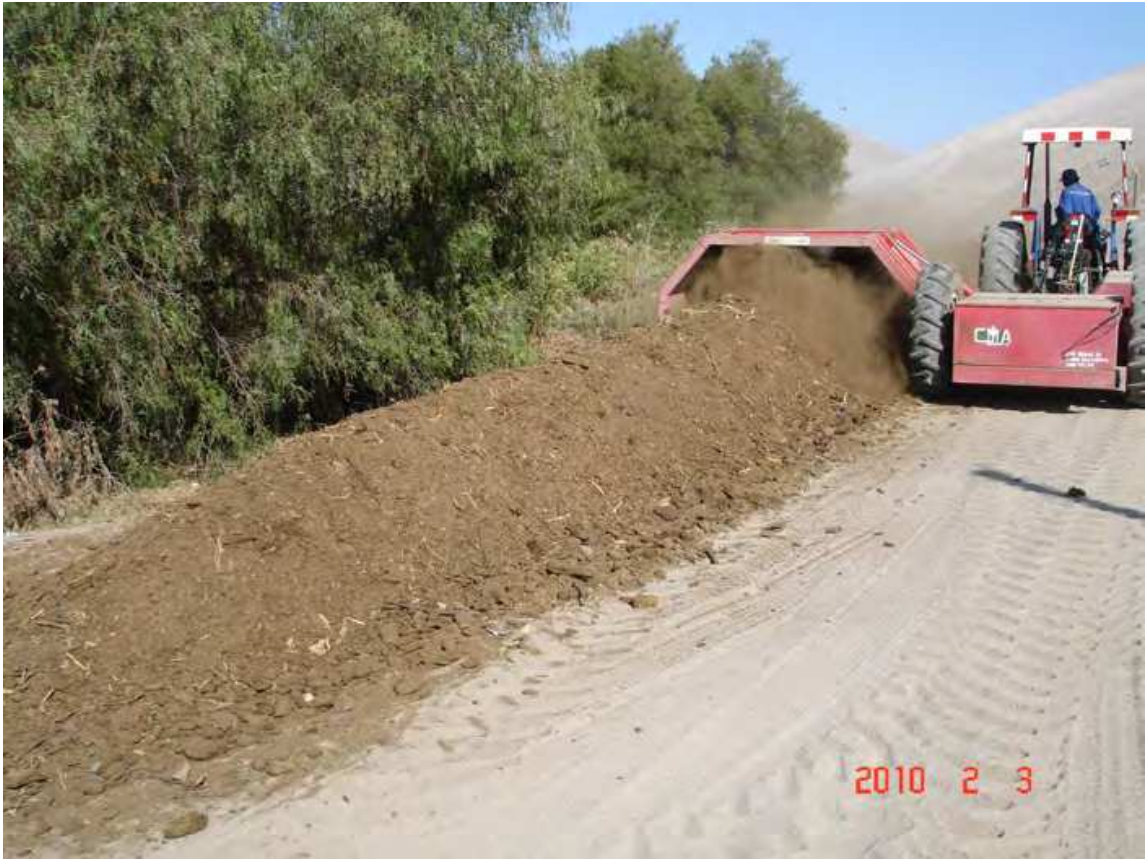
Fig. 12. Composting in arids zones, Arica, Chile