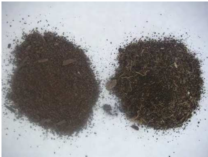
Fig. 2. New and re-used compost from horticultural waste crops