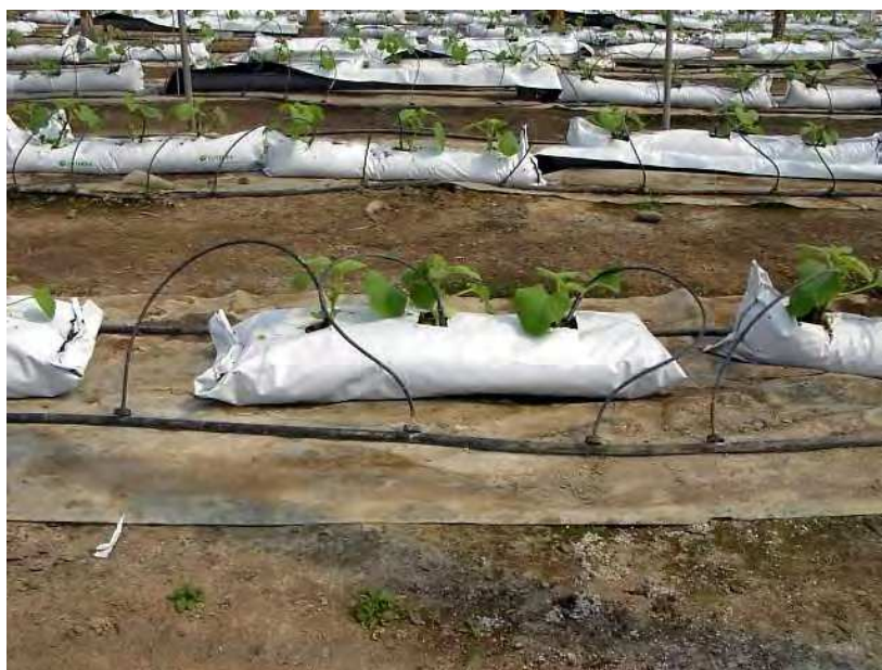
Fig. 8. Melon transplant production