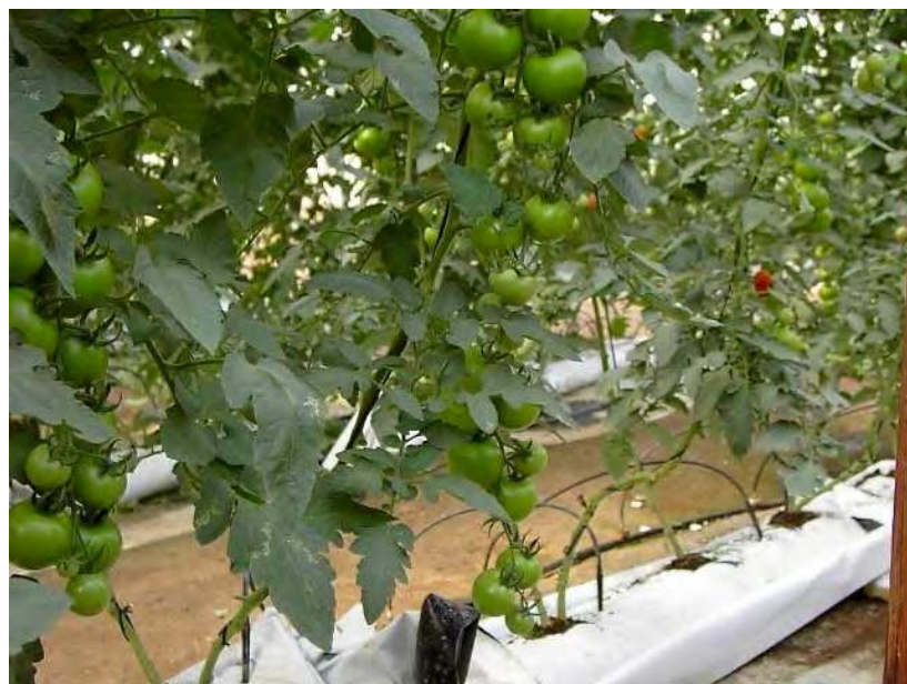
Fig. 6. Tomato production using compost as substrate in greenhouse

Alternative substrates have the advantage of being locally produced, renewable and contaminant and disease-free (Salas et al., 2000), and may be less expensive than any other traditional growing media used in soilless crop production. Abad et al. (2002) reported that coconut coir waste may be used for ornamental crops, and the decision on whether to use it as a peat substitute will depend primarily on economic and technical factors, and secondly on environmental issues.