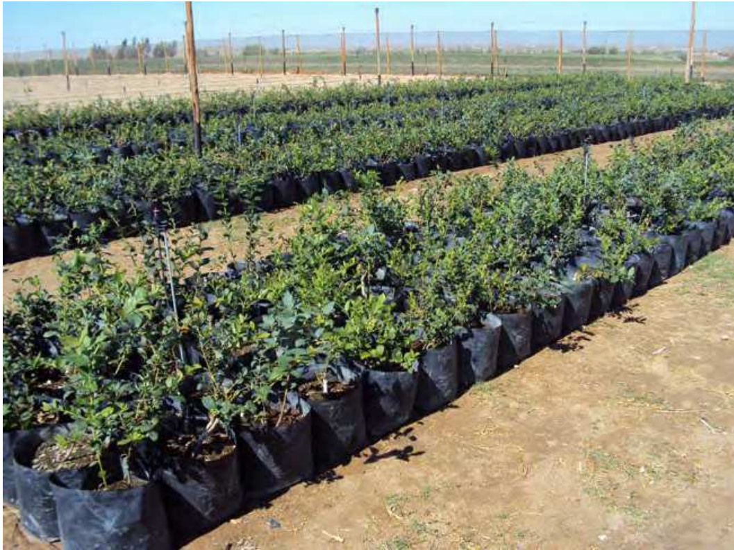
Fig. 13. Blueberry production in Arequipa, Peru