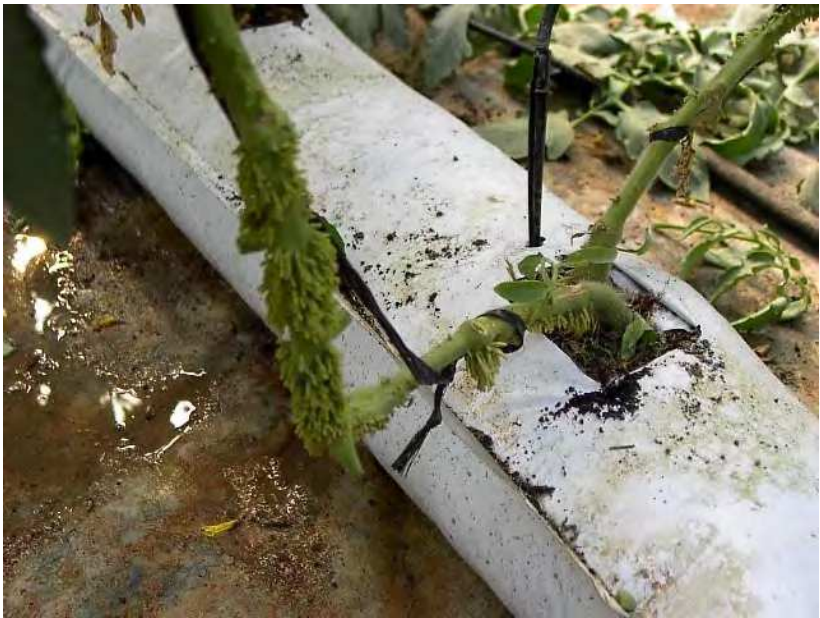
Fig. 7. Effect of high salinity on a tomato crop Selected characteristics of some alternative substrates are given in Table 1.