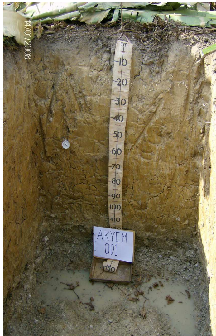
Fig. 4. Typical profile of Oda soil series (FAO/WRB: Eutric-Gleysol )