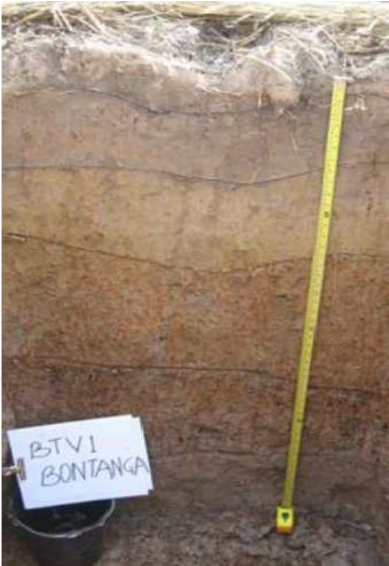
Fig. 2.a. Typical profile of Volta soil series (FAO/WRB: Eutric Gleysol )