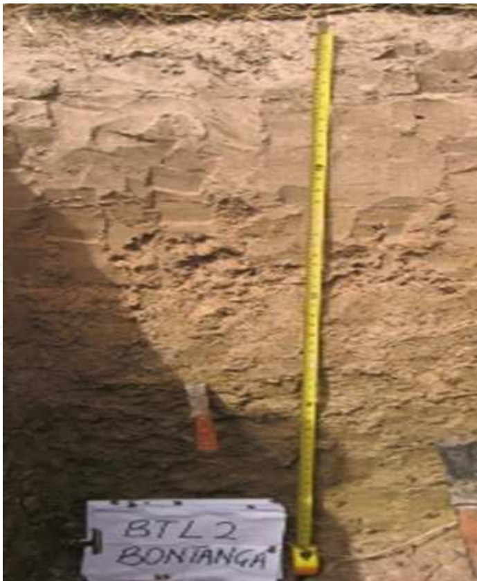
Fig. 1.a. Typical profile of Lima soil series (FAO/WRB: Endogleyi-Ferric Planosol )