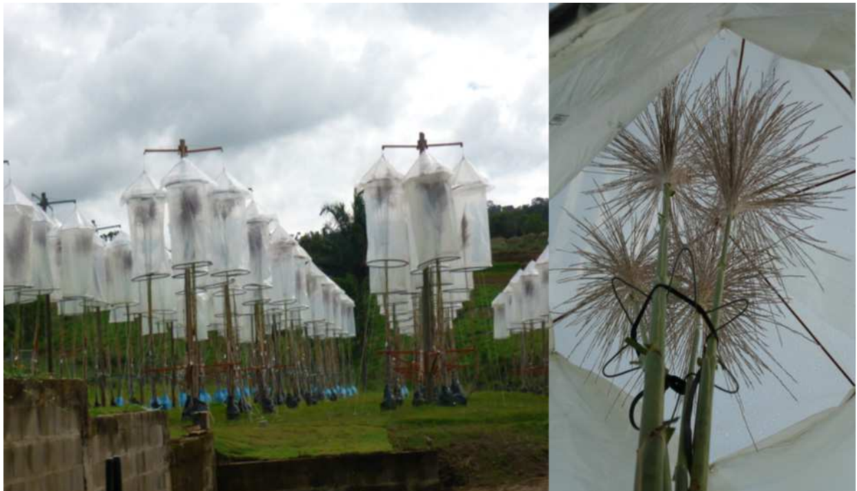
Fig. 2. Sugarcane crossing being carried out under lanterns .

value of its corresponding family (Falconer & Mackay, 1996). Family selection is only more efficient than individual selection when the heritability based on family means is higher than the heritability of the individual plants. According to McRae et al. (1993) and to Cox et al. (1996), association of family selection with individual selection is more efficient than selection based only on families for sugarcane. Cox & Hogarth (1993) stated that family selection with repetition of each clone, followed by individual selection within the best family is the most efficient way to select sugarcane.