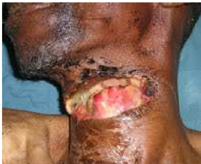
Fig. 1. Infected suicidal cut throat injury at presentation.

In some environment, late presentation is a common feature due to factors like ignorance and of course poverty which may also invariably be the triggering factor for the suicidal attempt. In the event of late presentation, debridement of infected tissues is also done prior to suturing (Figure 1). Debridement may also mean loss of substantial amounts of tissue to effect simple and proper closure. Ideally, pharyngeal, hypopharyngeal and laryngeal mucosal lacerations should be repaired early because the time elapsed before repair of laryngeal mucosal lacerations has an effect on both airway stenosis and on voice restoration 30 . Soft laryngeal stent may be needed for severely macerated mucosa.