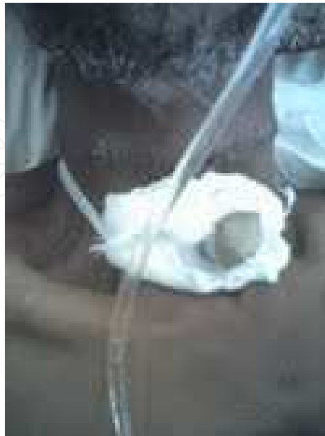
Fig. 2. Repaired cut throat injury.

Some authors are of the opinion that self-harm attempts can be grouped into 'serious suicide attempts' and more impulsive forms of deliberate self-harm. The former is typically associated with severe mental illness, high intended lethality and attempts by the suicide attempter to avoid rescue. The latter is considered a manifestation of personality disorder or acute crisis, where there are impulsive, poorly planned attempts at self harm. This rule of thumb may be misleading, regardless of the potential for death or serious injury in the deliberate self harm category, the rates of completed suicide years after a seemingly minor episode of so called 'deliberate self harm' are significant. This fact is highlighted in a study done in Australia in which 223 patients were followed from 1975 onwards. Of those who had made an attempt at deliberate self harm in the mid 1970's, 4% had completed suicide at 4 years, 4.5% at ten years and 6-7% by 18 years.