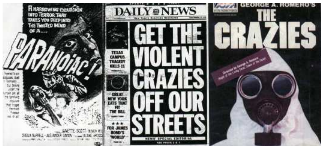
Newspaper headings in US journals

These claims hold true for American and British media especially. There are few reports of negative media coverage from other countries, with the exception of Australia. Public disdain and branding not only significantly affect ill individuals, but also the services provided to them, which is the reason for numerous educational programs aimed at