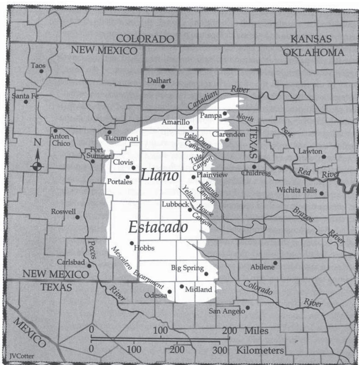
Fig. 1. The Southern High Plains of northwest Texas and eastern New Mexico (from Morris, 1997).

The featureless landscape of the Southern High Plains is relieved only by Holocene dune fields (formed during droughts of the Altithermal period) along its southwestern borders (Holliday, 1989), >20,000 ephemeral playa wetlands scattered across the landscape (Bolen et al., 1989; Haukos & Smith, 1994; Smith, 2003), approximately 40 historically spring-fed saline lakes, and several currently dry, but historically spring-fed tributaries (i.e., “draws”) of the Colorado, Brazos, and Red Rivers (Holliday, 1990). The deep sandy soils associated with the dune fields, found primarily in the southwest portion of the Southern High Plains, along the Texas – New Mexico border, form a unique and distinctive ecosystem about which little is known ecologically.