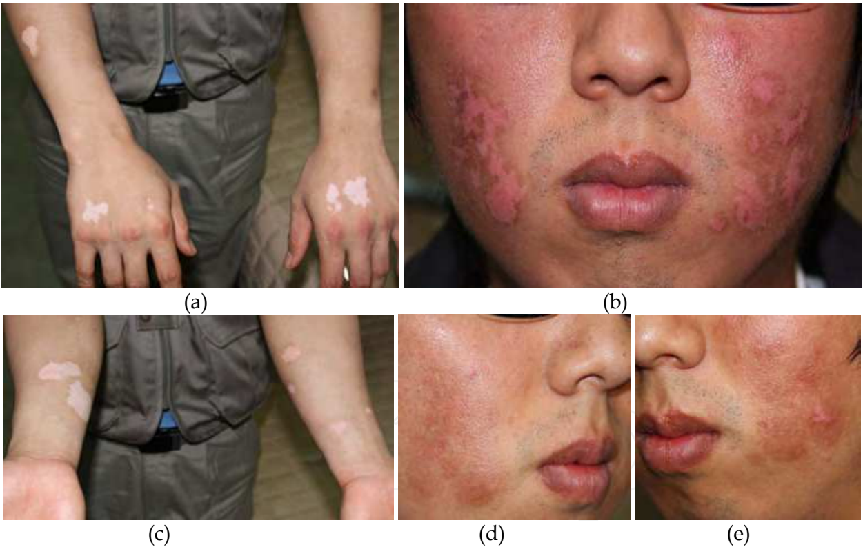
Fig. 2. (a) and (b). Occupational vitiligo induced by welding. (c) – (e). Vitiligo on areas in contact with a disposable mask, before (c) and one month after treatment (d, e)

Identification of possible occupational trauma is important as well. Figures 2A & 2B suggest that occupational trauma such as burns or chemical irritation ( e.g. , by discharge in an electric arc or argon welding) can exacerbate vitiligo. The patient in Figure 2C, working in a disposable mask, developed vitiligo in the perioral area where the mask was fitted. As expected, the skin lesions improved with switching to a cotton mask and excimer laser treatment for one month (Figures 2D & 2E).