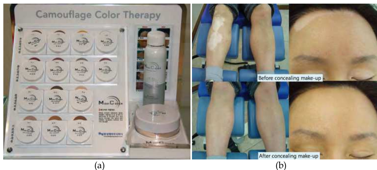
Fig. 6. (a). Concealer cosmetic set for vitiligo patients. (b). Patient before and after makeup.

Special makeup products are also helpful. Cosmetics are limited by their easy removability (can be washed away by sweat) and they can be messy (get on clothing), however tend to give vitiligo lesions the most natural skin color. Many patients prefer makeup, which can achieve cosmetically acceptable results in an investment of 20 minutes a day. Special makeup is acceptable, but it is more effective when combined with DHA or walnut solution. Figure 6 shows a patient before and after makeup. To maintain the stability of makeup where it is applied, non-glossy hair spray (Korean) or Cavilon 3M™ spray (Tanioka & Miyachi, 2008) can be used after application of makeup. Some KAV patients use spray-on stockings on a DHA-primed leg lesion and results are often satisfactory. However, it is difficult for beginners to produce satisfactory results using various makeup products. The methods using DHA, walnut shell, and special makeup products all require hours of patient teaching and practice. Tanioka and Miyachi (2009) also emphasized the importance of lessons in camouflage techniques.