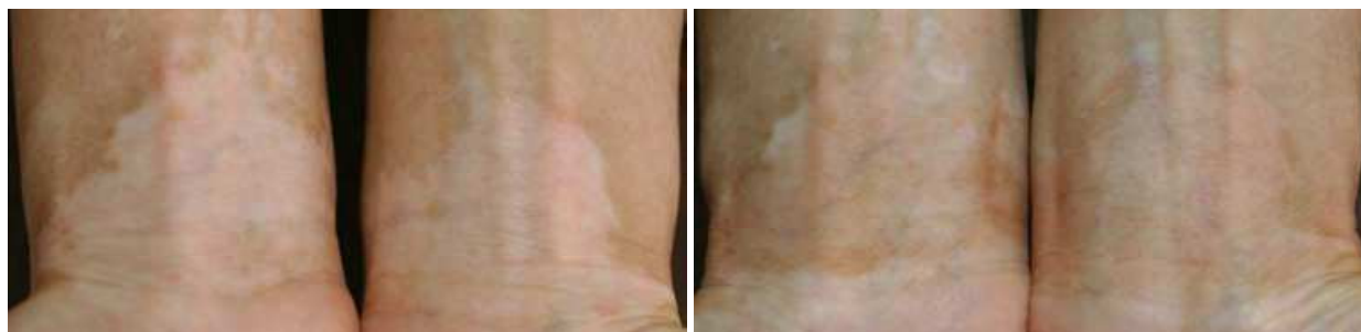
Fig. 5. Concealing with 7.5% dihydroxyacetone (left), and walnut shell extract (right). A. Before concealing. B. After concealing.

Applying a dye from premature walnut shells is a natural pigmentation aid for vitiligo. Premature walnut shells are frozen and made into a solution. This can further be diluted to match skin color, in particular for patients with yellow undertones. However, this method can cause an allergic contact dermatitis (due to the walnut shell), and due to the instability of the dye solution, it becomes less effective after a day.