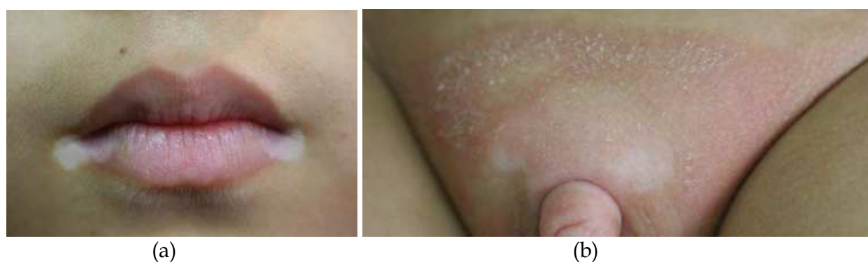
Fig. 3. A. Vitiligo on angles of mouth. B. Vitiligo associated with atopic dermatitis and diaper dermatitis.

Enough rest and appropriate treatment can help vitiligo in the “T-zone” areas where seborrheic dermatitis commonly occurs. If a lesion appears in areas which have a predilection for atopic dermatitis, doctors should pay special attention to treatment of the skin lesion. Adjunctive use of ketotifen and gamma-linolenic acid is useful. For the patient in Figure 3B, phototherapy as well as treatment for atopic dermatitis and diaper dermatitis would be necessary.