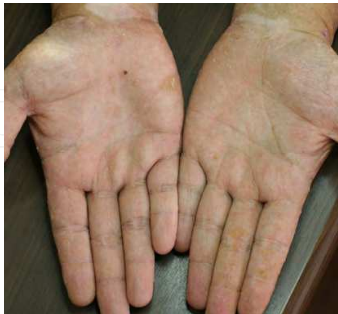
Fig. 4. Arsenic keratoses in vitiligo patient

applying them to the skin can improve vitiligo. Nevertheless, it is more beneficial not to use these in terms of potential risks involved.