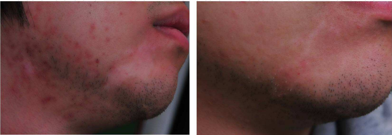
Fig. 6. Before (left) and after (right) epidermal grafting in segmental vitiligo.

when oral corticosteroid was added to the grafting procedure. 38 In addition, we also presented that achieving better results in SV may be contingent on combination therapy utilizing epidermal grafting with systemic corticosteroids. 39 SV may continue to spread even a few years after onset of disease. We presented a case of SV which continued to spread after epidermal grafting; the new lesions did not involve the area of previous epidermal grafting, but repeated epidermal grafting was successful. 40 This case indicates that epidermal grafting can be useful for the treatment of SV although recurrence may arise.