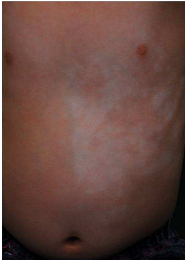
Fig. 2. Segmental vitiligo on the abdomen.