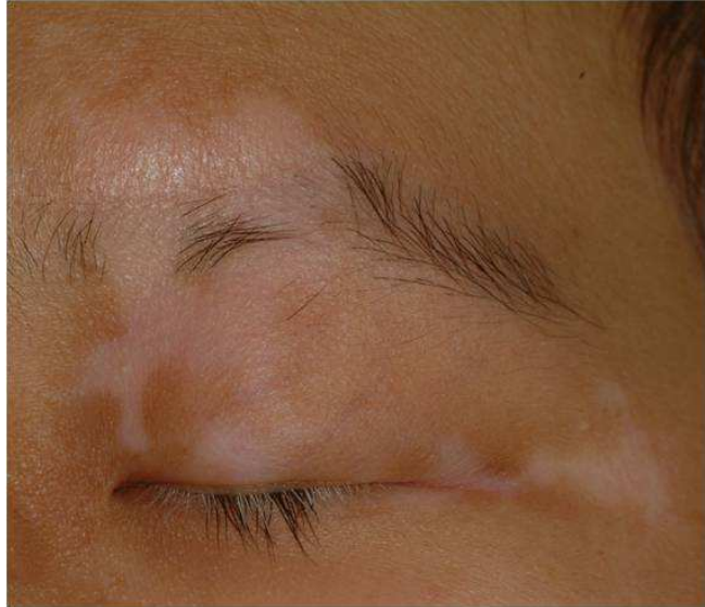
Fig. 1. Segmental vitiligo on the face.

The face is the most common site of SV regardless of gender (Figure 1). According to the Hann and Lee study, 51% of SV involved the face, 25% the trunk (Figure 2), and 11% the extremities. In our own study, 54% of SV involved only the face. 4 An additional 17% had both face and neck involvement of SV (Figure 3). 6