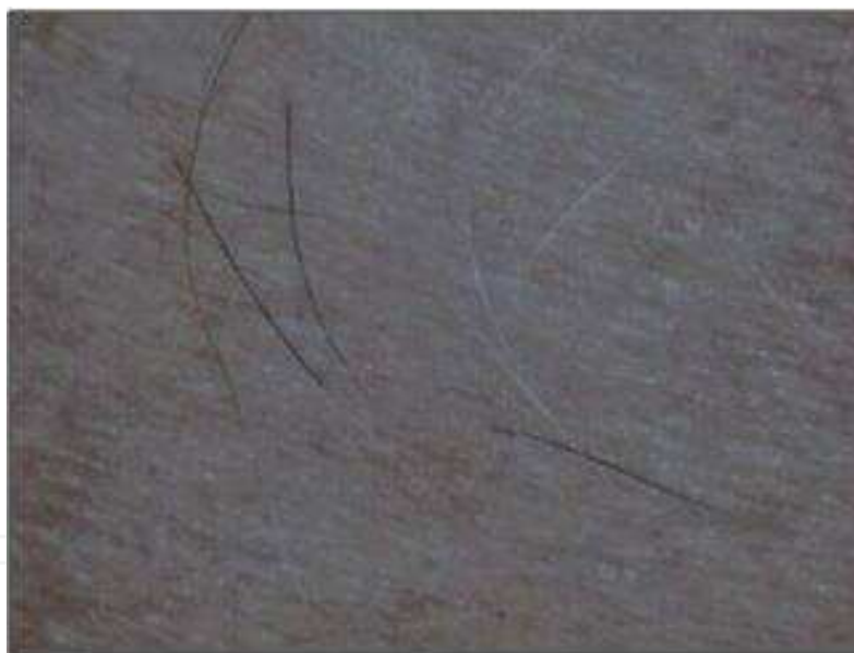
Fig. 5. Leukotrichia in a segmental vitiligo lesion can be seen easily using portable digital microscopy (magnified 30x)

It has been proposed that the rare instance of SV progresses into a generalized form, that this be called mixed vitiligo. 19 However, this likely represents only the rare circumstance of concurrent SV and NSV rather than its own independent vitiligo type.