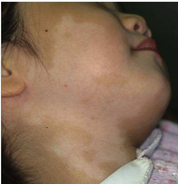
Fig. 3. Segmental vitiligo on the face and neck.

Hann et al proposed the original classification of the SV distribution of the face. 17 This was revised to include 6 types depending on pattern and area of involvement. 15 This classification may be valuable for certain aspects of prognosis, such as the likely degree and path of lesional spread.