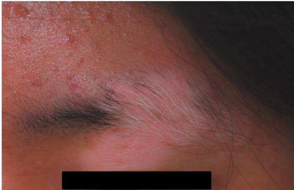
Fig. 4. White hairs of the eyebrow in segmental vitiligo can be seen.