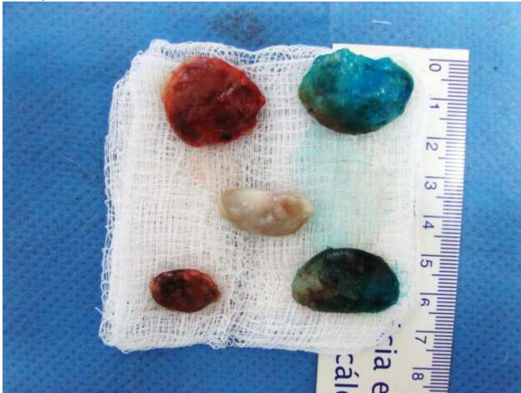
Photo 2. Sentinel lymph nodes marked with hemosiderin at left and with patent blue at right. Non-sentinel lymph node in the middle.

In bid to replicate what was seen in patients, we developed an experimental protocol for obtaining a marker derived from blood and tested in a model of experimental surgery in dogs (Photo 2).