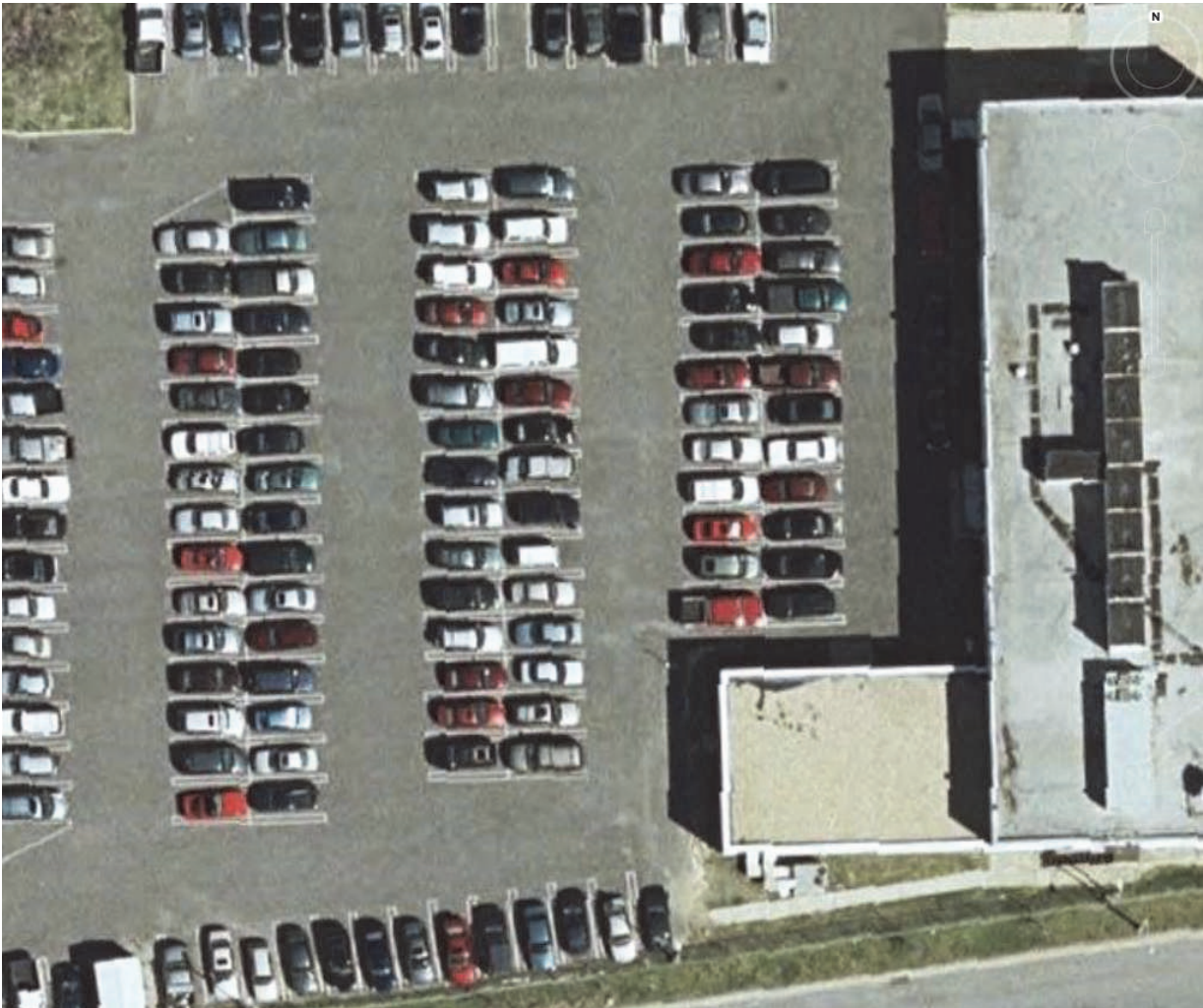
Fig. 3. Image of the target zone on Google Earth.