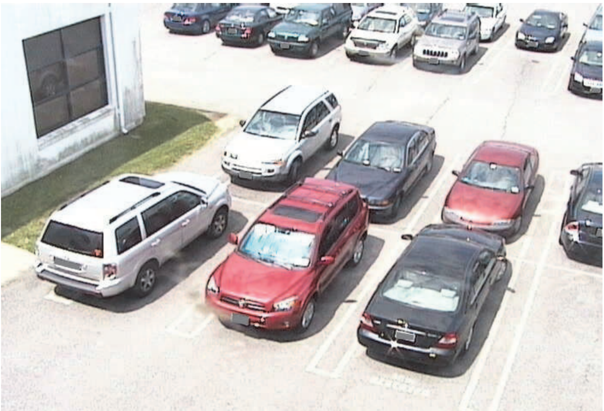
Fig. 1. Video image of the parking lot and part of a building from a surveillance video camera on the roof top.

An information integration prototype module with the Battlefield Augmented Reality System (BARS) (Livingston et al., 2004) has been implemented. This module is an HTTP server implemented in C++ that sends icons and image data to Google Earth. The methods are tested in a typical urban environment. One user roams the area while another object is a fixed pan-tilt-zoom network surveillance camera (AXIS 213 PTZ Network Camera) mounted on top of the roof on a building by a parking lot. This simulates a forward observation post in military applications or surveillance camera in security applications. The command and control center is located at a remote location running the MR application and Google Earth. Both the server module and Google Earth are running on a Windows XP machine with dual 3.06 GHz Intel Xeon CPU, 2 GB RAM, and a NVIDIA Quadro4 900XGL graphics card.