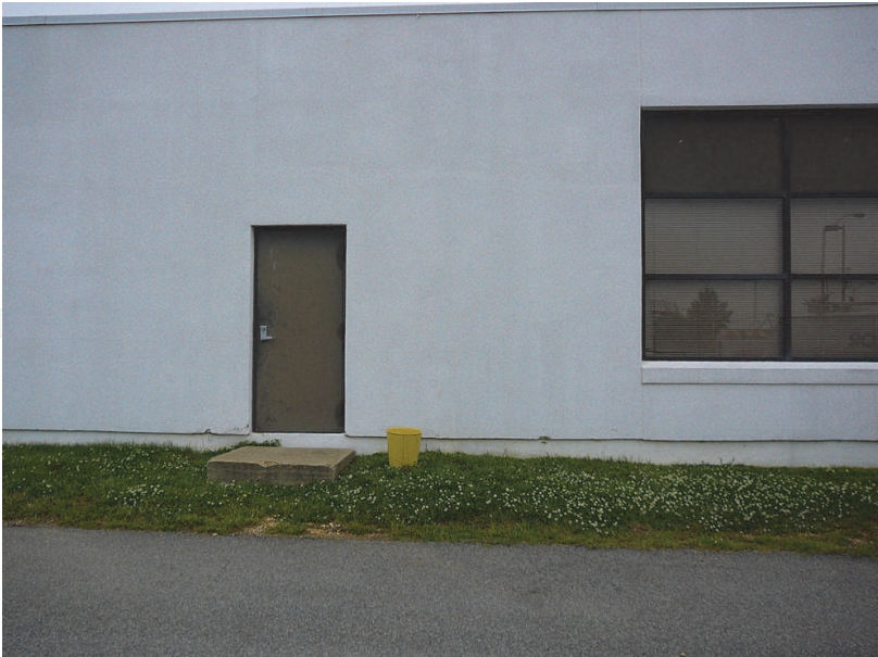
Fig. 2. Image from a AR user on the ground.