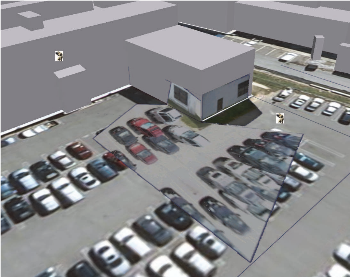
Fig. 4. Recreated 3D scene viewed with 3D buildings on Google Earth. The two field operator's icons and the video image are overlaid on Google Earth.

(the windows, the door, and part of the walls) is projected on vertical polygons representing the walls of the building. The model of the building is from the database used in our AR/MR system. When the texture was created, the part that is not covered by the video image is transparent so it blended into the aerial image well. The part of the view blocked by the building is removed from the projected image on the ground.