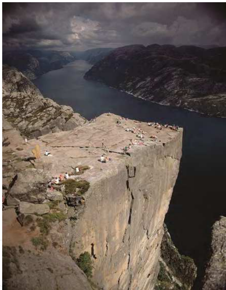
Fig. 6. Prekestolen at Lysefjorden, SW Norway. Rock-falls and landslides that will run into narrow fjords and create tsunamis which will damage near-shore settlements and infrastructure, represent potential large geohazards in Norway.

tsunamis, damaging near-shore settlements and infrastructure (Harbitz et al., 2006). The three natural disasters causing the largest number of deaths in Norway in the 20 th century involved large rock-slides in a narrow lake in Loen (1905 and 1936) and in Tafjord (1934) (Nadim et al., 2008). Currently, several unstable mountain-sides in western and northern Norway are being monitored to follow movements. A center for monitoring the unstable mountain-side at Åkneset in Storfjorden, and other areas in the Møre-Romsdalen District, is established at Stranda ( www.aknes.no ). Here is also a early-warning system, which will alarm the around 3000 inhabitants in the small communities along the fjord, and the up to 30 000 tourists visiting the World Heritage Site in Geiranger per day in the summer months, when the risk of a major rock-fall and following tsunamis has reached a given threshold, and an evacuation should take place.