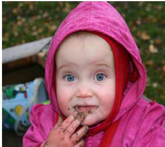
Fig. 5. Children eat soil, and in many cities moderately polluted urban soil in children's play areas represents the greatest health hazard.

The results from the studies of soil pollution at nurseries in the Norwegian cities led the Parliament in 2007 to approve a plan to map the soil pollution and to carry out clean-up operations at nurseries and school playground all over the country (Ottesen et al., 2011). Here it must be mentioned that the results of pollution-mapping in Oslo showed the greatest pollution to be in the oldest districts. All together, action was necessary at 38% of the city's 722 nurseries (Ottesen & Langedal, 2008).