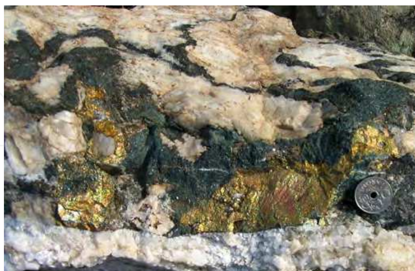
Fig. 2. Copper deposits at Repparfjord in Finmark. The Fennocandian Ore Deposit Database (FODD) contains information on 1300 mines, deposits and significant occurrences across Norway, Sweden, Finland and NW Russia.

commodity grades with a comment on data quality, geological setting, age, ore mineralogy and mineralization styles, genetic models, and the primary sources of data.