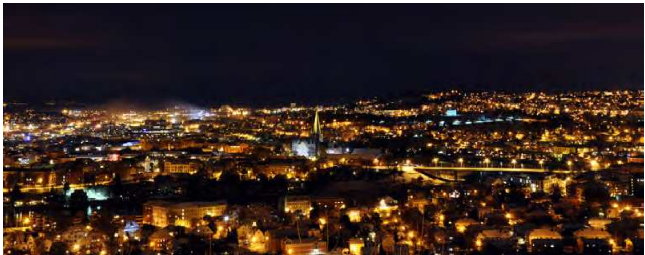
Fig. 1. The city of Trondheim (area: 342 km 2 ), with a present population of 175 000 citizens. In 2050 the number of citizens is expected to be 220 000. Presently, 80% of the Norwegian population lives in urban areas.

demand and battle for natural resources; food, water, energy and minerals. This situation will demand us to find new innovative solutions for resources management and use of materials. While we today dispose of our electronic and other modern consumables when they become tired, either for an upgrade or because it is cheaper to replace them than it is to repair them, Homo sapiens futureensis will have a different approach. In the years in front of us, the concept of urban mining will be established as a standard in the New World. Recycling of metal-containing consumables like cell-phones will not only be profitable, but most likely also be required as we only have finite resources with which to build them. According to some estimates ( http://urbanmining.org ) up to 30 times as much gold can be found in cell phone circuitry as can be found in the gold ore processed in gold mines (some 150 grams, or 5.3 ounces, per ton, compared to a measly 5 grams, or 0.18 ounces per ton). To add to that, the same quantity of cell phones also contains 100 kg of copper and 3 kg of silver, as well as numerous other materials. After the devices are processed and the materials separated, these valuable metals can be sold on as high quality raw materials to build new products, which in turn also can be recycled.