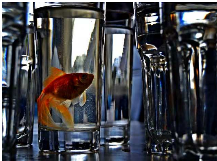
Fig. 3. Groundwater is the largest and most reliable of all freshwater resources. In many areas most drinking water is groundwater; up to 80 % in many European countries and Russia, and even more in North Africa and the Middle East.

freshwater in bulk is in the pipeline. Europe consumes increasing amounts of bottled mineral water, and bottled water, usually derived from groundwater, is rapidly becoming the main drinking water supply.