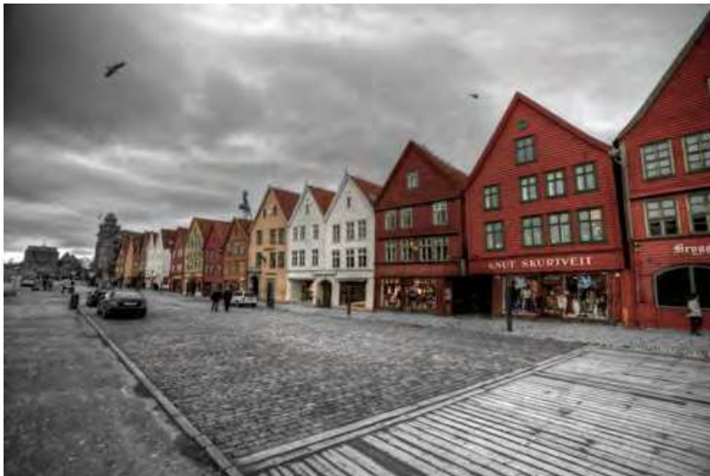
Fig. 8. The level and quality of groundwater are decisive for preserving valuable archaeological occupation layers in their original position, such as at UNESCO World Heritage Site Bryggen in Bergen, western Norway. “Groundwater data from NGU is helping to save Bryggen in Bergen”, Jørn Holme, Head of the Norwegian Directorate for Cultural Heritage.