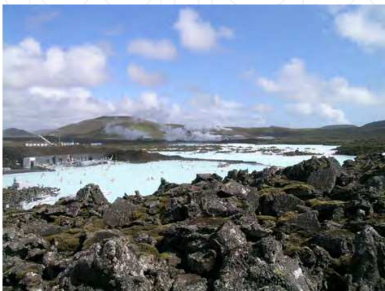
Fig. 4. The Blue Lagoon on Iceland, where people can enjoy the hot water generated from the geothermal powerplant seen in the background.

where there are have very thin crust associated with volcanic activity. One profound example is Iceland, with its sub-aerial exposures of the Mid-Atlantic Ridge, manifested by active rift zones extending from northeast to southwest on the island. The active volcanism produces a high heat flow to the surface, caused by magmas emplaced in the upper crust. This heat is extracted from both “high temperature fields” within the active volcanic zones and “low temperature fields” outside these zones. The heat is extracted as hot water and steam and is used for district heating, industrial purposes and power generation, offering a cheap and environmentally benign source of energy for the Icelandic society (Smelror et al., 2008).