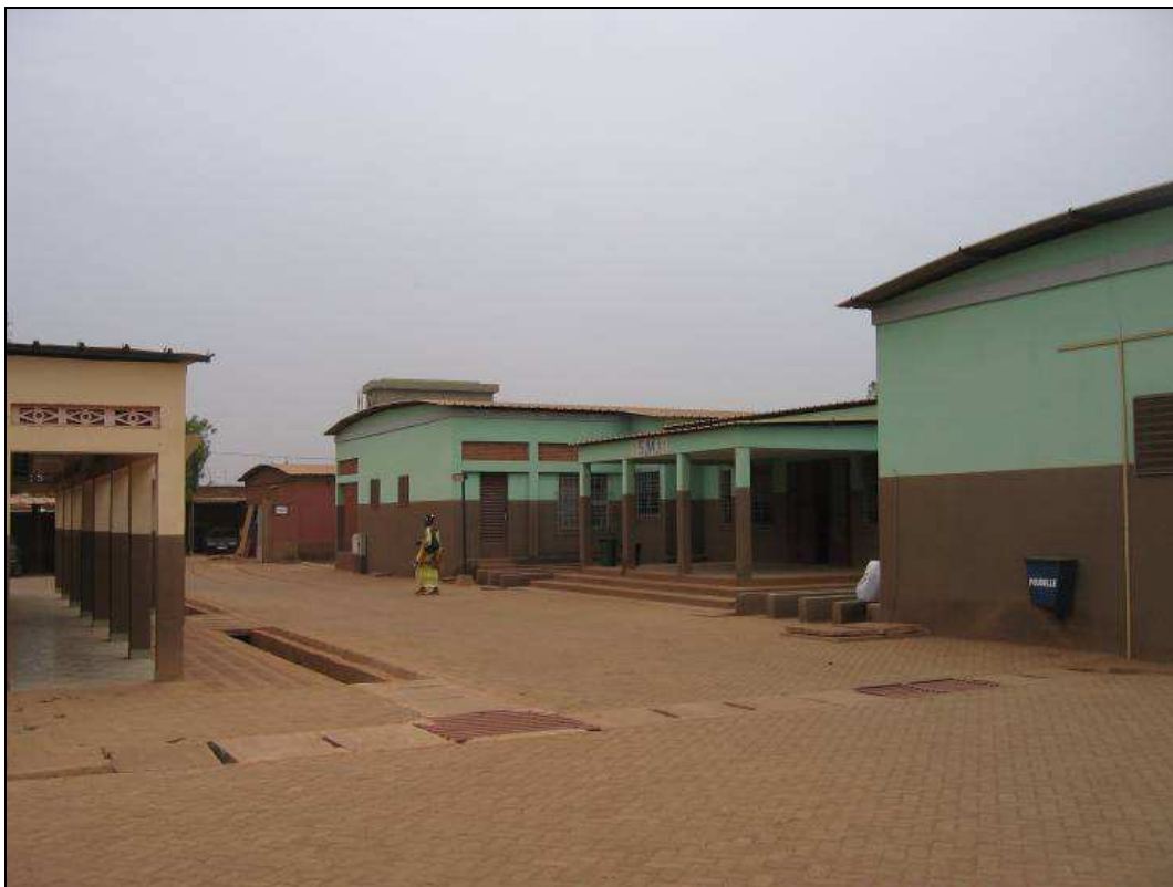
Fig. 1. St. Camille Medical Center

Study site: St. Camille Medical Center (SCMC) in Ouagadougou, Burkina Faso, a large mother and child health center, where more than 3000 deliveries take place every year (picture 1). Prevention and care of HIV infection have been carried out since 2002 at the center (WHO 2004). Thanks to a collaborative agreement, physicians from the University of Brescia and from the Spedali Civili General Hospital in Brescia (Italy) have been working in the Center to support local staff and anti-HIV activities.