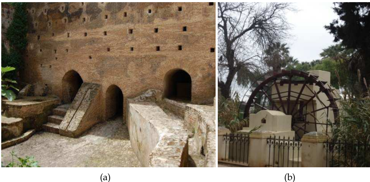
Fig. 5. a) Water distributor, Fes b) Noria from which the water flowed to the distributor

The infrastructure was based on a system of underground tunnels and surface canals where water flowed simply following gravity, down through the old town, the medina. There was also the network of spring water, the drinkable water, linking some twenty springs around the old town into a pottery canals network called the maâda , feeding seventy fountains for public water use, as well as private houses. Finally the water sanitation network was organized underground through the Sloukia which took the water outside the city towards the Oued Sebou. At the time when that structure was built, the network was sufficient for the population it served and the wastes led outside were sufficiently rapidly biodegraded. The various infrastructures and the architectural attention that was paid to them showed how much water was valued. Economically, a fair allocation of water resources was ensured thanks to a careful management of the volume being directed towards various types of activities. Spiritually, water was beautifully present in fountain and ablution rooms of mosks. Environmentally, water was used carefully and recycled as much as possible (e.g. the water from fountains was re-orientated for it to be re-used in gardens) before it was got rid of.