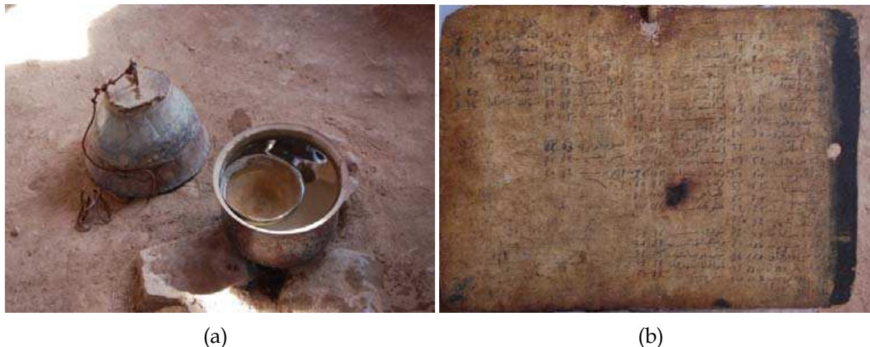
Fig. 3. a) Water clock in Southern Morocco – it takes 45 minutes to fill the pot, time used as an irrigation unit; b) List of benefiting water users

Water conflict management techniques were also developed in towns, such as Fes, where water circulated through a 70km long network of canals and was regulated by a corporation of specialists called the qanawiyyum .