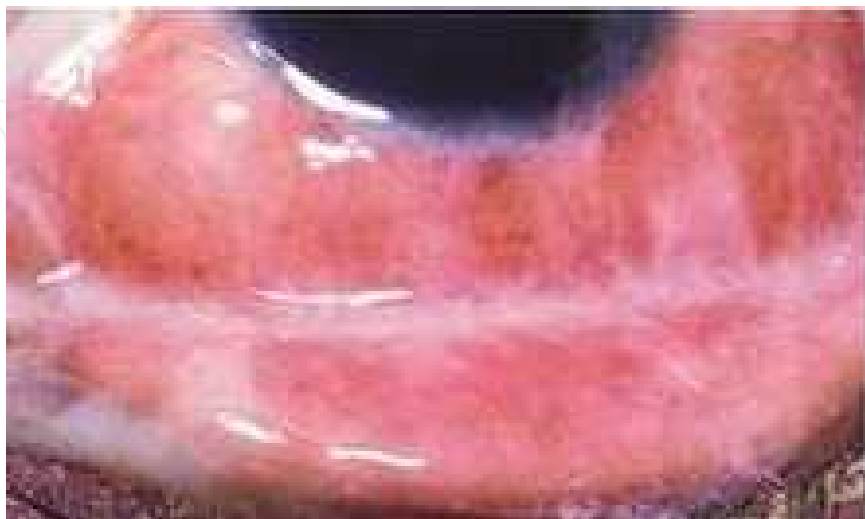
Fig. 1. Bacterial conjunctivitis (Look for the mucous discharge)

soaked with warm water, and to explain the same procedure to the patients, so they can do in home before applying medications. Generally most of the bacterial conjunctivitis cases are treated as outpatient cases but whenever any corneal involvement is suspected it would be ideal to treat the patient as an inpatient.