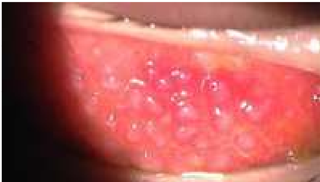
Fig. 3. Allergic conjunctivitis (Look for follicles and papillae)

Allergic conjunctivitis comprises a group of diseases affecting the ocular surface and is usually associated with type 1 hypersensitivity reactions. Two acute disorders, seasonal allergic conjunctivitis and perennial allergic conjunctivitis, exist, as do 3 chronic diseases, vernal keratoconjunctivitis, atopic keratoconjunctivitis, and giant papillary conjunctivitis.