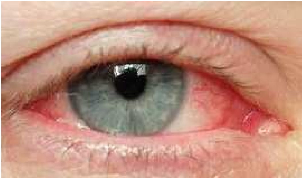
Fig. 2. Viral conjunctivitis (Look for pink eye without any discharge)

Herpes infection of the eye may be acquired as the patient's first exposure to the virus (primary infection) or as involvement of a new anatomical site (the eye) in a patient with previous HSV infection. In either case, patients with herpetic eye infection risk recurrent eye disease throughout their lives. The infective lesions of the corneal epithelium (dendritic and geographic ulcers) occasionally develop into non-infective indolent or trophic ulcers, particularly under the influence of cauterizing chemicals or corticosteroids. Inflammation of the corneal stroma may accompany herpetic epithelial lesions or occur independently. Stromal keratitis probably represents the host's immune response to viral antigens filtering down from epithelial lesions or from viral replication in stromal cells.